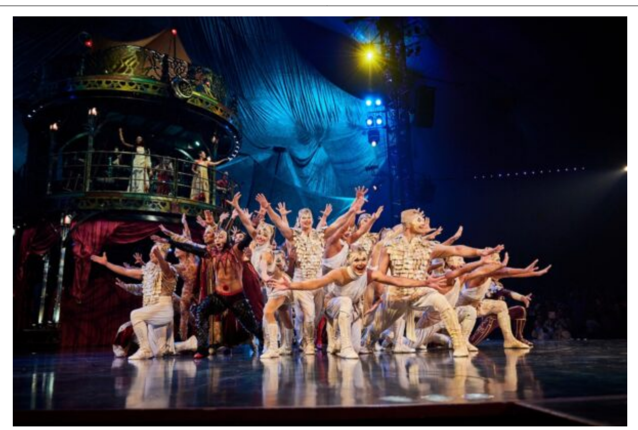
Cirque du Soleil.