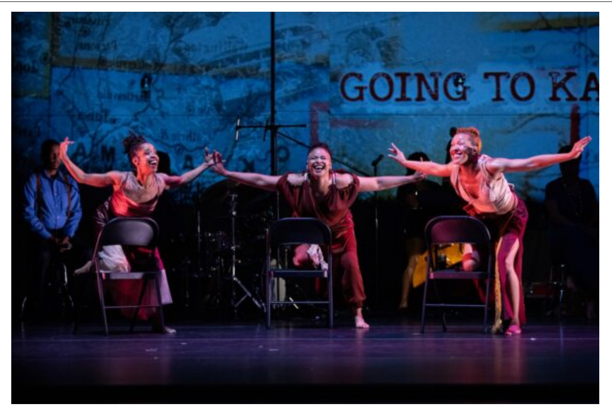
Urban Bush Women.