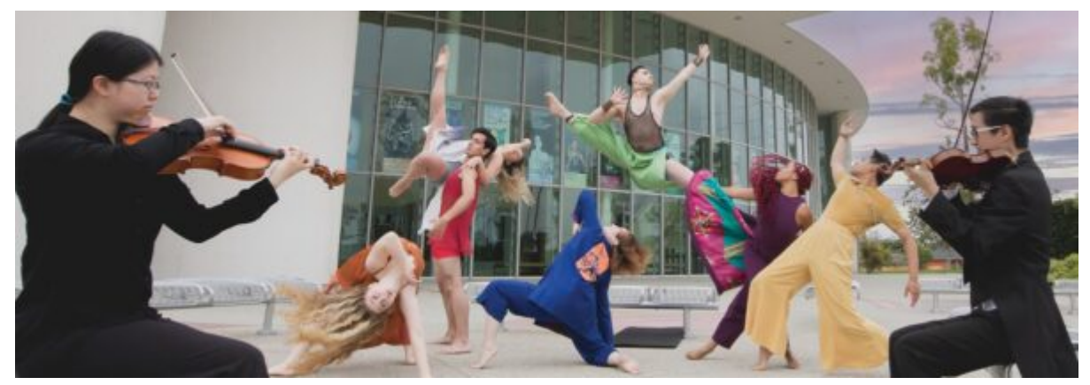
Cal State University Dance.

St., Long Beach; Fri.-Sat., Nov. 22-23, $25-$30. CSULB.