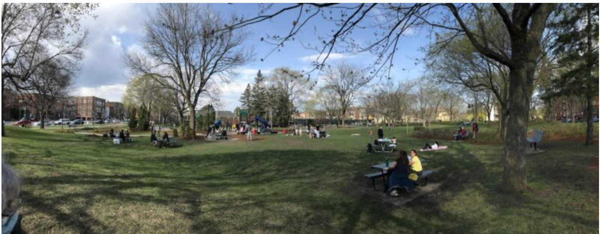
Topographical articulation of a park thematic areas

In this version of the feature image we have focused on the spatial distribution of occupants in order to structure the sense of depth of the image: from picnickers in the fore and middle grounds, to the children play area at middle to back grounds with the big-muscle playing field next to the park farthest edge lined with buildings.