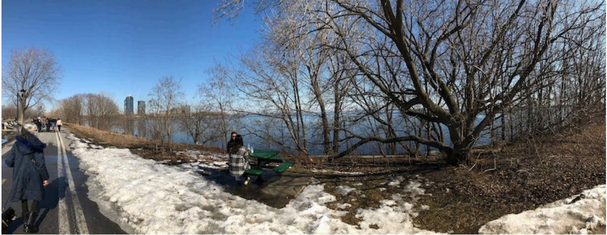
The case of the river front linear park

A picnic table keeps company with the river side and its horizon while a bike trail is appropriated by early spring promeneurs. While the landscape elements structure the image, people and buildings seem to establish a scale of distances for the viewer.