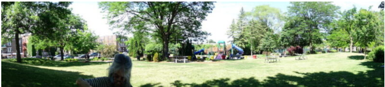
Objective scope and subjective meaning of the panoramic image

The feature image reprised below can begin to give us keys to such process: