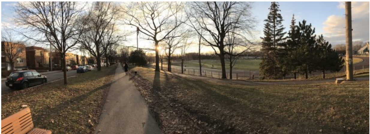
Perceptual synthesis of space and time