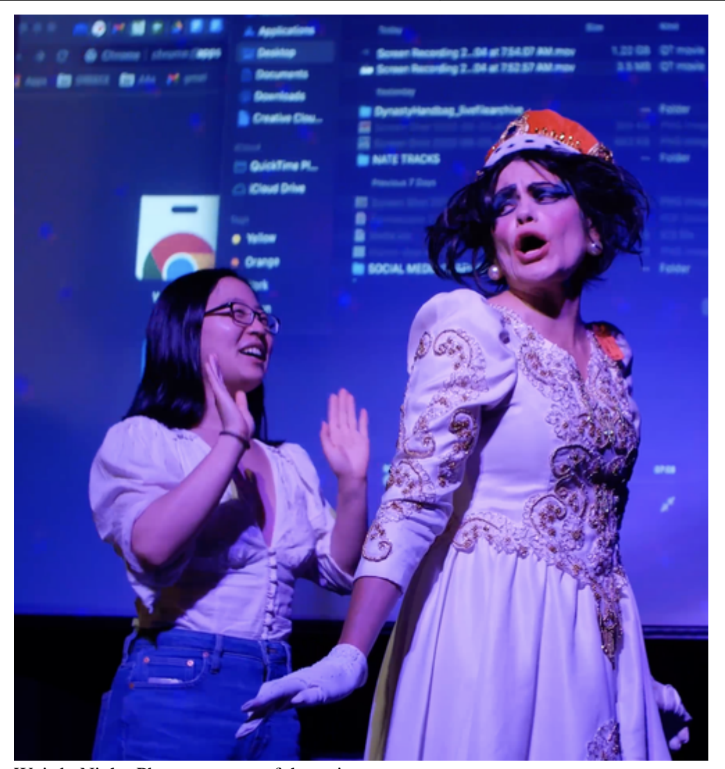
Weirdo Night.