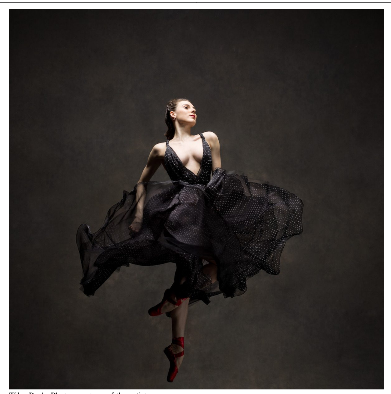
Tiler Peck. Photo courtesy of the artist

State Street Ballet : Giselle at the Granada Theatre, 1214 State St., Santa Barbara; Sat., Oct. 21, 7:30 pm, Sun., Oct. 22, 2 pm, $38-$121, $26 children. Granada Theatre.