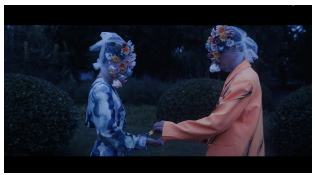
Dare to Dance in Public Film Festival (D2D).

Dare to Dance in Public Film Festival (D2D) : Round 6 at Glorya Kaufman Performing Arts Center at Vista Del Mar, Cheviot Hills; Sat., Oct. 21, 2 pm, 4 pm, 5:45 pm, 6:30 pm, $20-$60. Eventbrite.