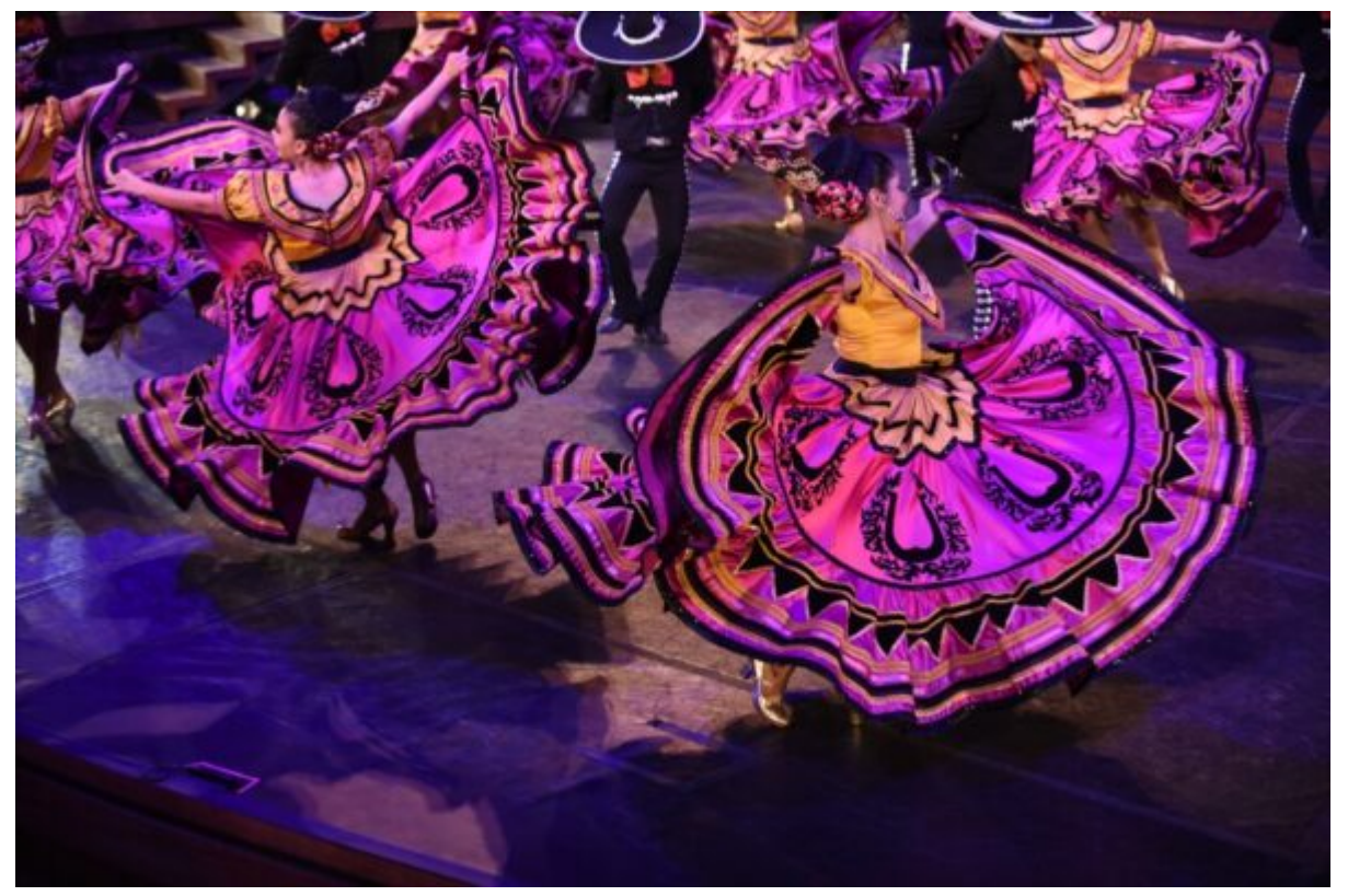
Grandeza Mexicana Folk Ballet Company. Photo courtesy of the artists

Company celebrates its 20<sup>th</sup> anniversary with a special concert. Since 2003, the troupe founded by Jose Vences has brought Mexican folk dance to SoCal stages. This anniversary program includes dance from Mexican regions of Chiapas, Oaxaca, and Tabasco, and the LA premiere of the Dia de Muertos (Day of the Dead) suite, just in time for the upcoming holiday. The Ford Theater, 2850 Cahuenga Blvd. East, Hollywood; Sat., Oct. 14, 8 pm, $49. The Ford.