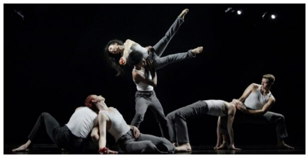
Invertigo Dance Theatre.