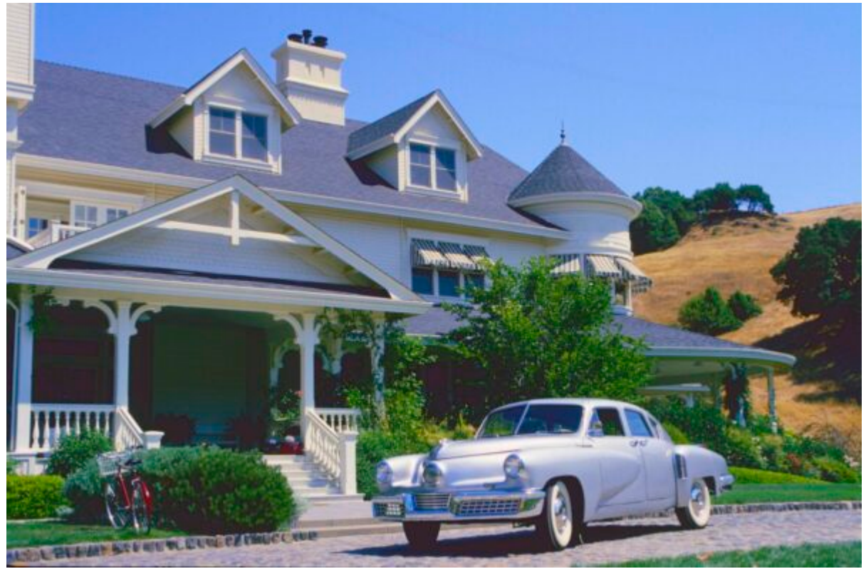
Tucker at Lucasfilm

I remembered the numerous times I interviewed Coppola, an Italian-American like myself, and two special occasions in particular.