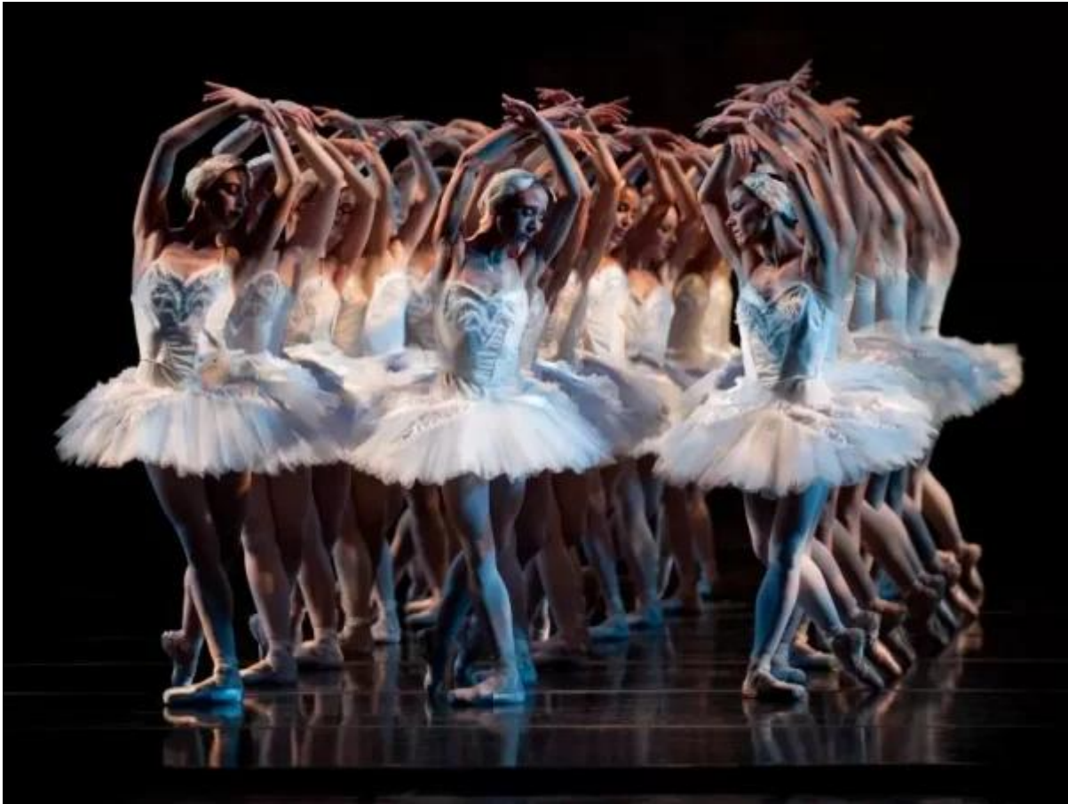
ICBT Pace Ballet.