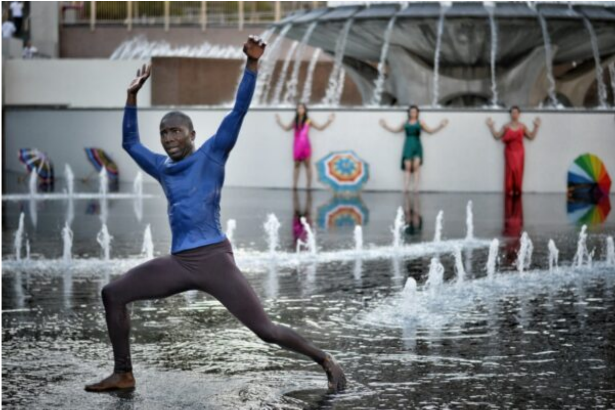
Contra-Tiempo Dance Theatre.