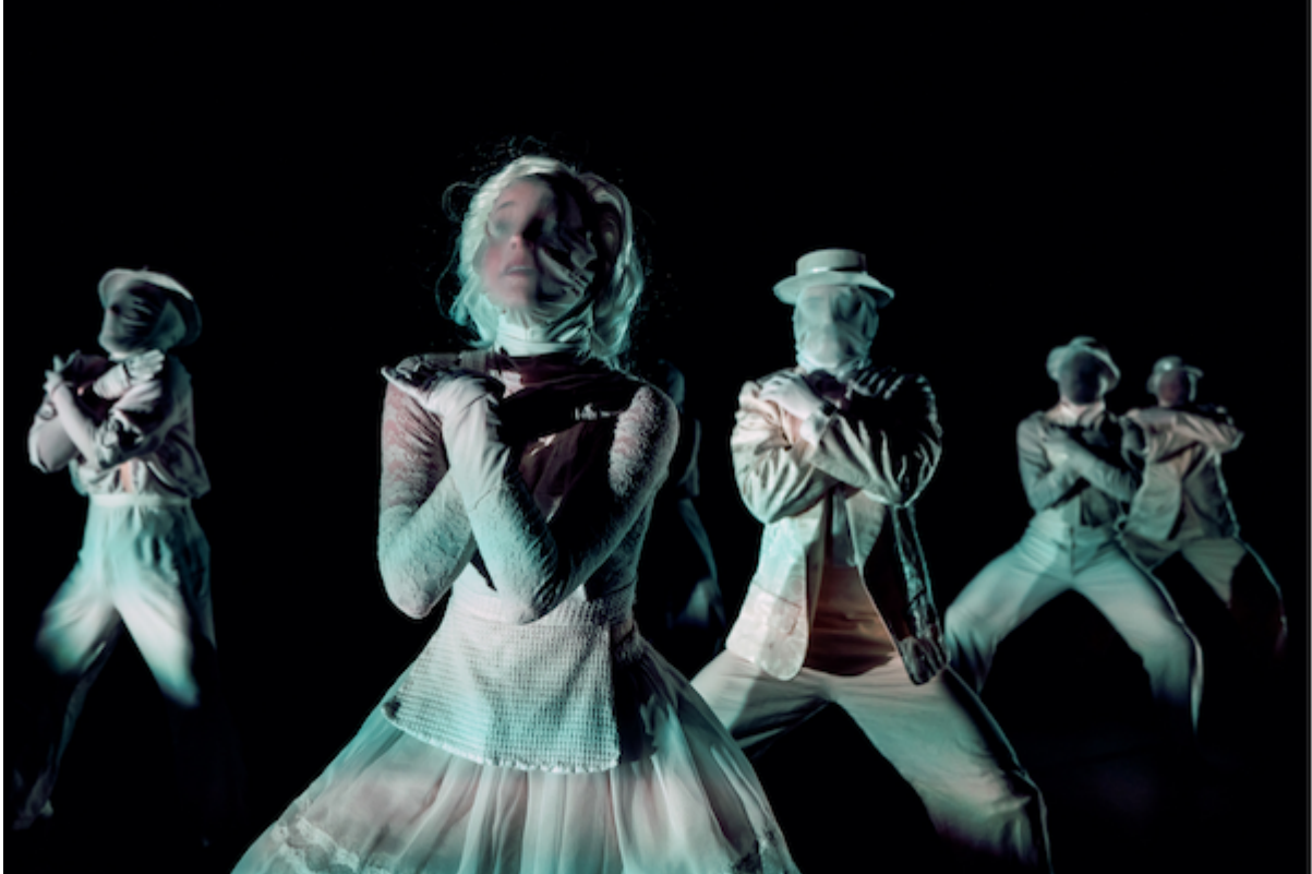
LA Contemporary Dance Company.

L.A. Contemporary Dance Company (LACDC) — where the water is warm at the Gloria Kaufman Performing Arts Center, 3200 Motor Ave., Cheviot Hills; Fri.-Sat., Oct. 25-26, 7:30 pm, $25-$65. where the water is warm.