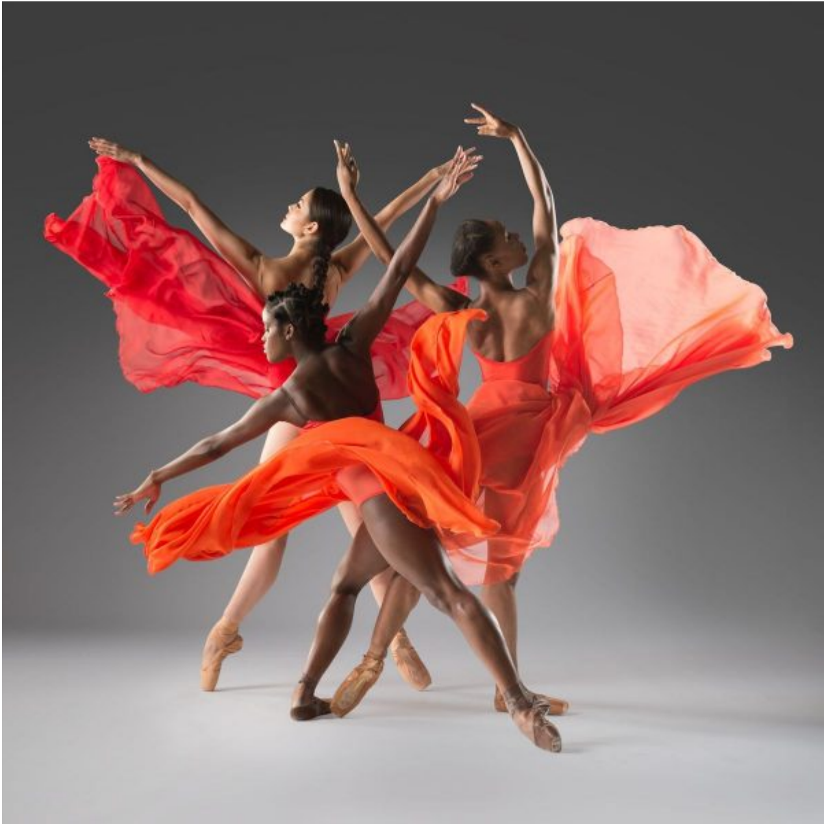
Dance Theatre of Harlem.