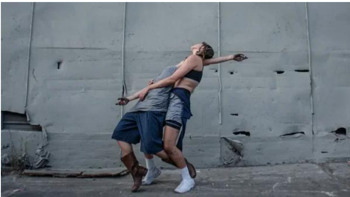
G?R Collective.

In its immersive, multi-media work Gasket , the G?R Collective considers a conceptual “gasket” that seals past and present memories, but remains prone to leak or rupture, and what happens when that occurs. The two part event begins as audiences encounter an installation with ruins of a forgotten world and in the next space untangle the before and after of the encounter of the first kind. Highways, 1651 18th St., Santa Monica; Fri.-Sat., Oct. 18-19, 8 pm, $20. Highways Performance .