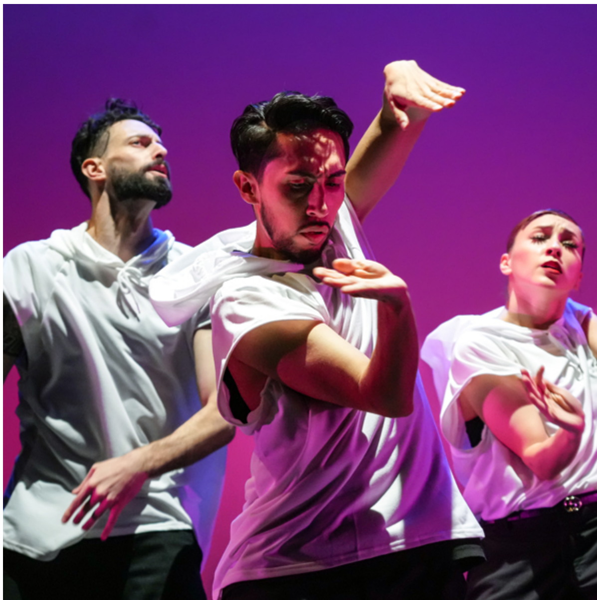
Versa-Style Dance Company.

The Hip Hop 1 v 1 Battle this week is the fourth event lead-up to the 2025 Versa Style Dance Company Festival next May. The victor automatically qualifies for the festival without competing in the preliminaries. Mihran K. Studios, 135 N. Victory Blvd., Burbank; Fri., Oct. 18, 8:30 pm, $15 (to watch or compete). Versa Style Dance .