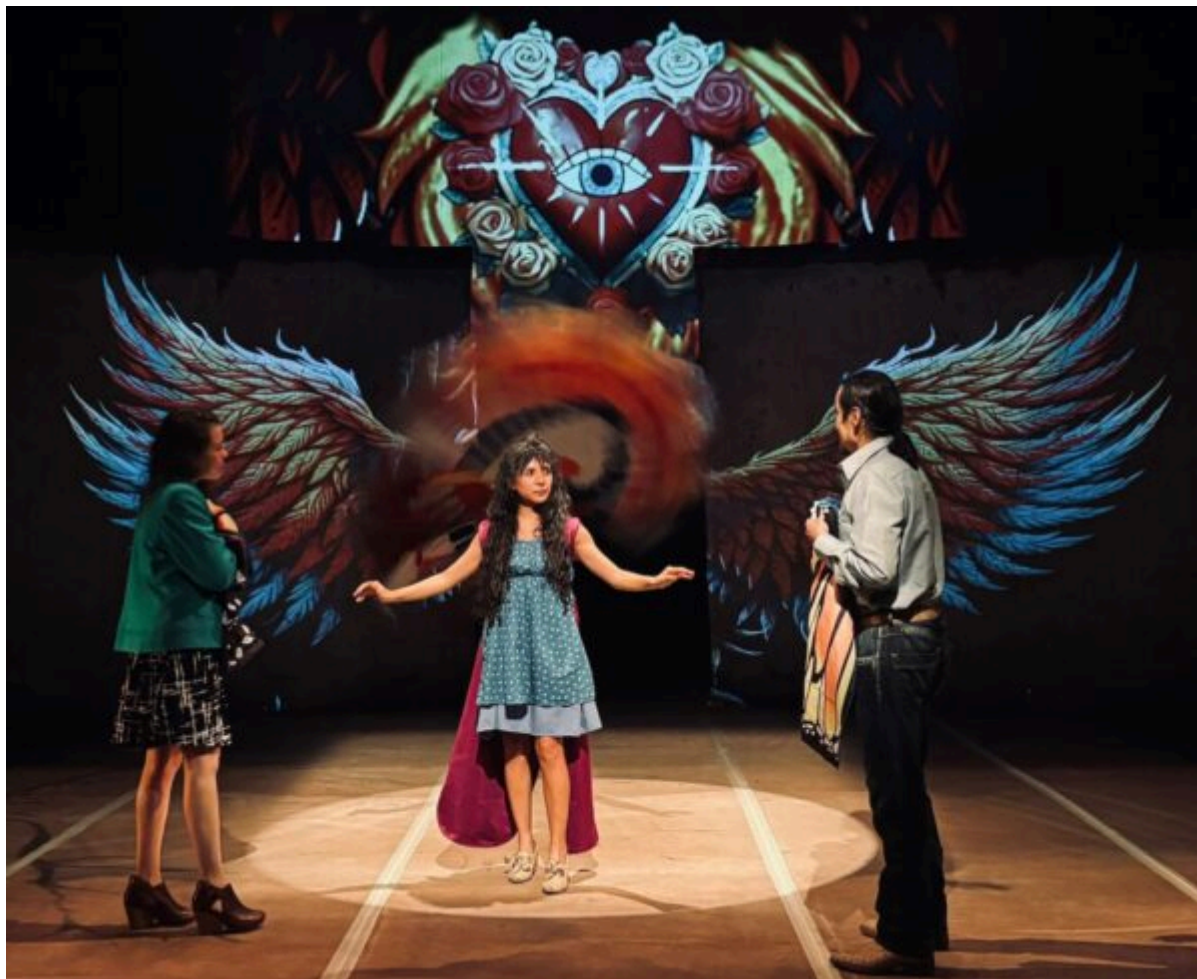
Organización Secreta Teatro.