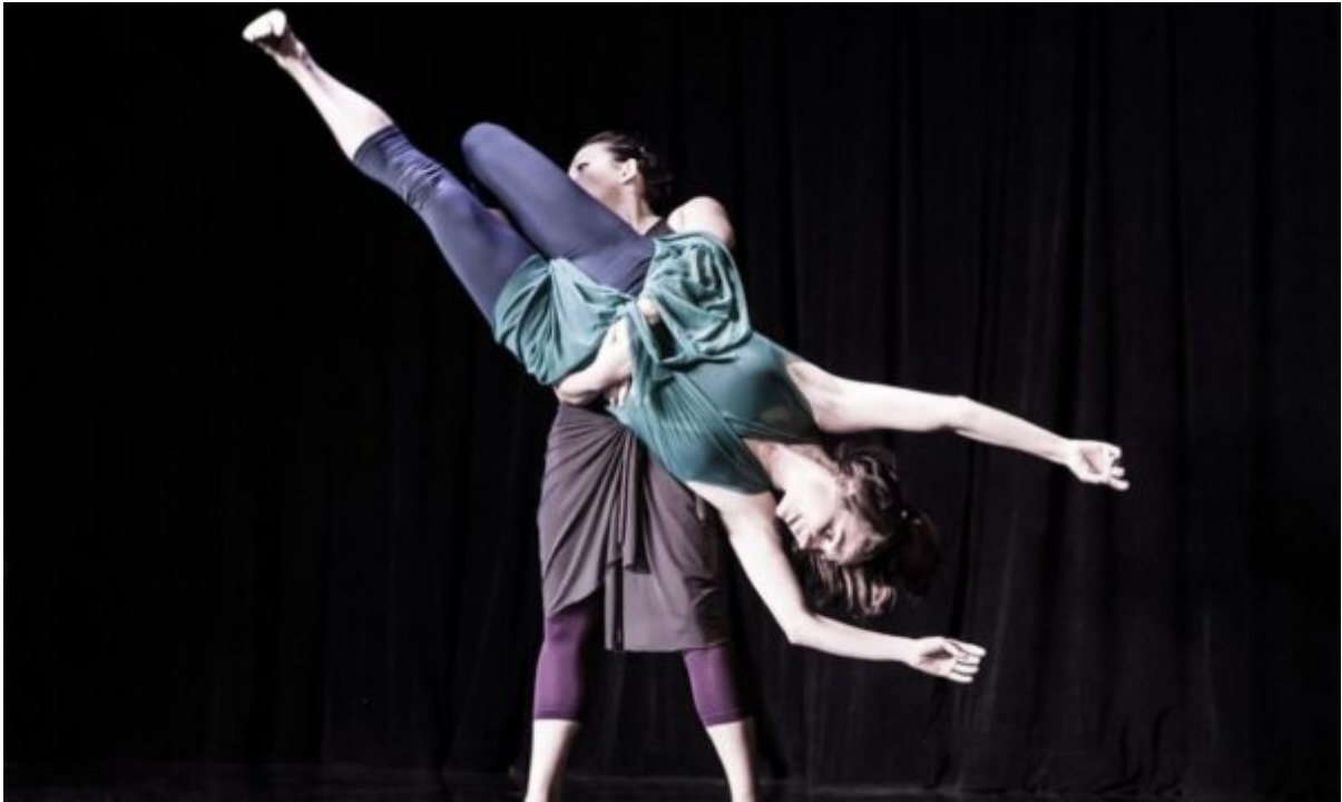
Lineage Dance Company.

Contemporary ballet by George Balanchine, William Forsythe, and Robert Garland are among the repertoire New York's celebrated Dance Theatre of Harlem brings for this visit. Musco Center, Chapman University, 415 Glassell, Orange; Thurs., Oct. 24, 7:30 pm, $45.50-$83. Musco Center .