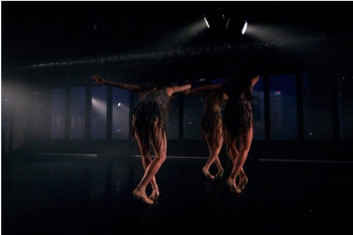
American Contemporary Ballet.