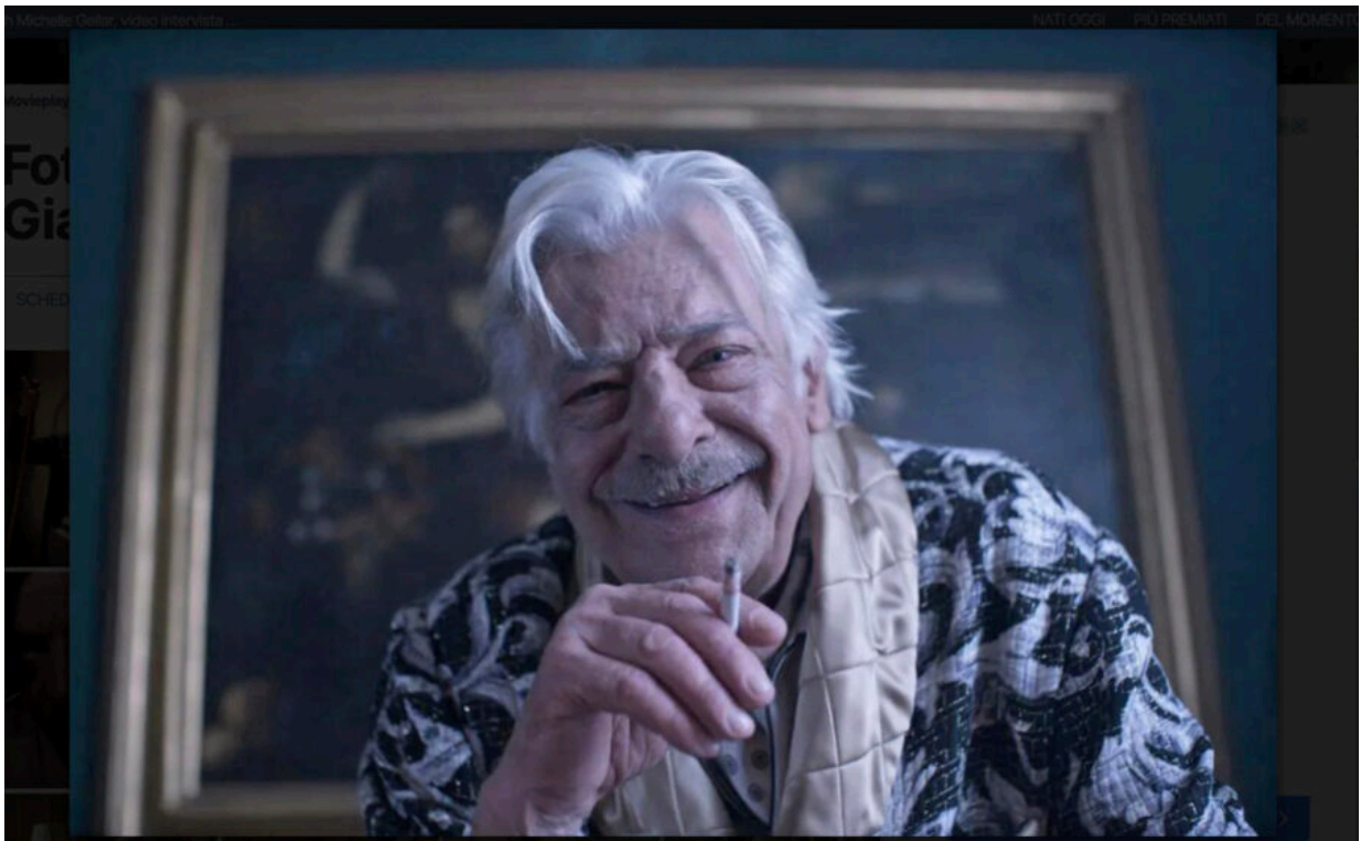
Giannini in Gianni Schicchi

The 80-year-old actor received a Lifetime Achievement Award at Filming Italy on March 3. This event celebrating Italian cinema, with several recent films projected at Harmony Gold on March 1 and March 3, included a retrospective of Giannini's work on the online platform Mymovies.it .