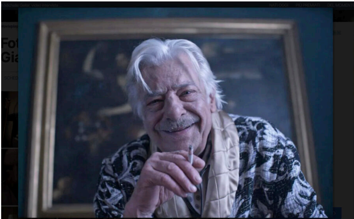
Giannini in Gianni Schicchi

The 80-year-old actor received a Lifetime Achievement Award at Filming Italy on March 3. This event celebrating Italian cinema, with several recent films projected at Harmony Gold on March 1 and March 3, included a retrospective of Giannini's work on the online platform Mymovies.it .