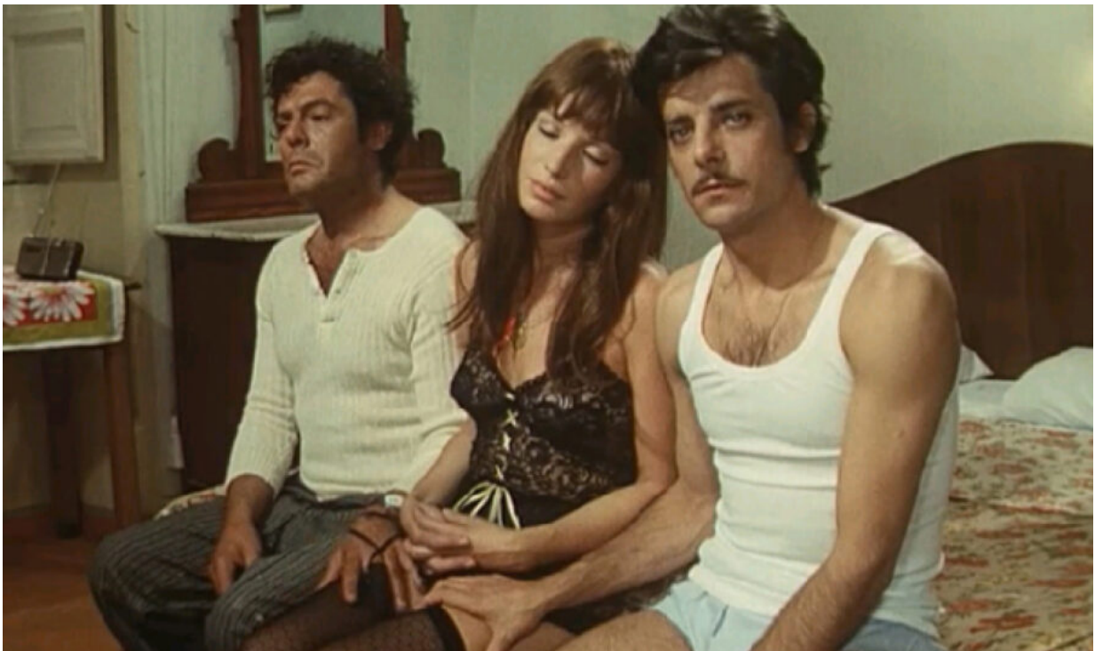
Giancarlo Giannini, Marcello Mastroianni, Monica Vitti

I was also able to see Il male oscuro (1990), directed by Mario Monicelli from the 1964 novel by Giuseppe Berto, where Giannini plays a screenwriter, Emmanuelle Seigner his young wife, Stefania Sandrelli his former lover, Vittorio Caprioli his psychoanalyst. You may see the entire movie on YouTube, watch a scene here .