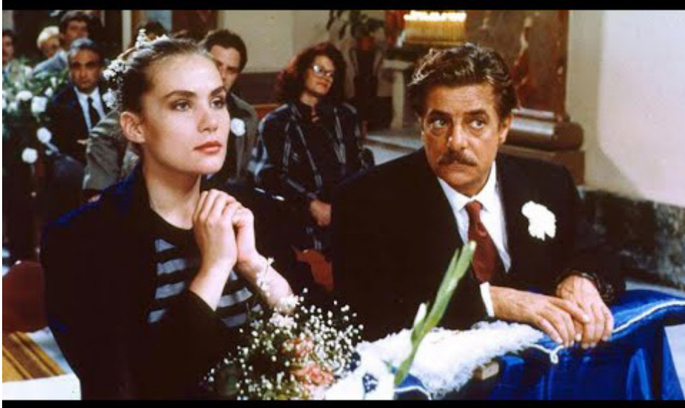
Giancarlo Giannini, Emmanuelle Seigner- Il male oscuro

I was also able to see Il male oscuro (1990), directed by Mario Monicelli from the 1964 novel by Giuseppe Berto, where Giannini plays a screenwriter, Emmanuelle Seigner his young wife, Stefania Sandrelli his former lover, Vittorio Caprioli his psychoanalyst. You may see the entire movie on YouTube, watch a scene here .