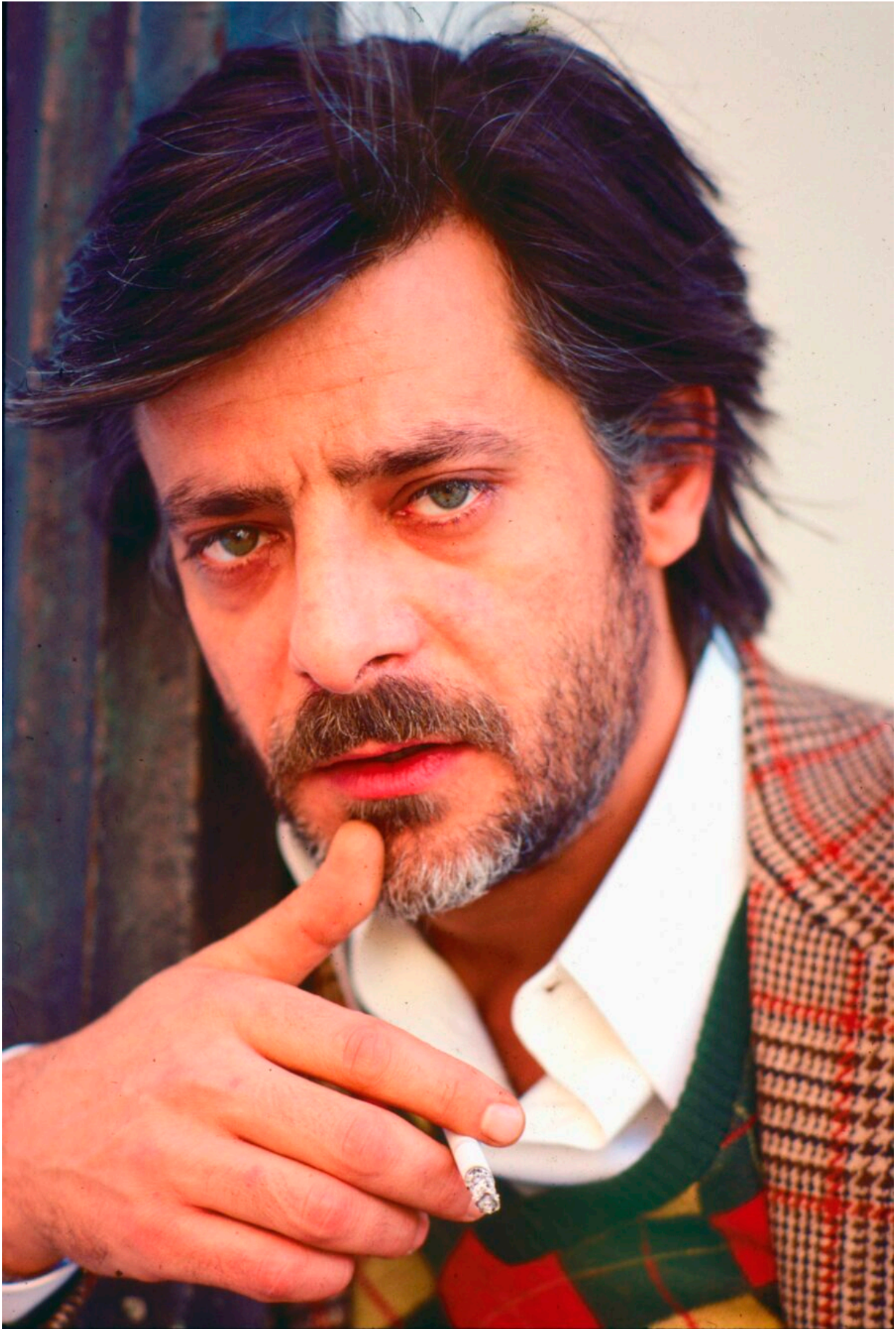
Giancarlo Giannini

For more on Giannini, read my 2019 article here .