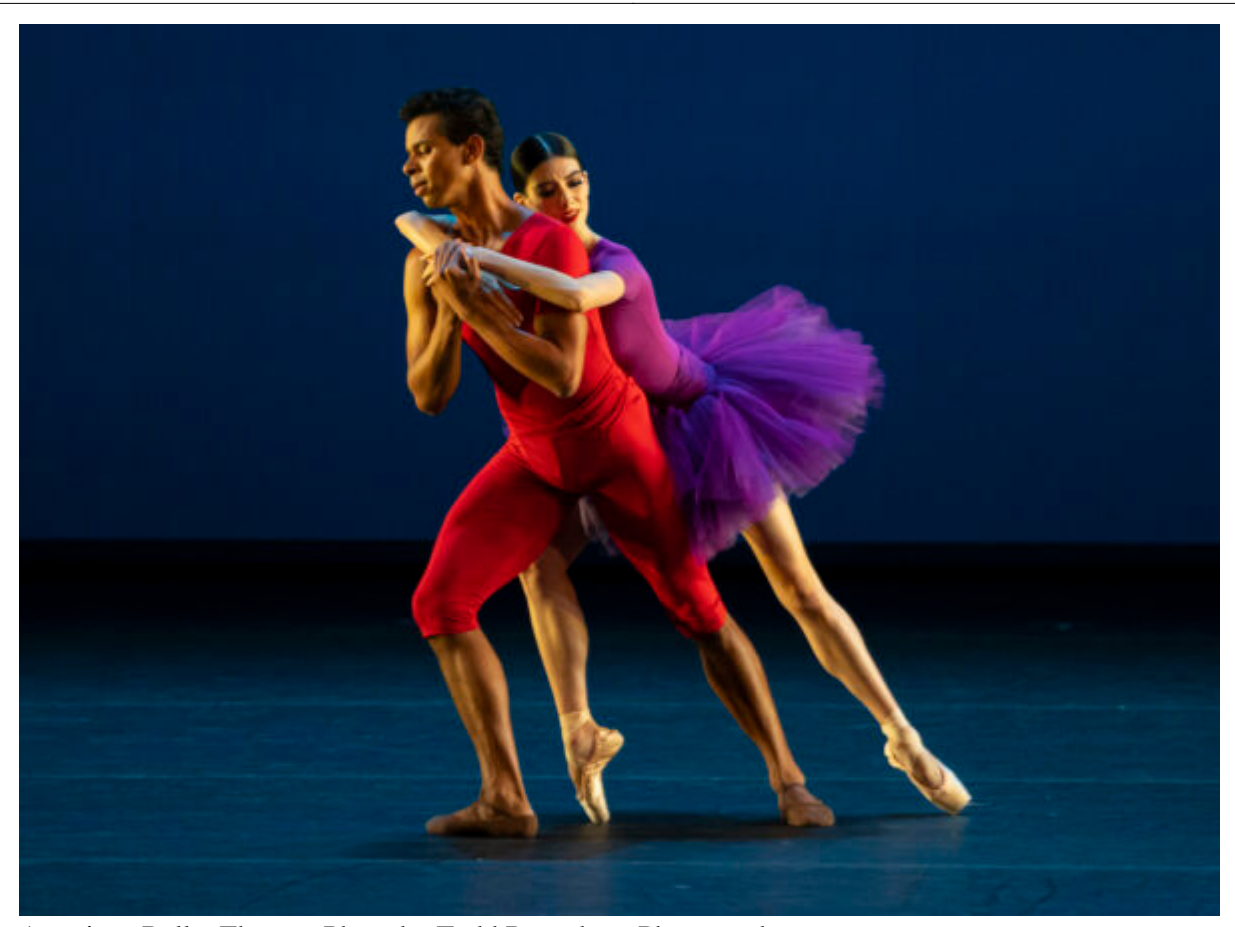
American Ballet Theatre.