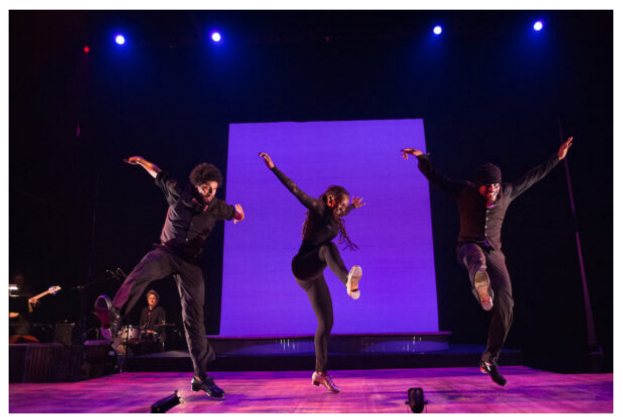
The Super Villainz: A Tap Dance Act for the Modern Age.