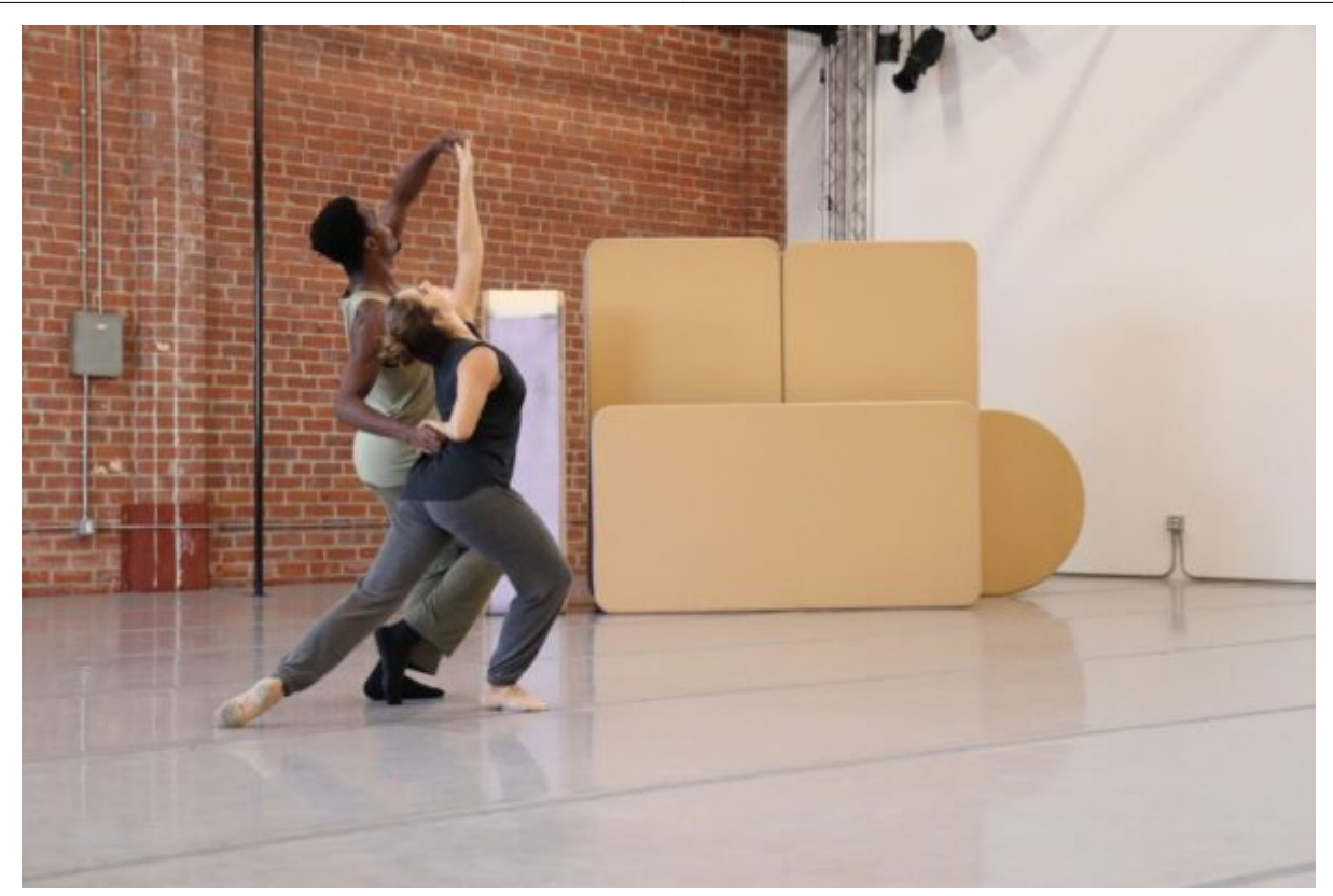
LA Dance Project.