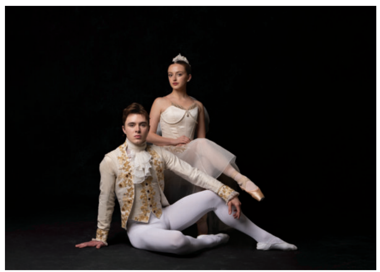
Los Angeles Ballet "Cinderella."