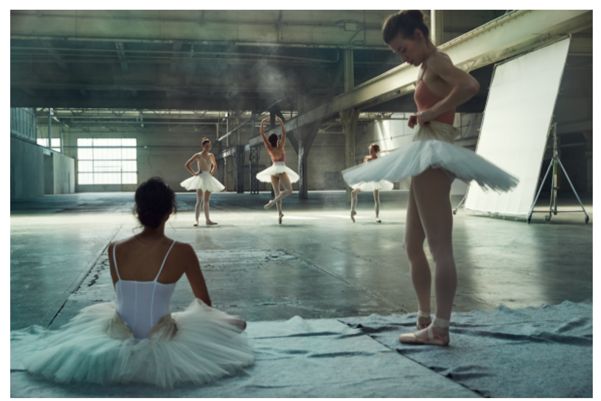
American Contemporary Ballet.