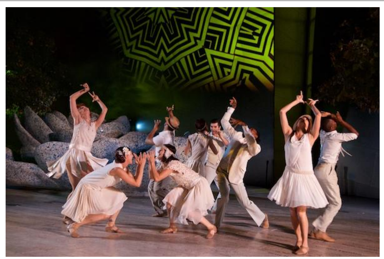
Mixed eMotion Theatrix in "The Great Gatsby."