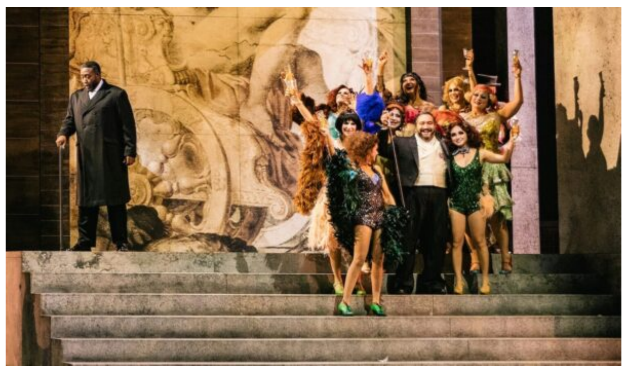
LA Opera's Rigoletto.