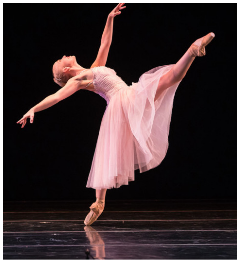
Music Center Spotlight Awards.