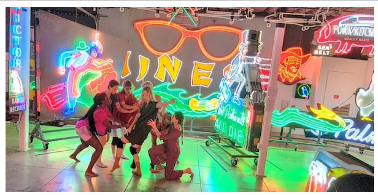
The Volta Collectivve.