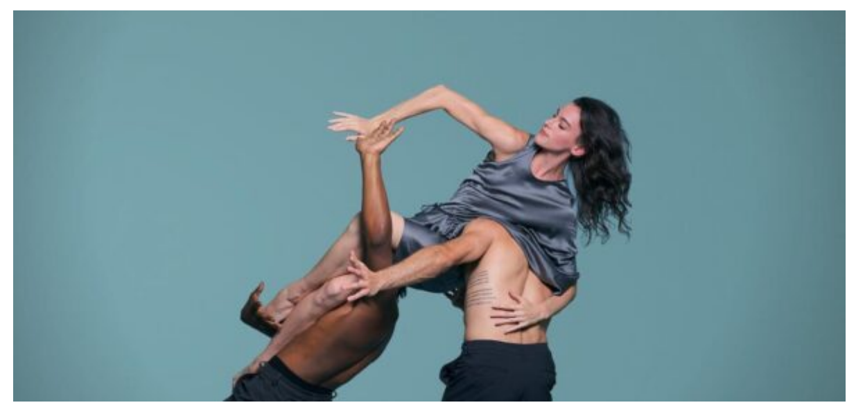
BODYTRAFFIC. Photo courtesy of the artists