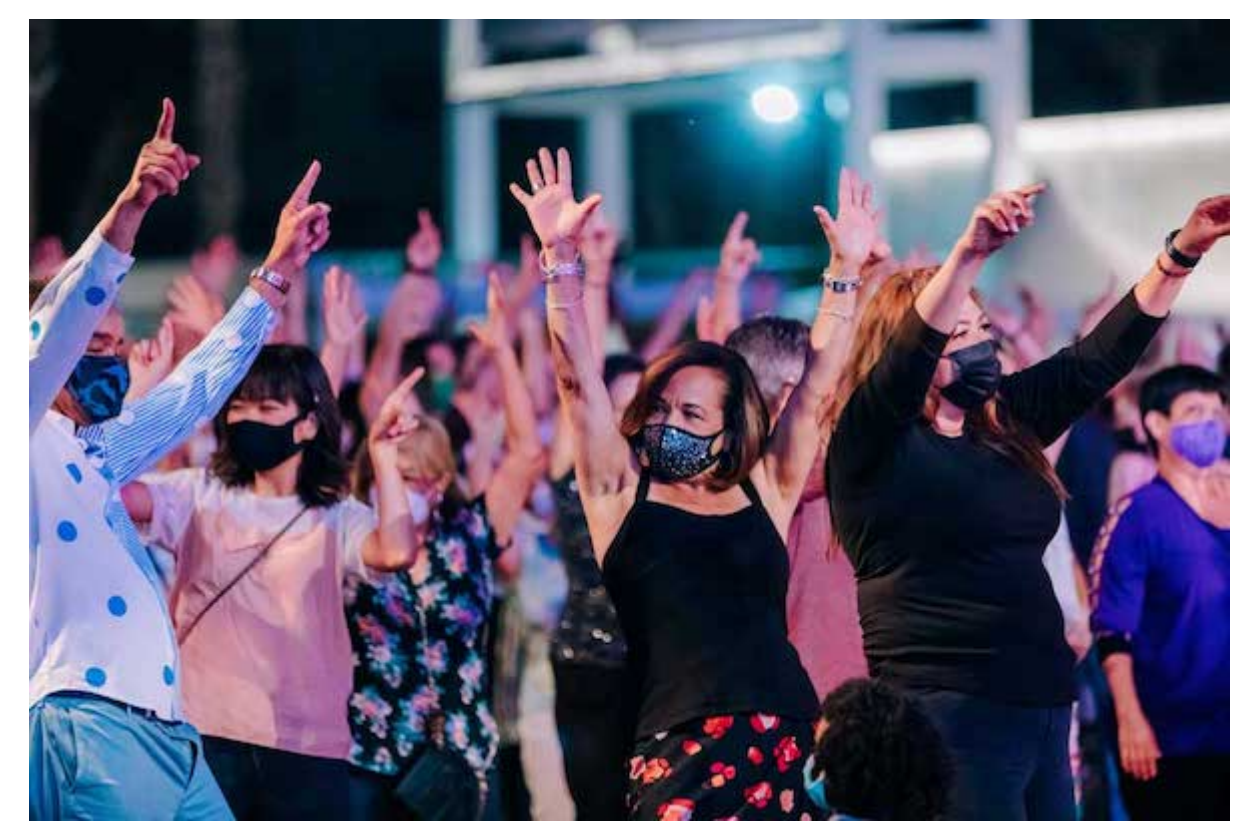
Dance DTLA.