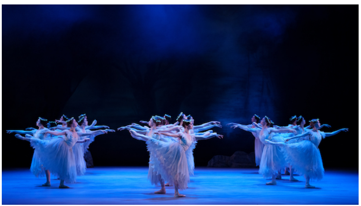
United Ukrainian Ballet.

The United Ukrainian Ballet in Alexei Ratmansky's Giselle at Segerstrom Center for the Arts, 600 Town Center Dr., Costa Mesa; Thurs.-Sat., June 29-July 1, 7 pm, Sun., July 2, 1 pm, $29-$89. SCFTA.