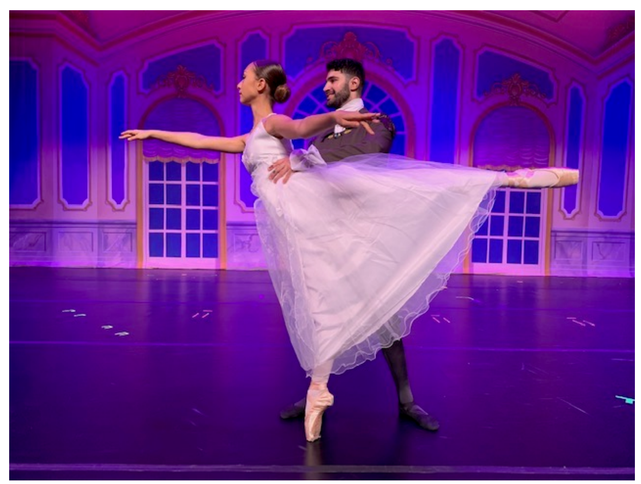
Redondo Ballet.