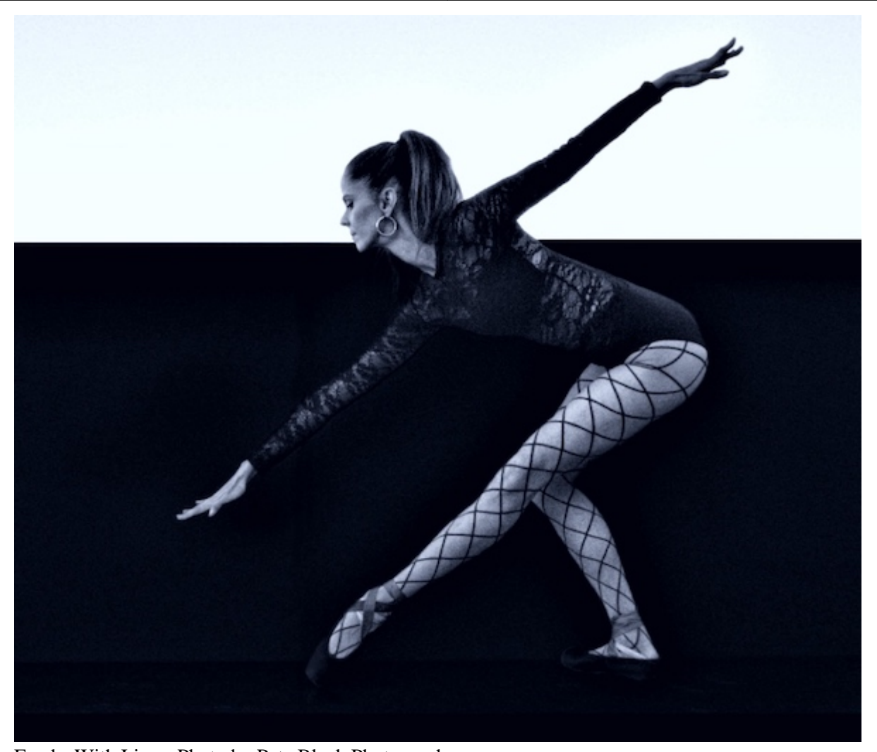
Freaks With Lines.