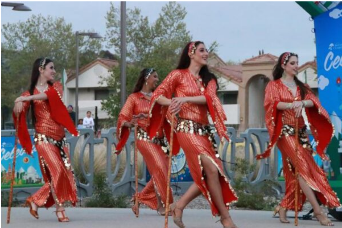
San Pedro ? Festival of the Arts.