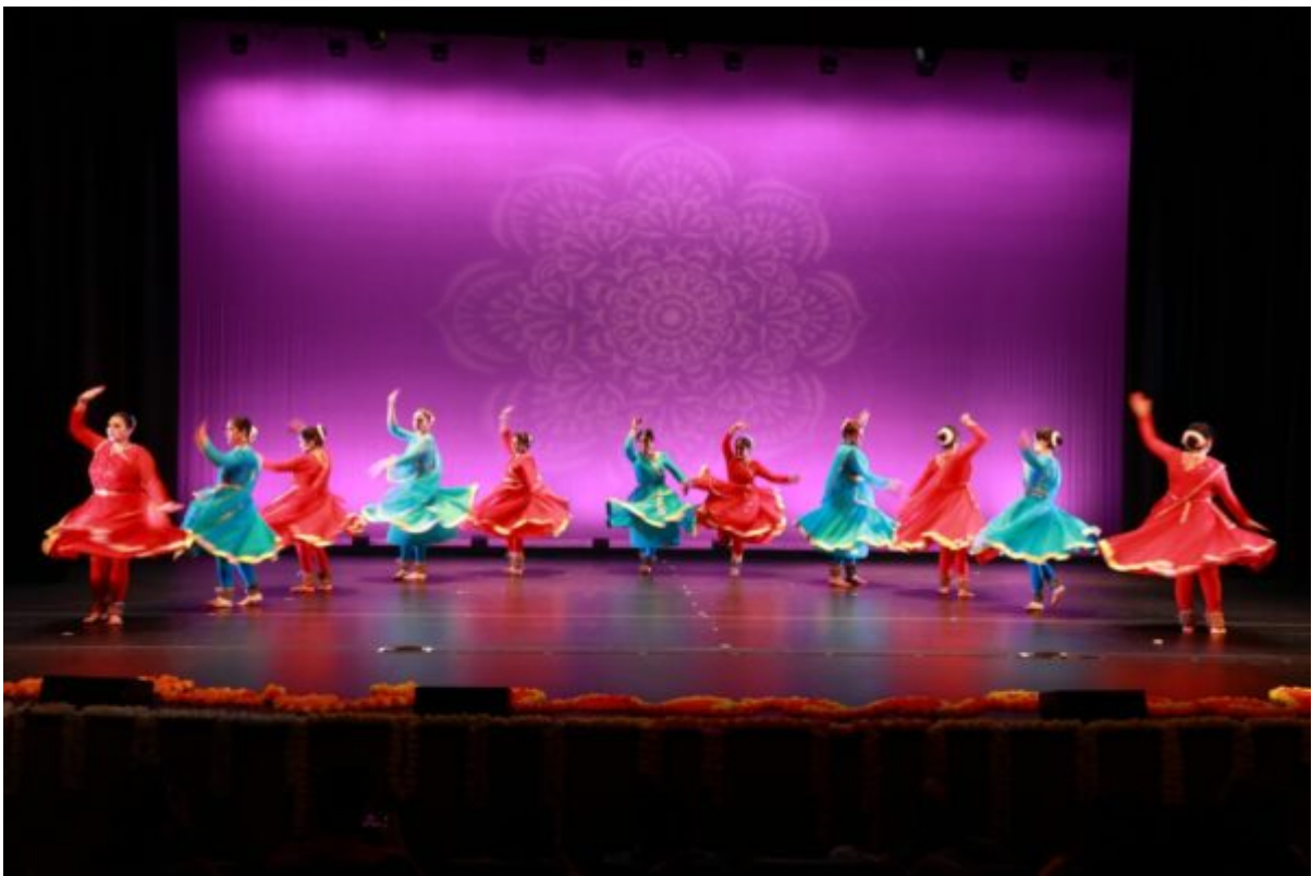
Kathak Kala Kendra Academy.