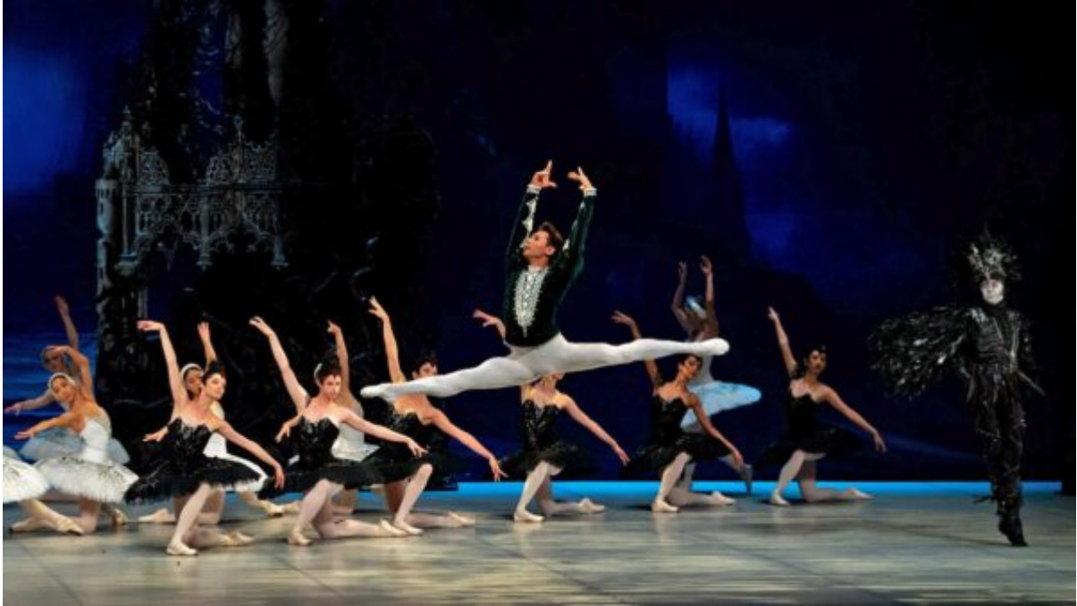
World Ballet.