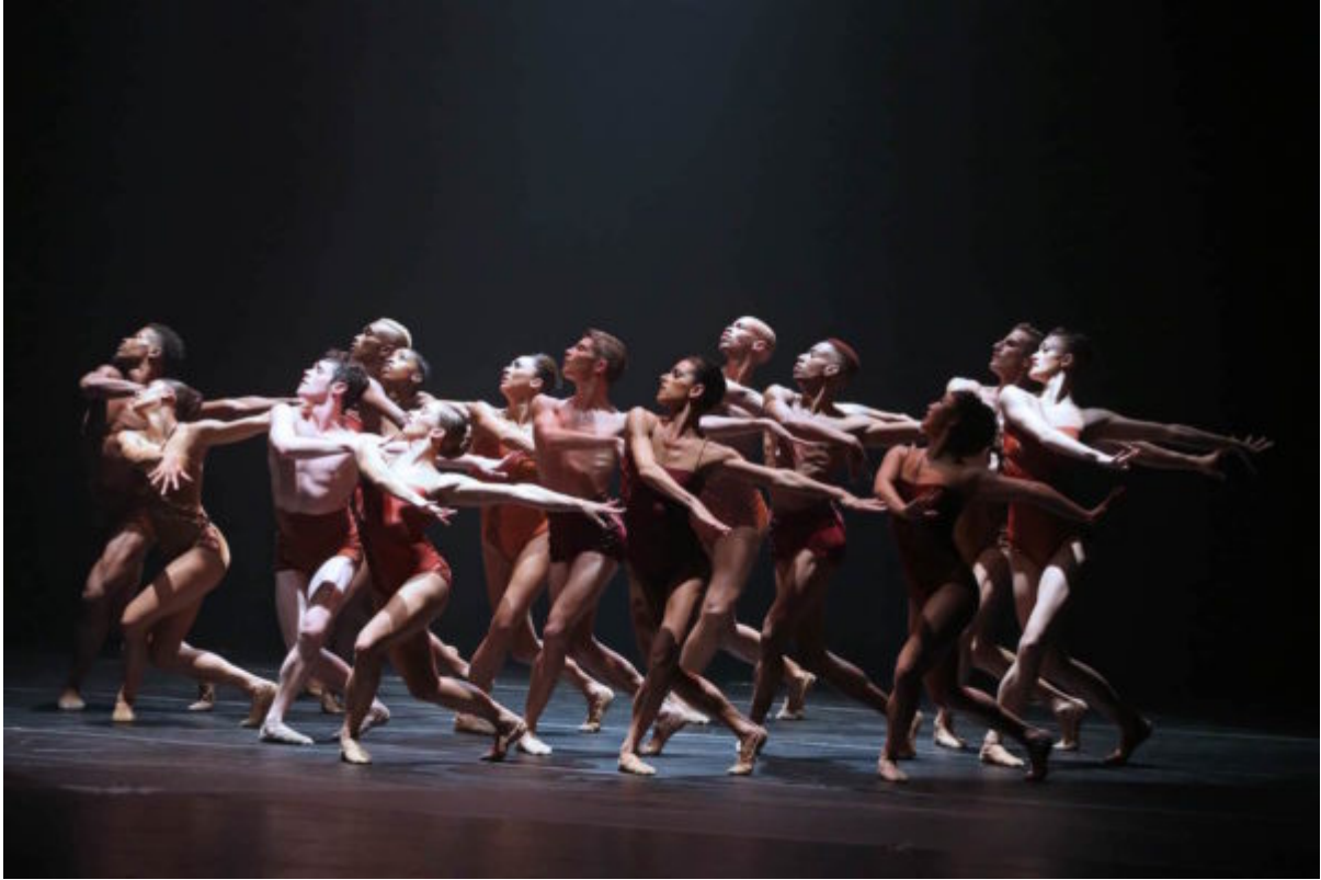
Complexions Contemporary Ballet.