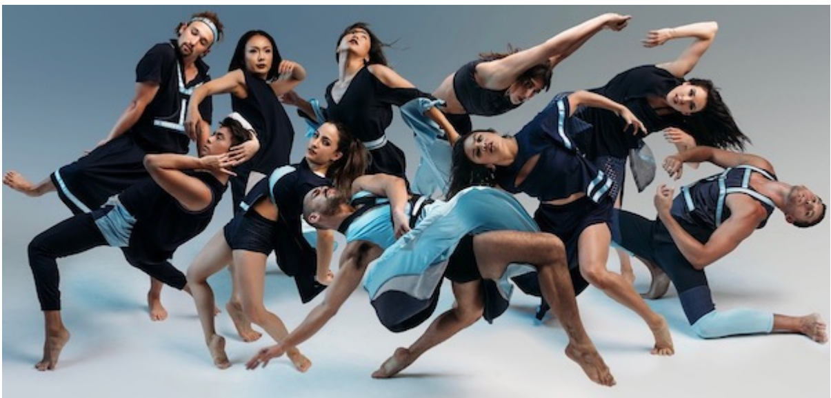
Entity Contemporary Dance.