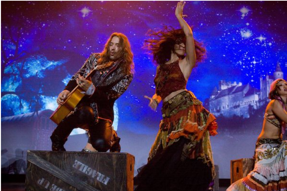
Benise and dancer.

The flamboyant Spanish guitarist Benise is the main attraction, but his shows always bring a bounty of dancers adept at moves beyond the main calling card of flamenco. This tour dubbed Fiesta! stops at three local venues. Fox Performing Arts Center, 3801 Mission Inn Avenue, Riverside; Fri., Sept. 14, 7:30 pm, $35-$96. Tickets . Also at Fred Kvli Theatre, Thousand Oaks Civic Arts Plaza, 2100 Thousand Oaks Blvd., Thousand Oaks; Fri., Sept. 20, 7:30 pm, $36-$115. Tickets . Also at Lobero Theatre, 33 E. Canon Perdido St., Santa Barbara; Sat., Sept. 21, 7:30 pm, $48.50-$101.50. Tickets .