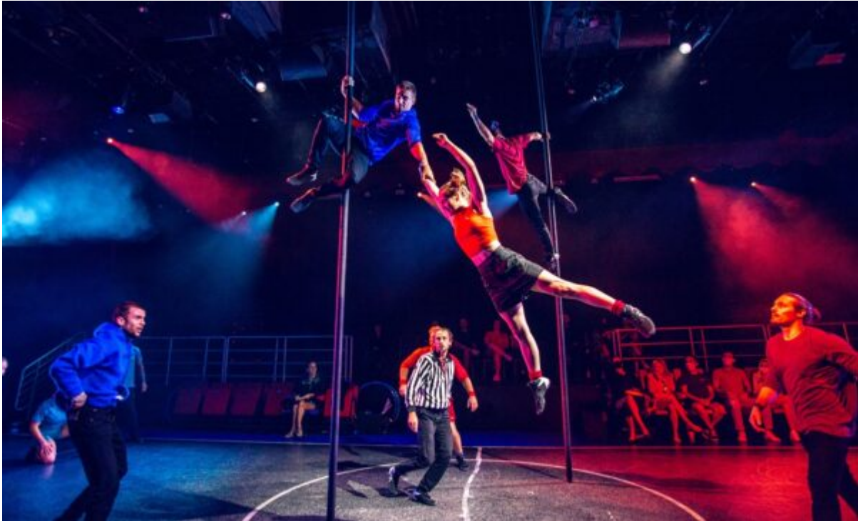
7 Fingers (Les 7 Doigts de la Main).

The Canadian force of nature known in English (and French) as The 7 Fingers (Les 7 doigts de la main) blends dance with acrobatics, along with lots of humor. Visits in recent years solidly established the troupe's appeal and distinctive identity, far more impressive than its usual comparison to the bigger tent Cirque du Soleil. Yes, there is cirque, but so much more, especially more dance. The troupe brings all their powers to Duel Reality opening for a two week run on a Music Center main stage. Ahmanson Theatre, Music Center, 135 N. Grand Ave., downtown; Thurs.-Fri., Sept. 12-13 & 19-20, 8 pm, Sat., Sept. 14 & 21, 2 & 8, pm, Sun., Sept. 15, 1 & 6:30 pm, Sun., Sept. 22, 1 pm, $25-$125, Center Theatre Group .