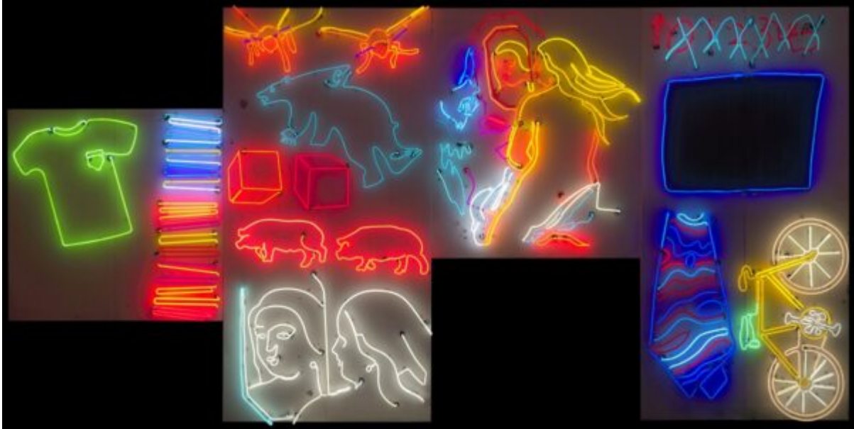
Robert Rauschenberg (1925-2008), Green Shirt , 1965-67, neon and enameled metal; Norton Simon Museum, gift of the artist, © 2024 Robert Rauschenberg Foundation / Licensed by VAGA at Artists Rights Society (ARS), New York.

One of the most spectacular works at the Norton Simon is Robert Rauschenberg's Green Shirt of 1965-67, a 20-foot-wide panel supporting a dozen images created with neon lights. There's the green shirt of the title on the left, as well as a young blond woman riding in a saddle and another looking at herself in a mirror. There's a pair of orange pigs and a flying blue bear, a yellow bicycle and a striped necktie.