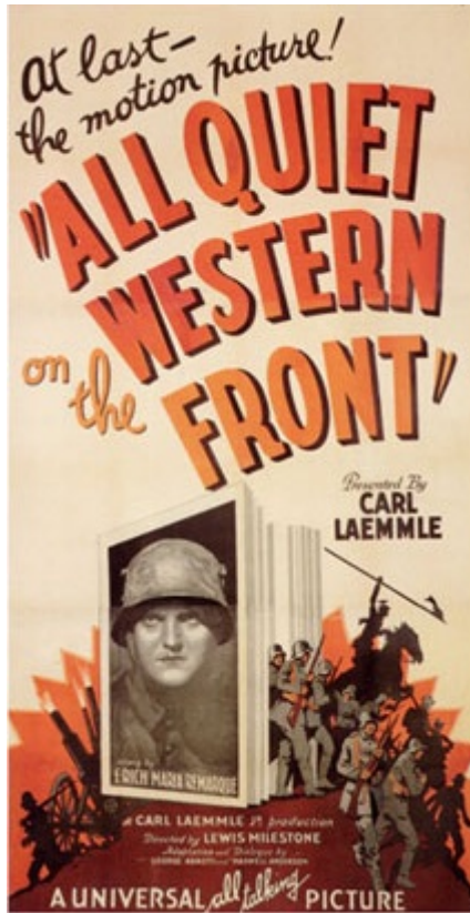
All Quiet on the Western Front (1930)

Am I the only one who's noticed this? I hope not. And for those who'd like to experience the real story, read the novel or see either the 1930 film or even the 1979 version (with John Boy as Paul).