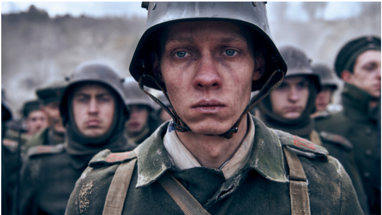
All Quiet on the Western Front

Don't get me wrong. Netflix presents a powerful movie in terms of both its cinematography and acting, as well as coming up with a well-written story. I just wish the studio hadn't appropriated the name (and this is one time I believe "appropriation" is absolutely appropriate as a charge) in order to garner interest in potential viewers.