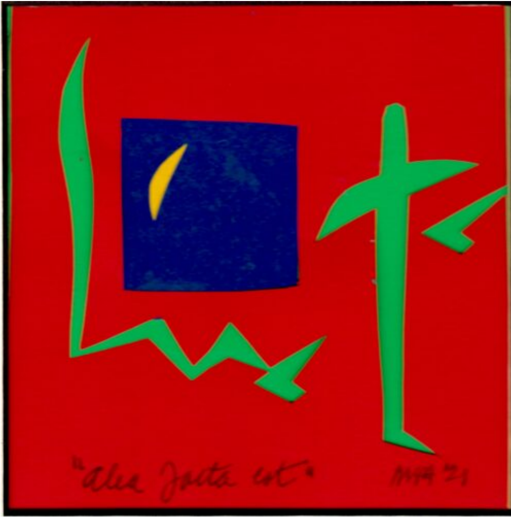
The die is cast

Attempted “trialogue” is the title I chose for the following collage , harking to my search for three randomly shaped pieces to compose the collage with here, one square and two triangular pieces.