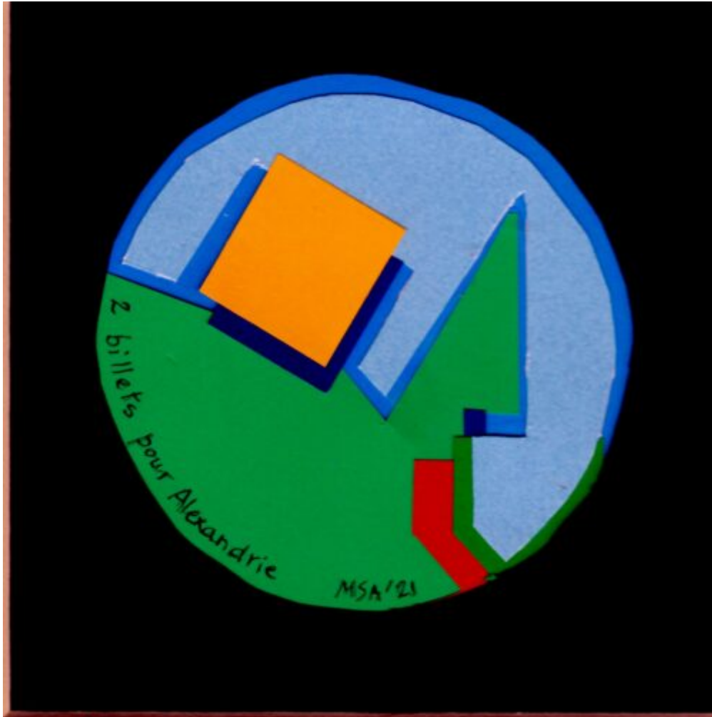
Two tickets for Alexandria