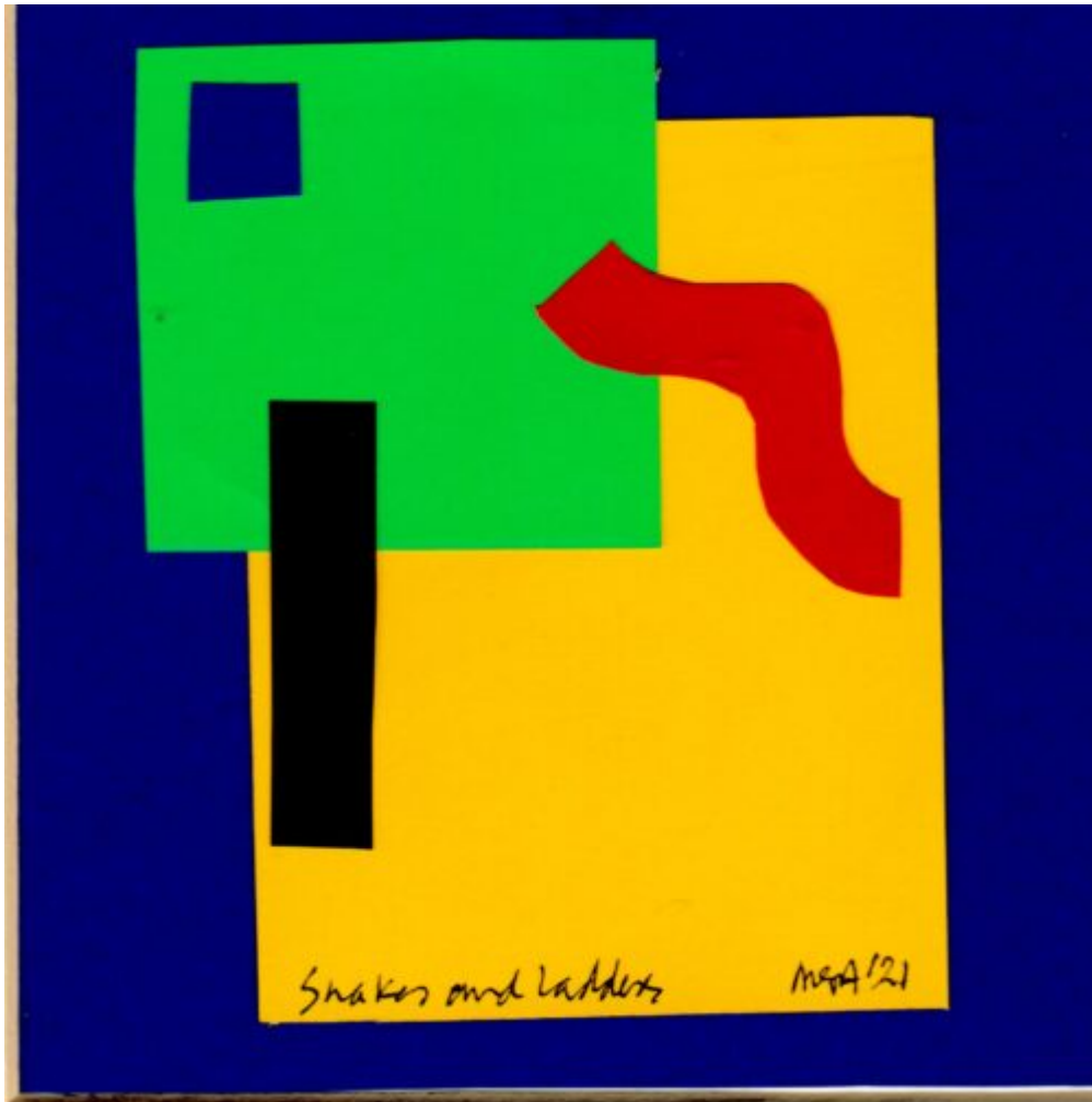
Snakes and ladders

“ Upside down ” is the title I gave to the following collage , the starting point of which was a mauve stair-like pre-cut piece I placed upside down in order to avoid any literal association.