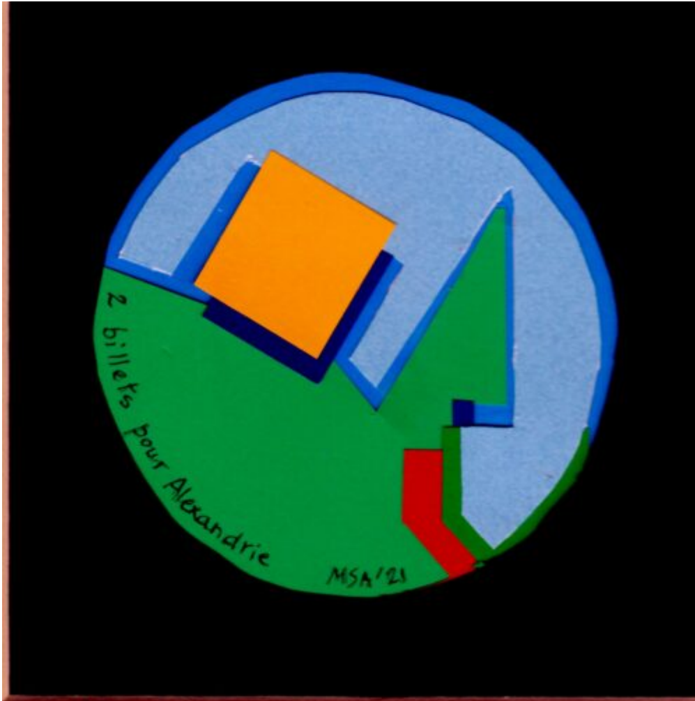
Two tickets for Alexandria