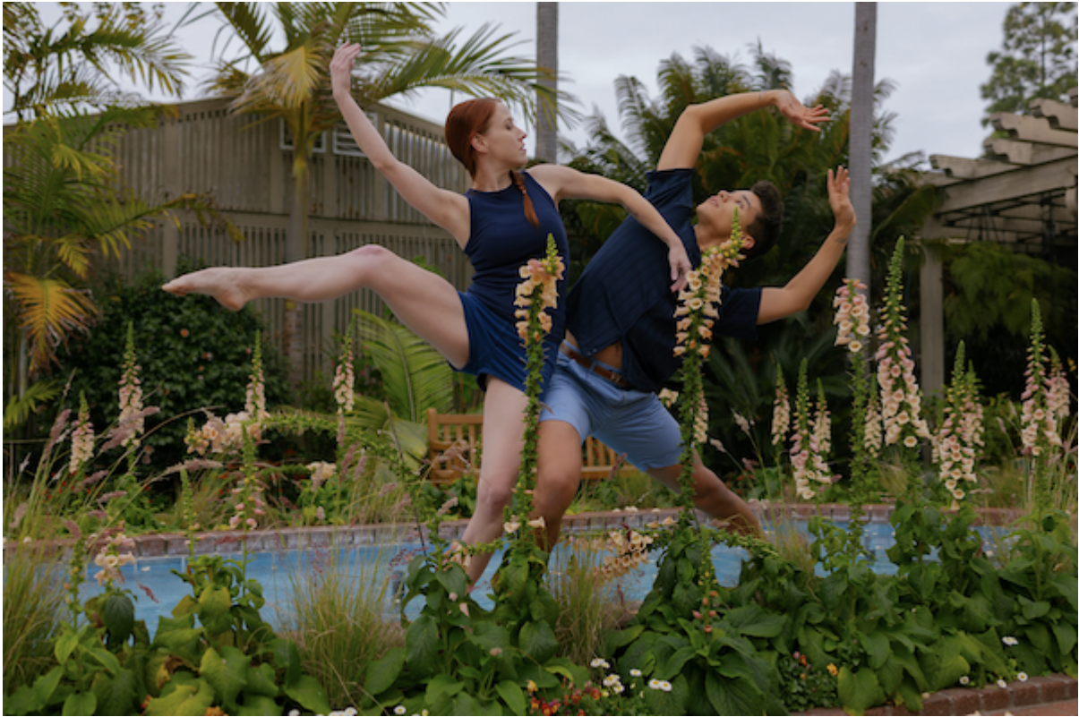
Backhausa dance.