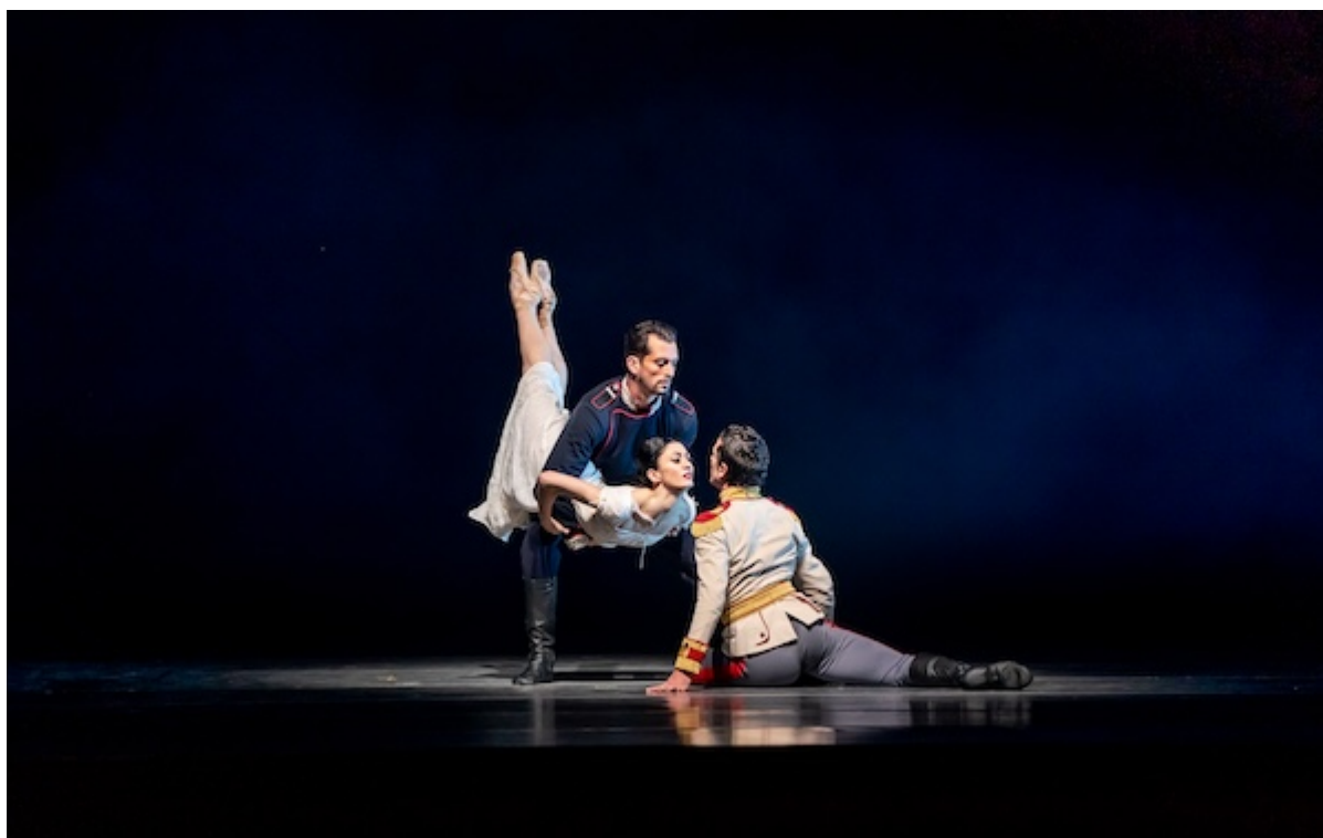
The Joffrey Ballet.

The Joffrey Ballet — Anna Karenina at the Dorothy Chandler Pavilion, Music Center, 135 N. Grand Ave., downtown; Fri.-Sat., June 21-22, 7:30 pm, Sat.-Sun., June 22-23, 2 pm, $34-$138. Music Center .