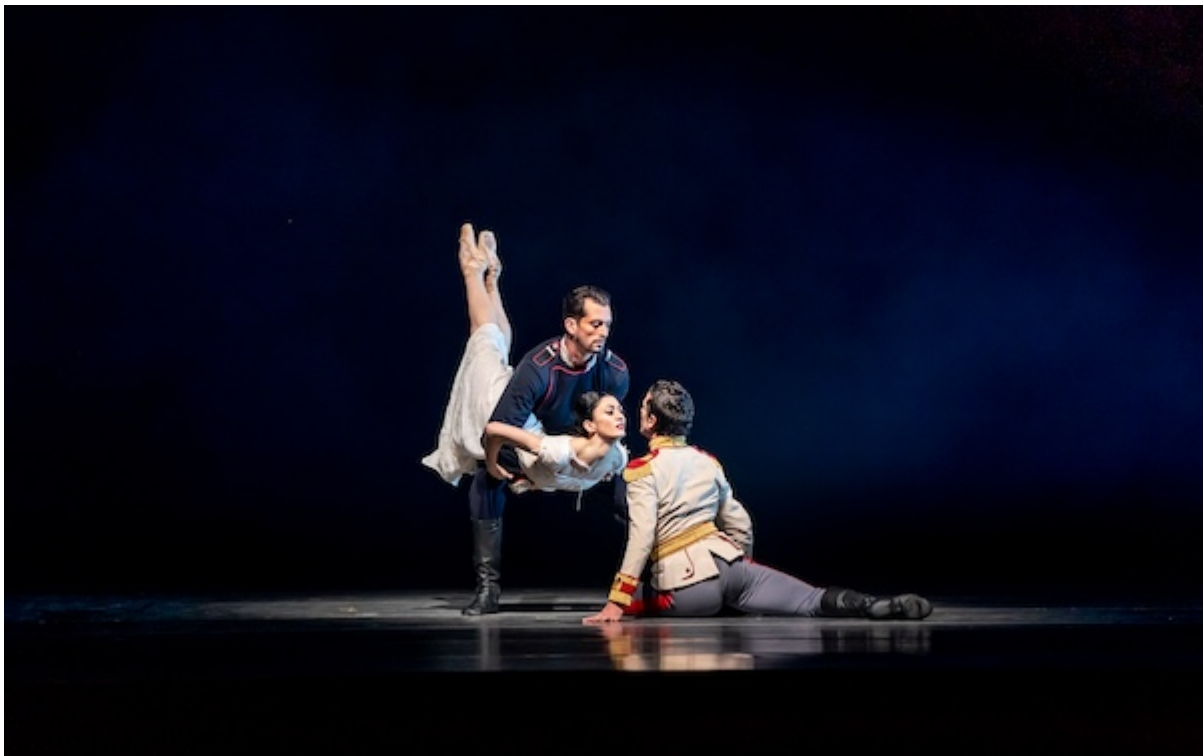
The Joffrey Ballet.

The Joffrey Ballet — Anna Karenina at the Dorothy Chandler Pavilion, Music Center, 135 N. Grand Ave., downtown; Fri.-Sat., June 21-22, 7:30 pm, Sat.-Sun., June 22-23, 2 pm, $34-$138. Music Center .