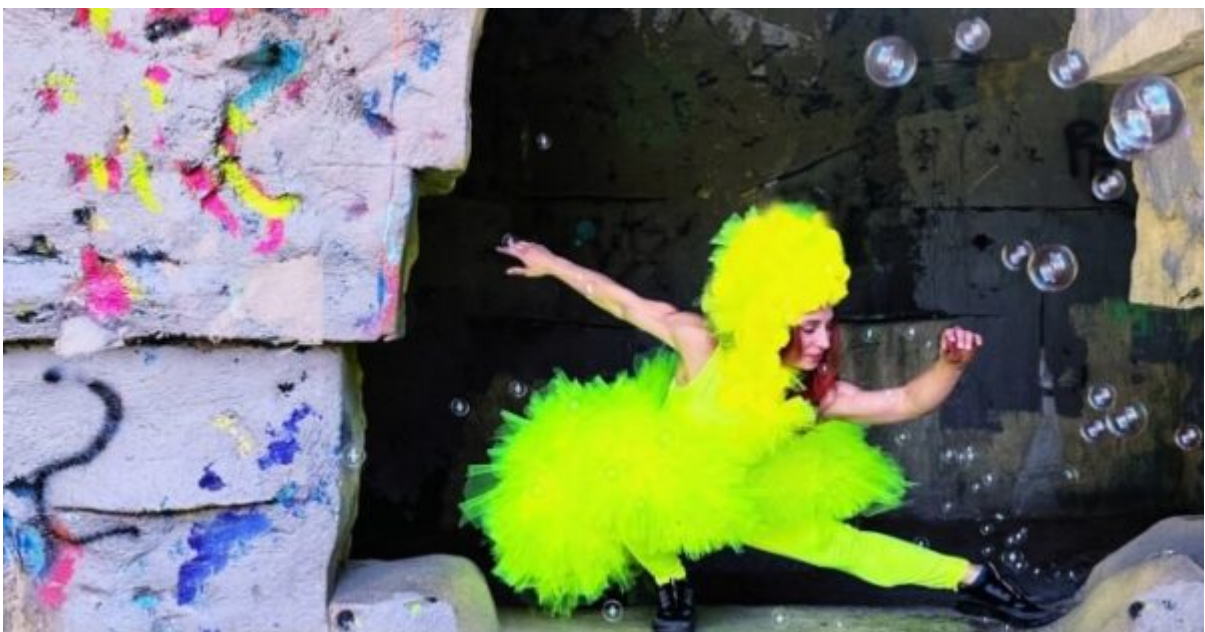
Heidi Duckler Dance.

Site-specific Heidi Duckler Dance teams up with visual artist Kim West for Unfurling , set at Griffith Park's Old LA Zoo. Opened in 1912, the old zoo closed in 1966 when the present zoo opened. Garbed in highlighter yellow headgear and more, HDD performers will guide the audience through the old zoo's remains and the artist's color-filled installation of fabric flows, floral illustrations, and a pieced ceramic mural. Picnics will be available for purchase starting at 5 pm or bring your own. Outdoor garb and footwear for walking are recommended. Old LA Zoo, Griffith Park, 4801 Griffith Park Dr., Los Feliz; Sat., June 8, 7 pm, $15. Heidi Duckler Dance .