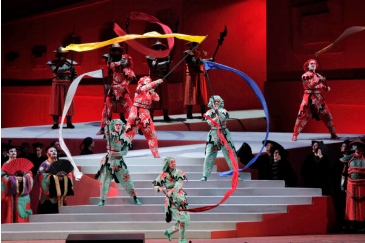
LA Opera's "Turandot."