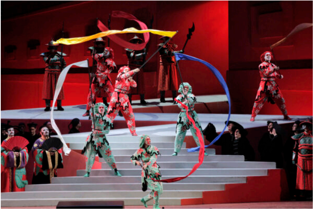
LA Opera's "Turandot."