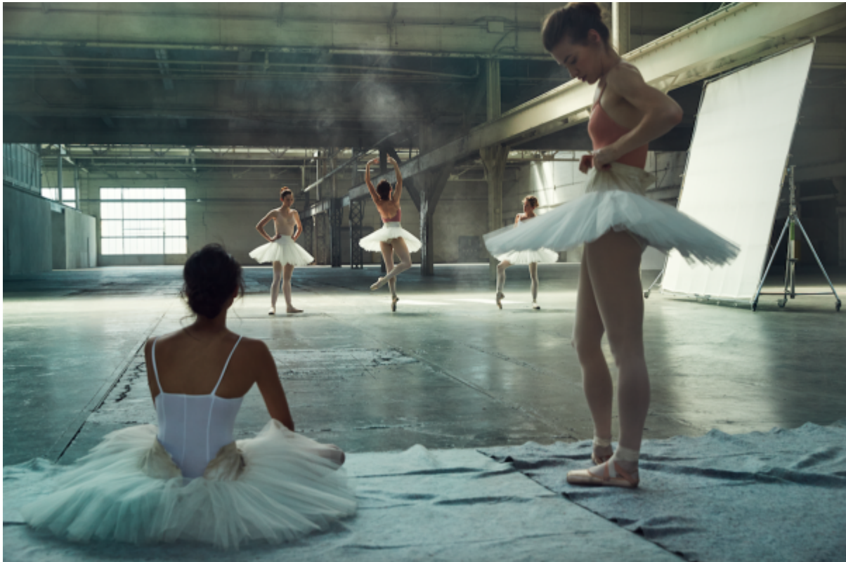
American Contemporary Ballet