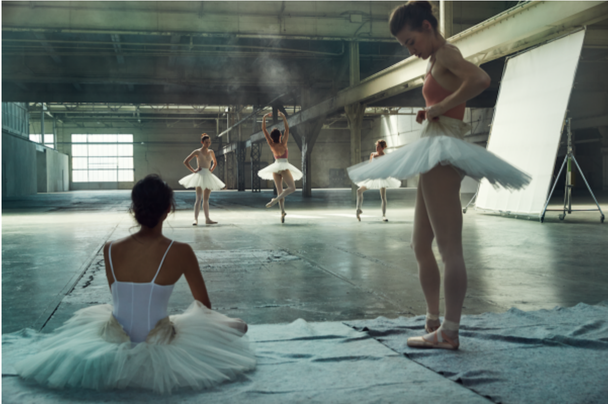
American Contemporary Ballet