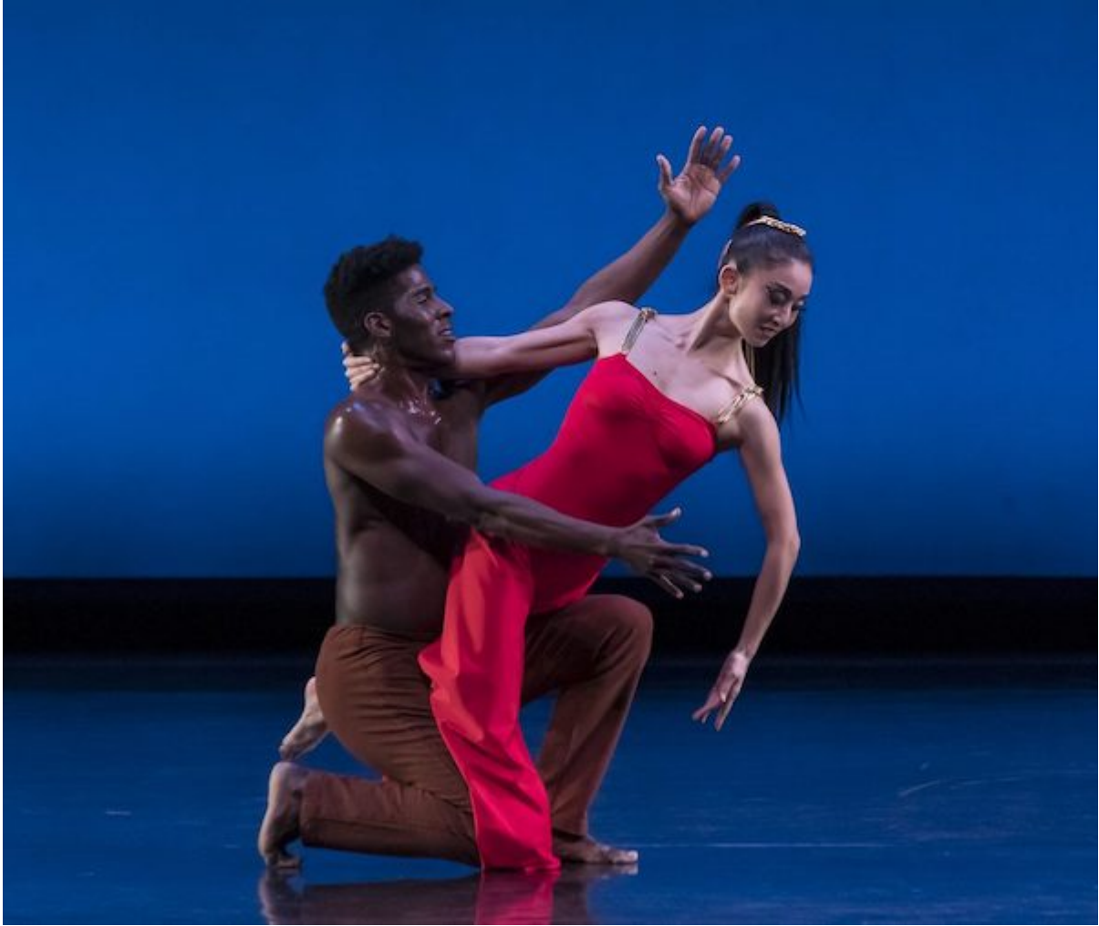
The Martha Graham Dance Company.