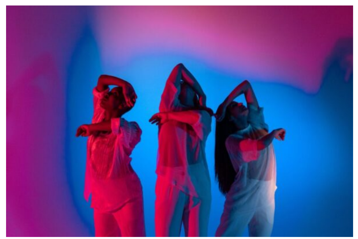
MashUp Contemporary Dance Company.

MashUp's International Women's Day Dance Festival — Full event info at MashUp. Kick Off Party at the Pickle Factory, 2828 Gilroy St., Frogtown; Fri. March 7, 7 pm, $40. Tickets. Choreographers Showcase at Stomping Ground LA, 5453 Alhambra Ave., El Sereno; Sat., March 8, 3:30 & 7:30 pm, $30. Tickets.