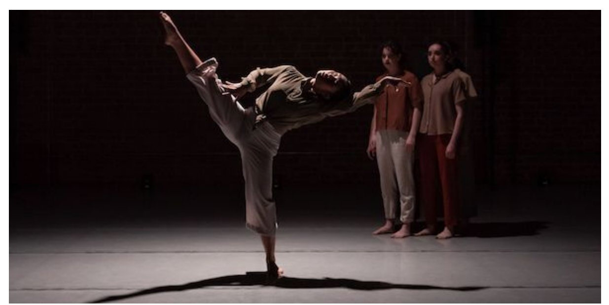
MashUp Contemporary Dance Company.