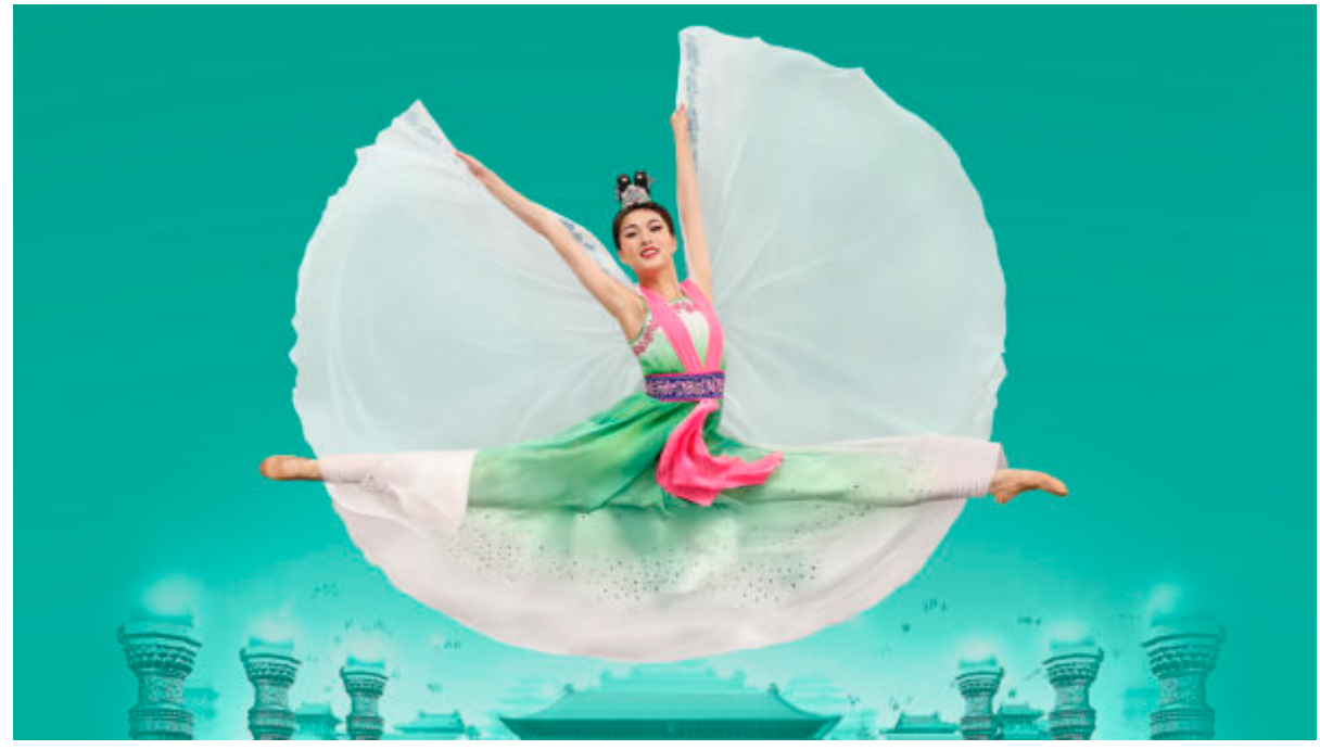
Shen Yun.