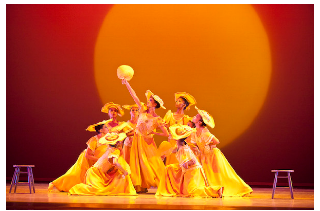
Alvin Ailey American Dance Theater in "Revelations."

Nrityagram and Chitrasena Dance Companies at the Baker-Baum Concert Hall, The Conrad Prebys Performing Arts Center, 7600 Fay Avenue, La Jolla; Wed.-Thurs., March 20-21, 7:30 pm, $46-$81. The Conrad.