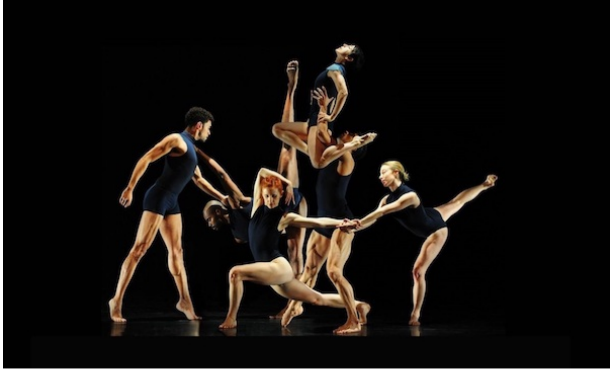
Kybele Dance Theater.