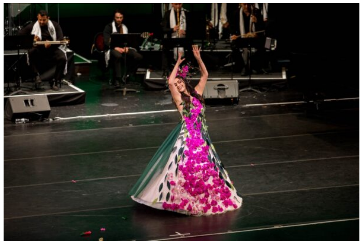
Niosha International Conservatory of the Arts.

The celebration Nowruz marks the Persian new year and, at the same time, the arrival of spring. Niosha International Conservatory of the Arts explains those dualities in The Story of Nowruz in dance and music. Irvine Barclay Theater, UC Irvine, 4242 Campus Dr., Irvine, Sun., March 10, pm, $65-$250. The Irvine Barclay.