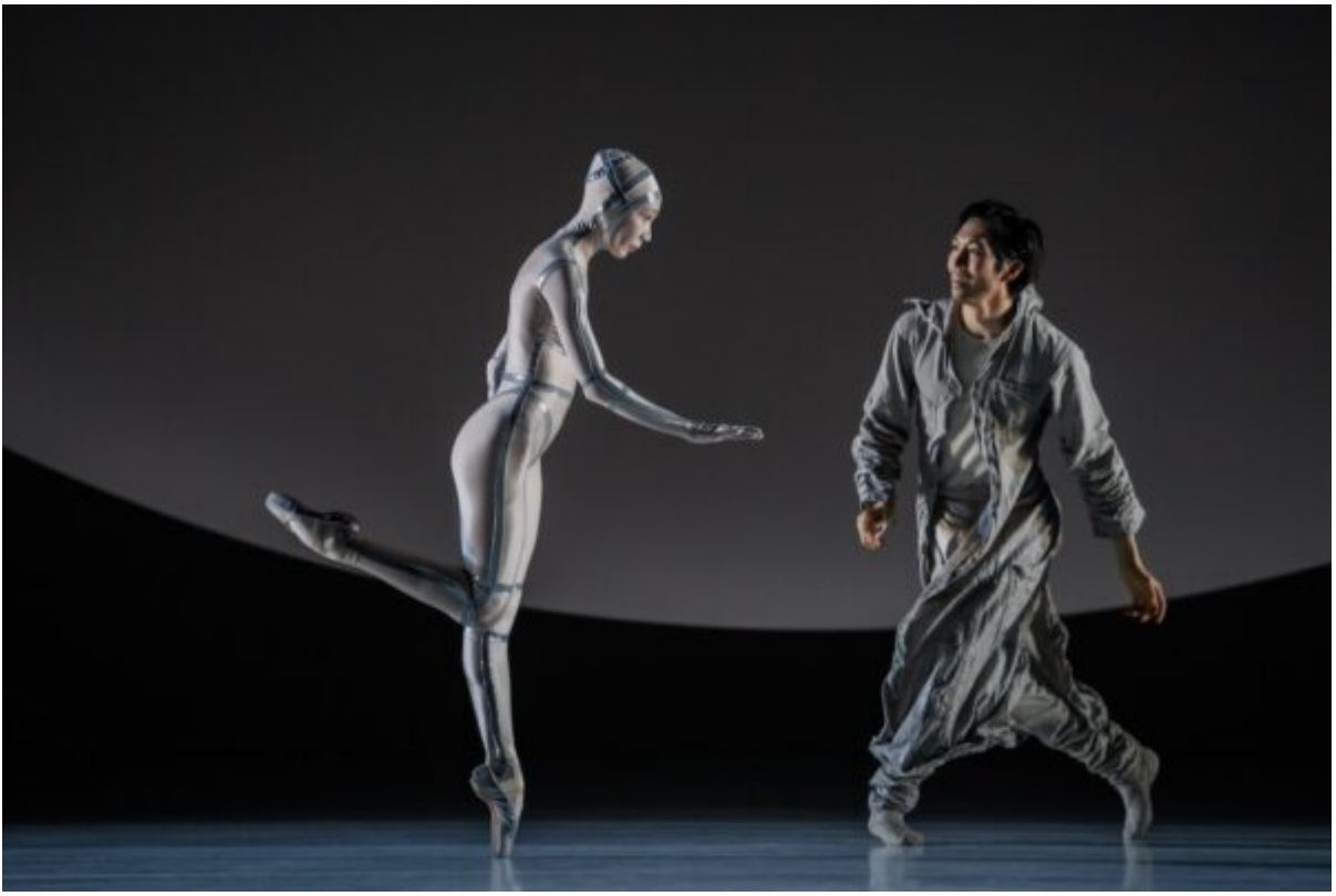
Les Ballets de Monte-Carlo.

the Delibes score has been replaced with music suited for now. Segerstrom Center for the Arts, 600 Town Center Dr., Costa Mesa; Thurs.-Fri., March 7-8, 7:30 pm, Sat., March 9, 2 & 7:30 pm, Sun., March 10, 1 pm, $39-$149. SCFTA.