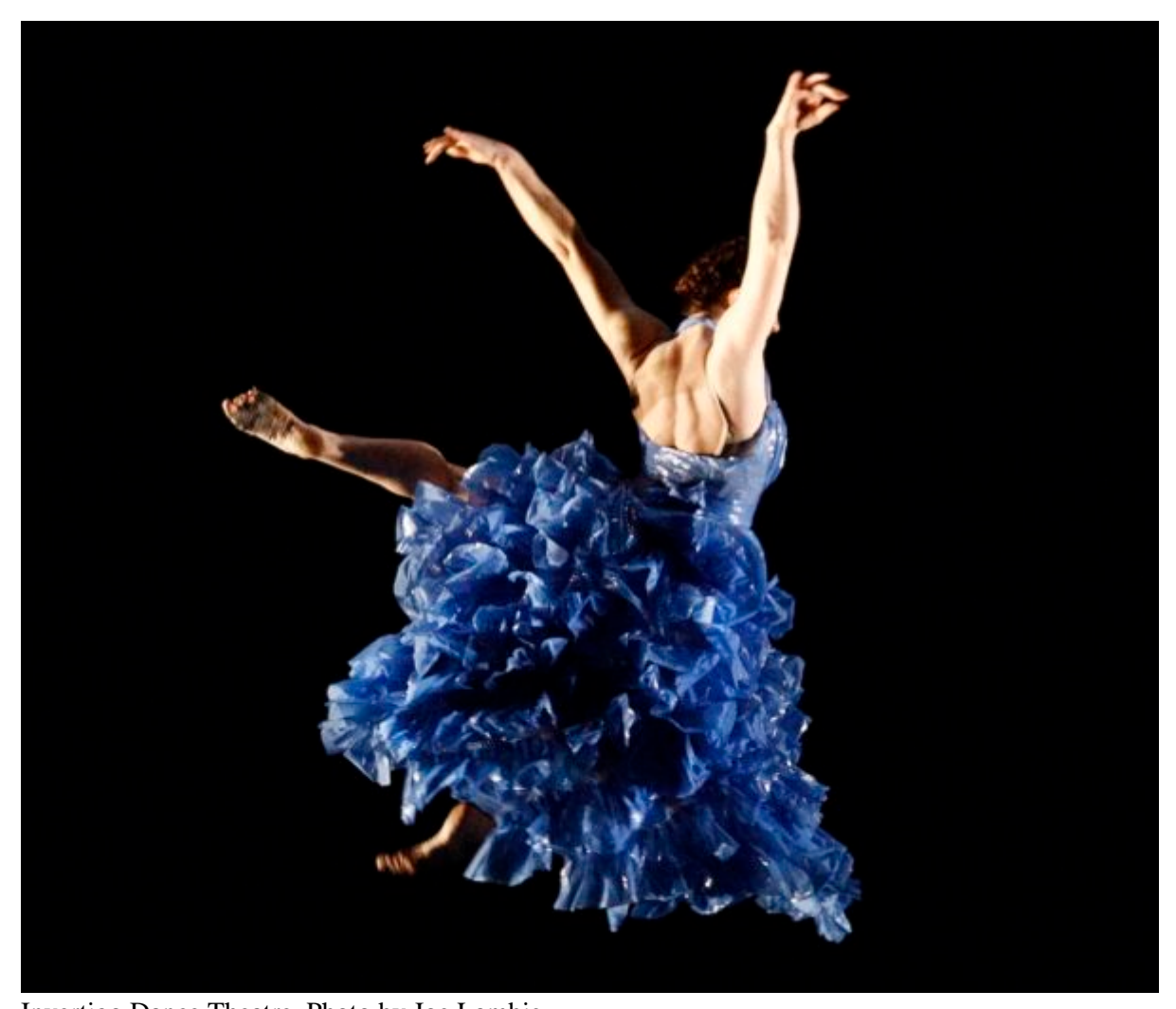
Invertigo Dance Theatre.

Originally staged in 2016 to sold out audiences, Invertigo Dance Theatre 's After It Happened receives a timely encore presentation. Set in the aftermath of a natural disaster, the work considers how a community rebuilds and scavenges for signs of hope and resilience. When originally presented, the work suggested a natural disaster, maybe an earthquake or flood. A pandemic that has snatched a half million Americans and millions more around the world was not in the thinking. With the current tragedy front and center, not over, but maybe headed toward containment, After It Happened offers a thoughtful consideration through dance that suggests ways to create and build a new normal. The performance gains an additional component of a physical reality from the hillside stage of the open-air Ford Theater where it was filmed. Available as part of its online showcase of prior SoCal dance performances at this beloved venue. Thurs., March 11, 6:30 p.m. PST. Free with reservation at The Ford or Invertigo Dance Theatre.