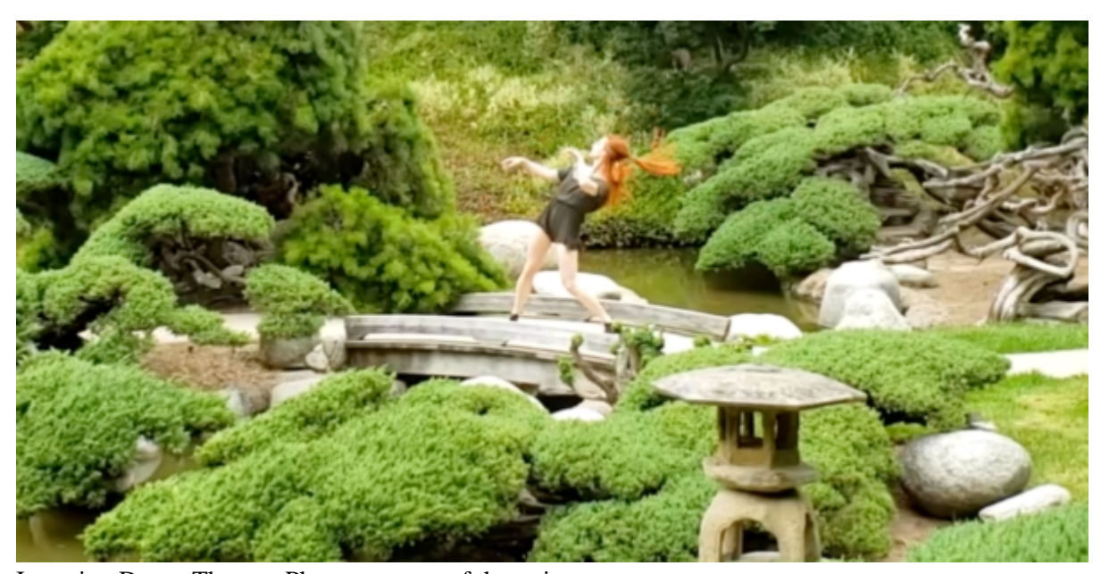
Invertigo Dance Theatre.

What started as a one-time response to Mother's Day last spring was so successful, Invertigo Dance Theatre extended its Digital Dance Care Packages after inquiries for something similar for graduations, birthdays or just an expression of caring in the isolated quarantine of the pandemic. Created by Invertigo dancers with the choreography inspired by three or four prompts, the trove of 90 short films have been assembled into a four-part, micro film festival series dubbed Care Package Cinema which concludes this week. A highlight in this finale, Holiday Special is a delightful couch-centered Father's Day tribute. Details at Invertigo Dance. Mar., 10, 7 p.m., free with reservation. Eventbrite.