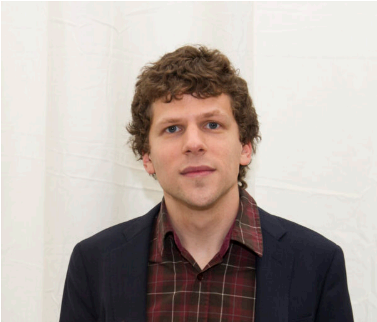
Jesse Eisenberg