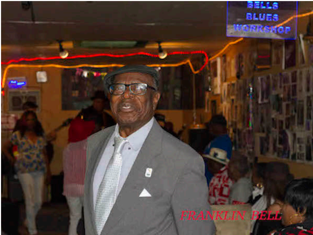
Legendary owner and proprietor of Bell's Blues Workshop on location on April 2, 2017.