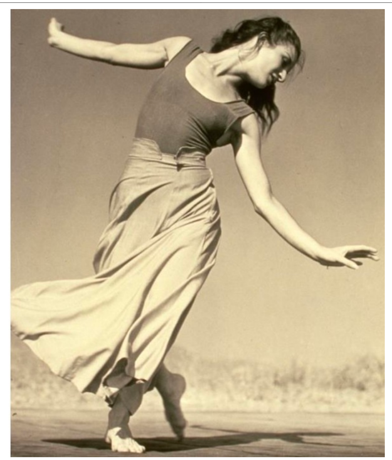
Bella Lewitzky.

Hip Hop Dance From France — Sous le poids des plumes " ( Beneath the weight of feathers ) at Theatre Raymond Kabbaz, 10361 W. Pico Blvd., West LA; Wed., May 1, 8 pm, $35. Theatre Raymond Kabbaz.