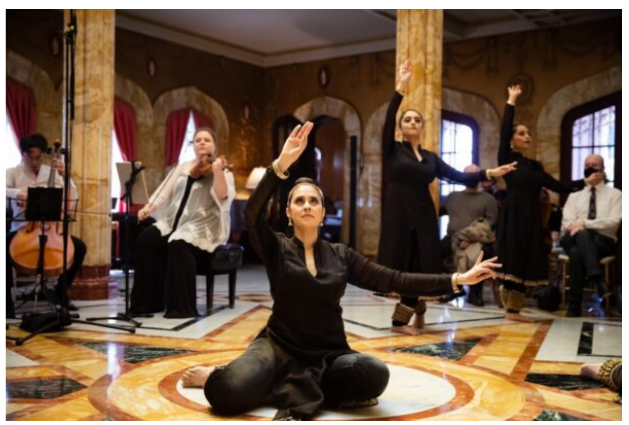
Leela Dance Collective.

Sat., May 4, 3 & 4 pm, free. Sun., May 5, noon, 2 & 5 pm, Culver Steps, 9300 Culver Blvd., Culver City; Also ticketed performance at Agoura Hills Performing Arts & Education Ctr., 28545 W. Driver Ave., Agoura Hills; Sat., May 11, 4:30 & 7:30 pm, $25 The PAECs; livestream $10 Imagine India.