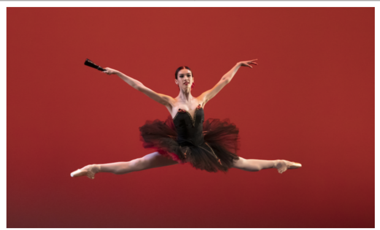
ABT Studio Company.