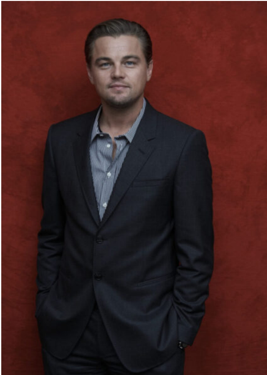
Leonardo DiCaprio

“I used to think of the environmental movement as a small group of people trying to change the world, but this is really a gigantic worldwide movement; there are so many people that have devoted their lives to this issue doing so many different things around the world. We don’t even need to look towards the future, we can reduce the human imprint on Planet Earth by 90% with the technologies that we have readily available, that already exist. It’s just about making sure these are implemented into our daily lives, and we have to urge our corporations and our governments to do that. So when we start thinking in that realm, it’s pretty hopeful and inspiring, because the realities of what will go on with business as usual is pretty scary and depressing. That’s why we made that movie, to make sure more people became more aware of these issues.”