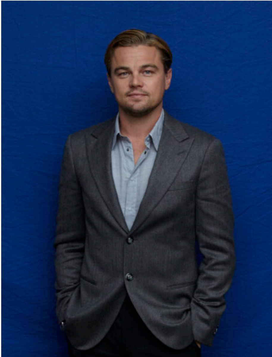
Leonardo DiCaprio

“I believe that the governments of the world are there to serve the people, so, first off, they have to adhere to the Kyoto Protocol and the Paris Agreement, with everyone curbing some of these emissions. China and the United States are the leading super powers that are contributing the most to this problem, we’re huge industrialized nations that produce a lot of waste. So we need to be the ones to set an example, and this generation needs to know that their actions today are going to shape what happens in the future.”