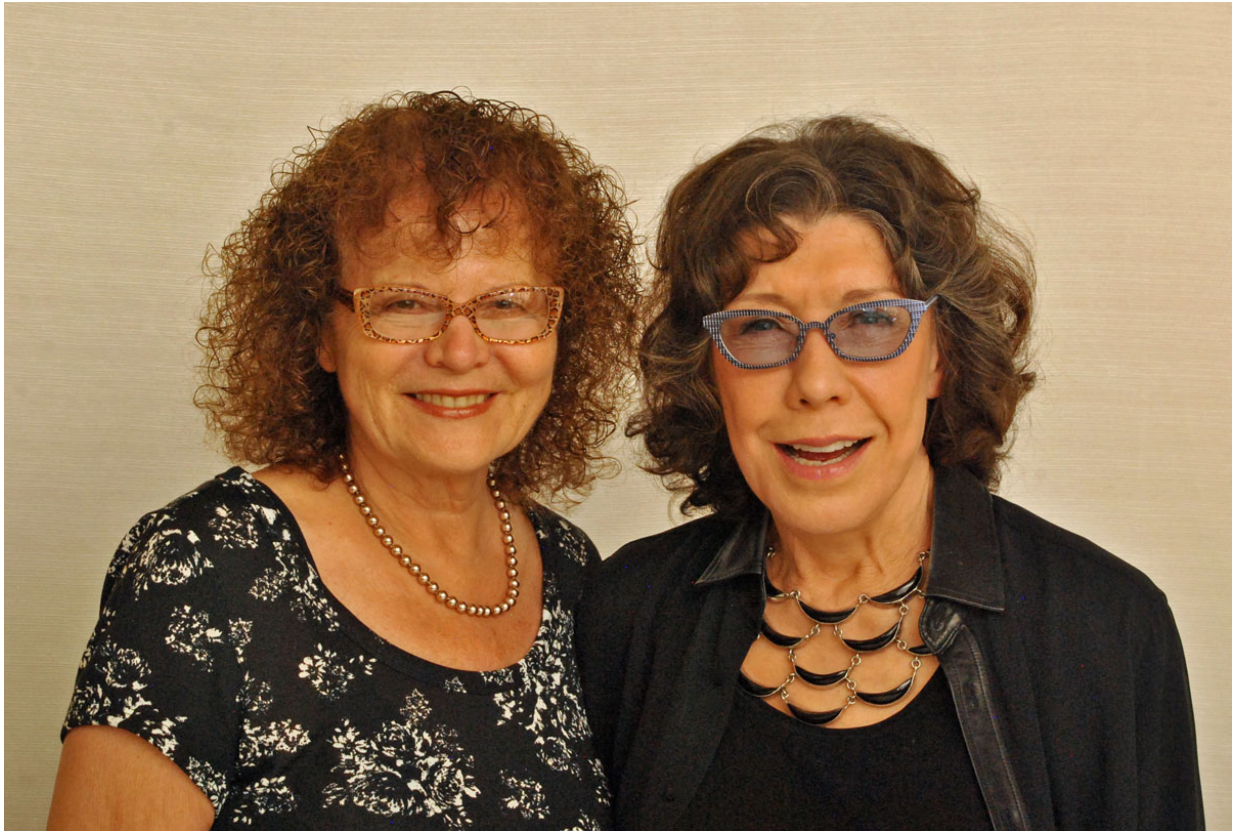
Elisa Leonelli, Lily Tomlin (c) HFPA 2015

Read the profile I wrote in 2015, when Lily Tomlin received two of a total of seven Golden Globe nominations from the journalists of the Hollywood Foreign Press.