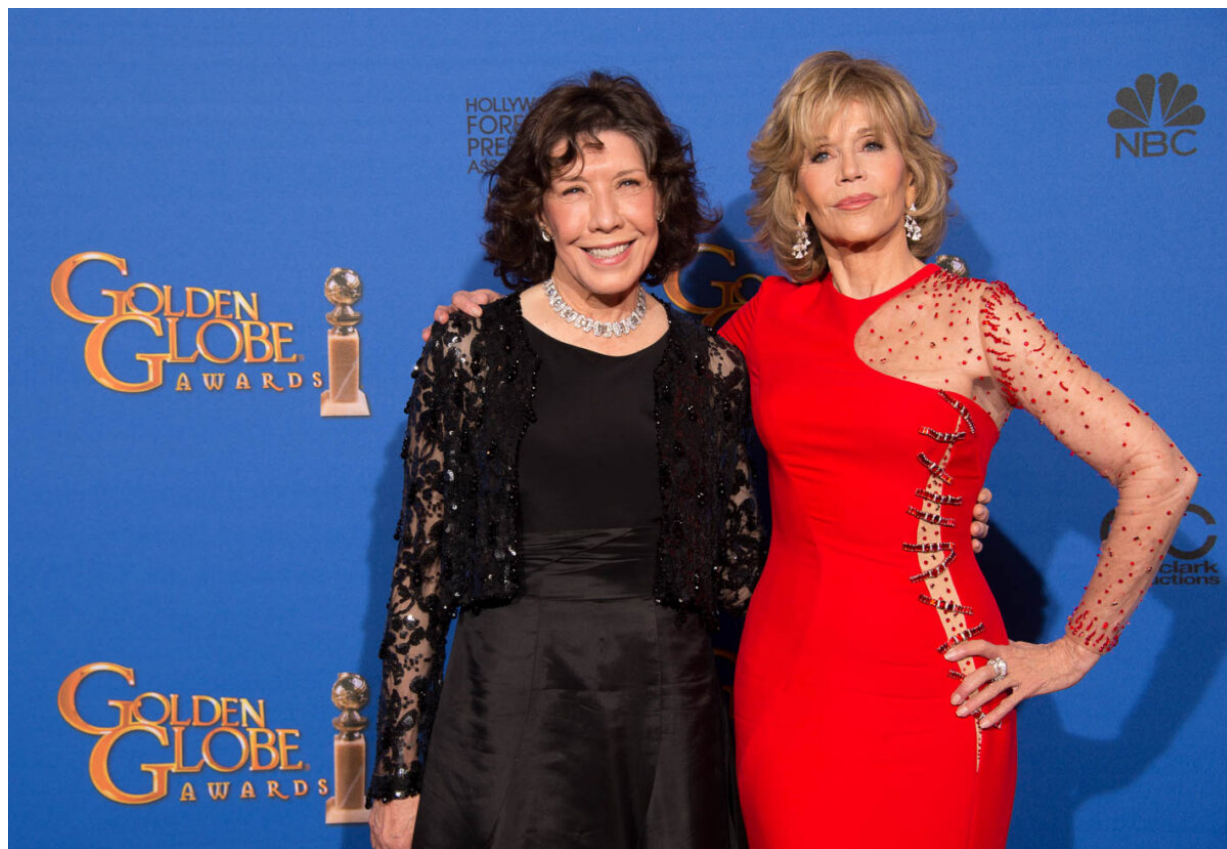
Lily Tomlin, Jane Fonda

As an entertainment journalist, I interviewed her several times, about movies like 9 to 5 (1980) with Jane Fonda and Dolly Parton, All of Me (1984) by Carl Reiner with Steve Martin (screening at TCM), A Prairie Home Companion (2006) by Robert Altman, Admission (2013) and Grandma (2015) by Paul Weitz.