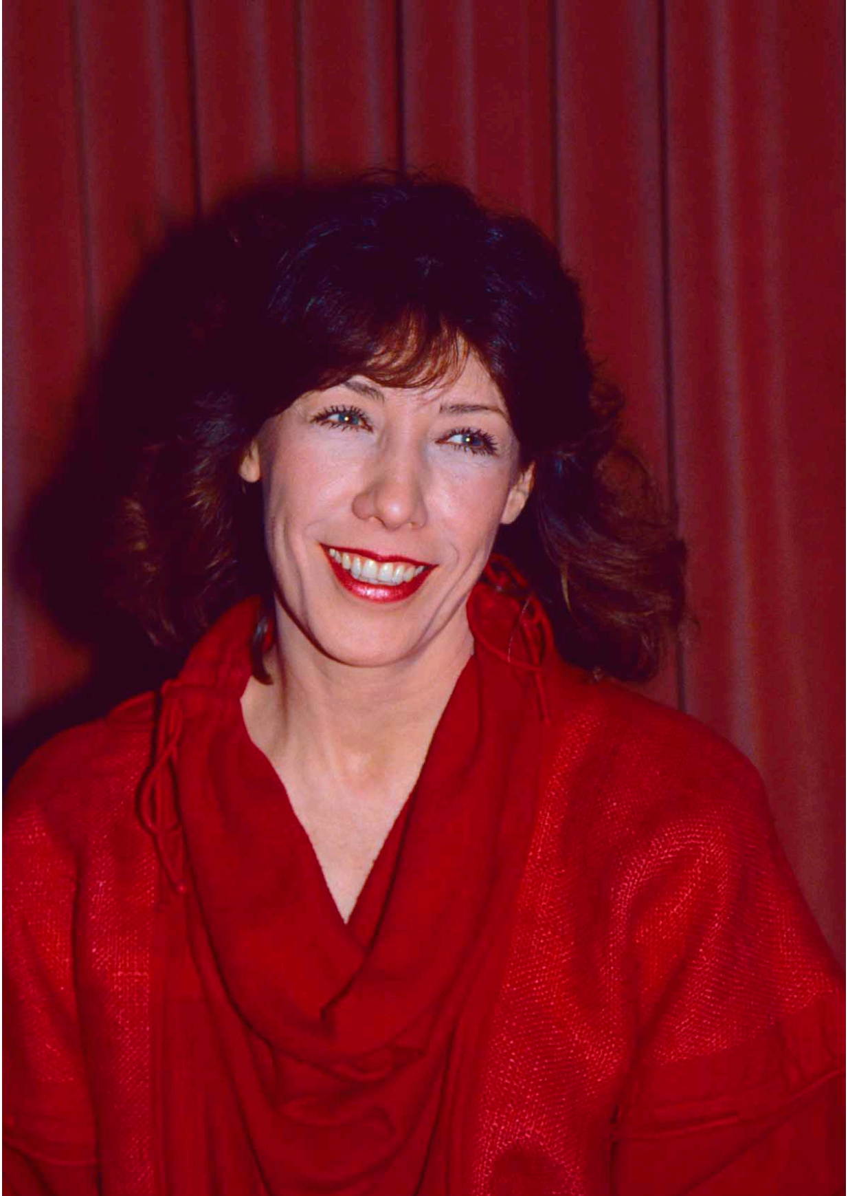
Lily Tomlin

I first met Lily at the 1976 Emmys, when I accompanied my ex-husband, nominated as one of the writers on The Lily Tomlin Special .