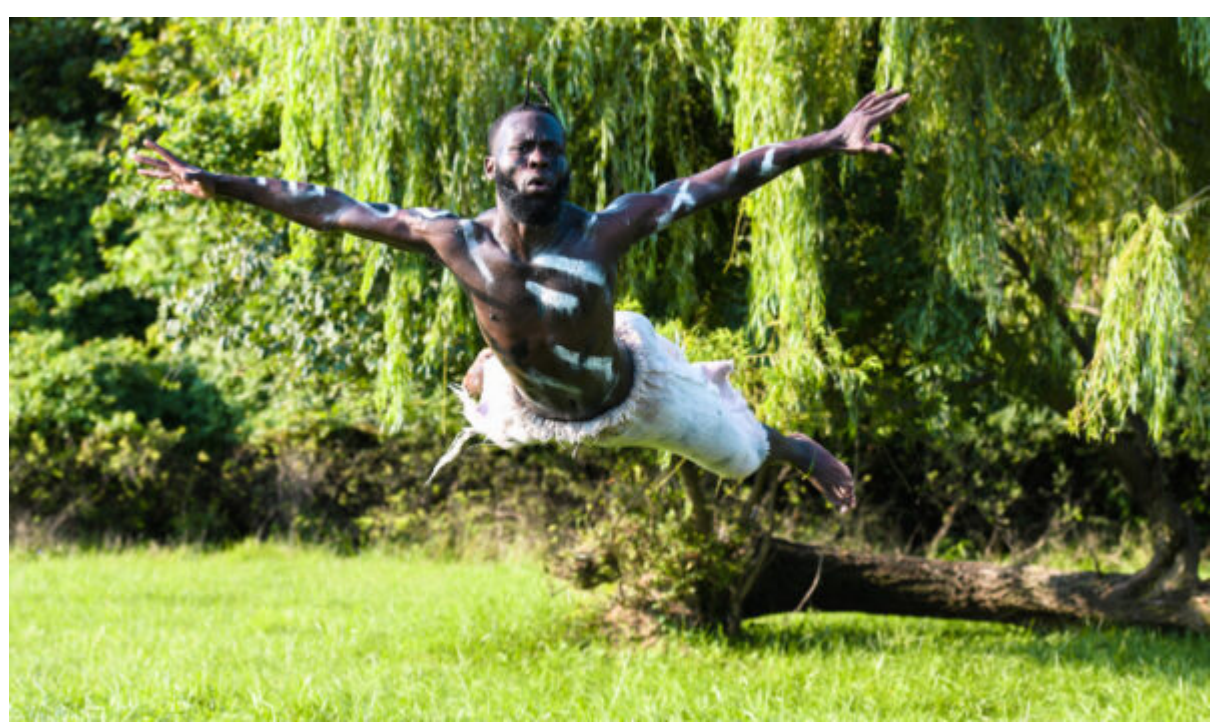
Step Afrika!

Step Afrika! At Luckman Fine Arts Complex, Cal State University Los Angeles, 5151 State University Dr., East LA; Sat., Feb. 18, 8 pm, $25-$50. Ticketmaster.