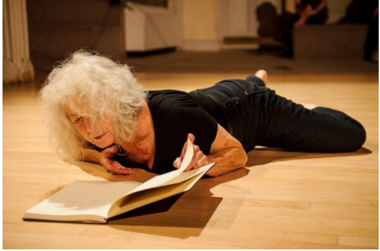
Simone Forti.

The Obie award-winning duo Abigail Browde and Michael Silverstone aka 600 Highwaymen bring the final weekend of immersive performance under the distinctively unwieldy title A Thousand Ways (Part Three): An Assembly. Described as experimental theater creations, each roughly one hour event draws on elements of dance, performance, and civic engagement as each audience of 16 people read from assigned cards before being drawn in further, becoming part of each singular performance. UCLA Royce Hall Rehearsal Room, Royce Hall, Sat.-Sun., Feb. 11-12, noon, 1:30, 3pm, 4:30, 6 & 7:30pm. $29.97. CAP UCLA.