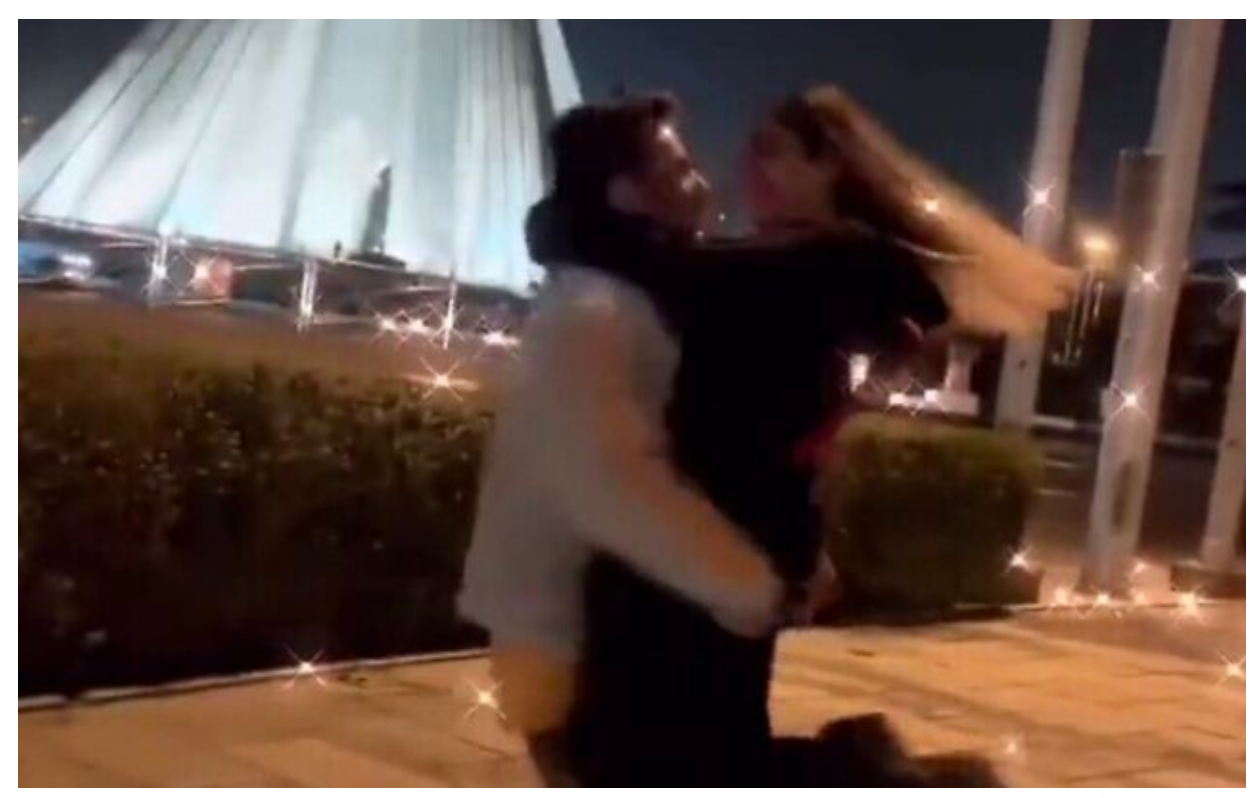
The engaged Iranian couple sentenced to prison for 10 years for dancing without a headscarf