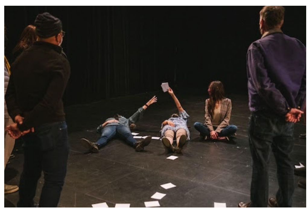
600 Highwaymen.