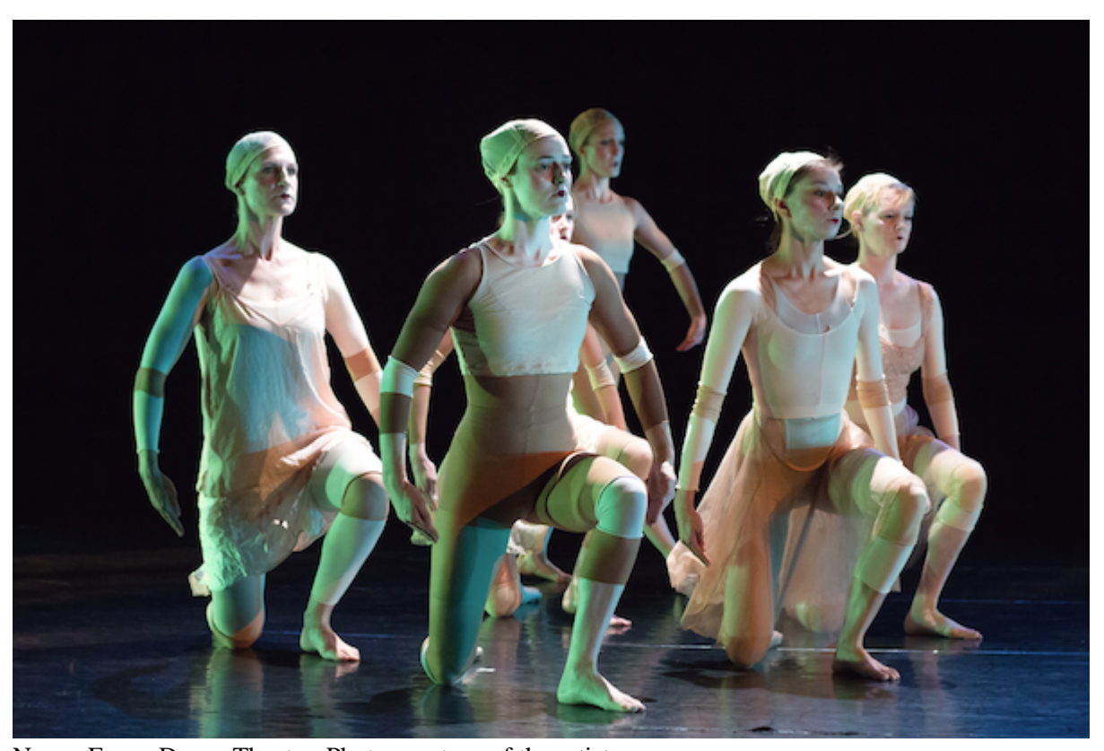
Nancy Evans Dance Theatre.

In conjunction with the exhibition Ink, Paper, Stone: Six Women Artists and the Language of Lithography, Nancy Evans Dance Theatre performs Imprint. The work employs projection, props, fabric and costumes to bring two-dimensional lithography to life in three dimensions. Norton Simon Museum, Sat., Feb. 11, 5 pm, free w/registration and museum admission, tickets available at 4 pm. Norton Simon Museum.