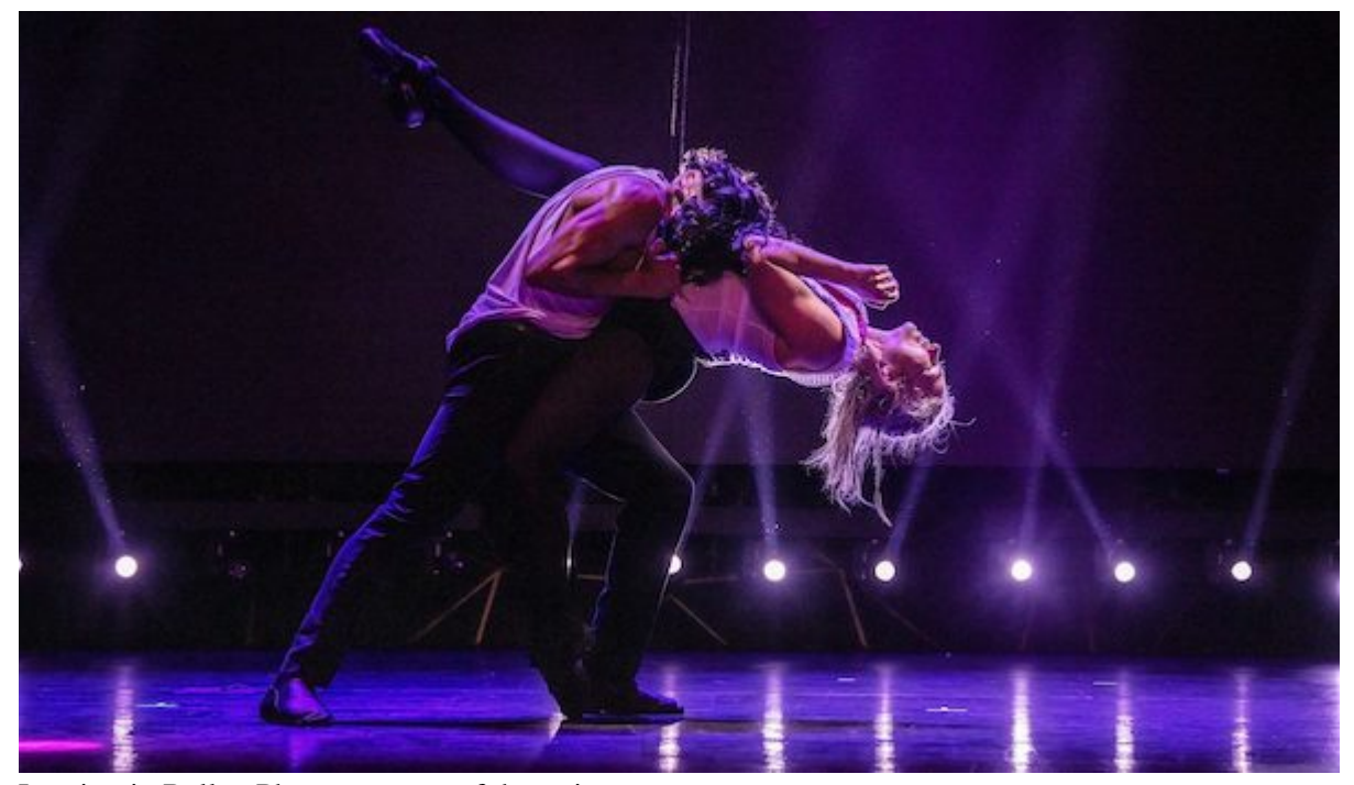
Luminario Ballet.

Luminario Ballet at the Wallis, 9390 N. Santa Monica Blvd., Beverly Hills; Fri.-Sat., Feb. 17-18, 7:30 pm, Fri., $10 or pay what you can; Sat. $25-$79. The Wallis.