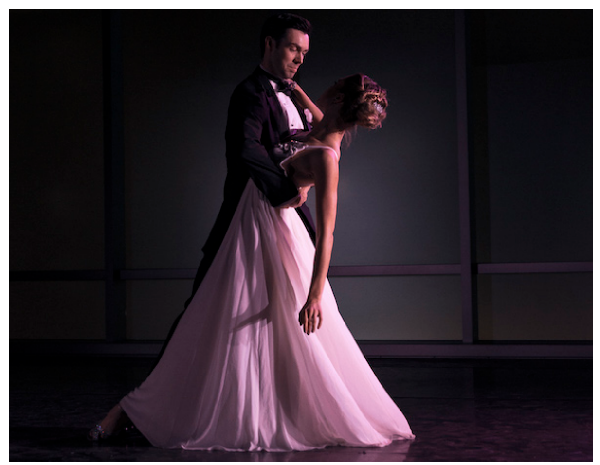
American Contemporary Ballet.