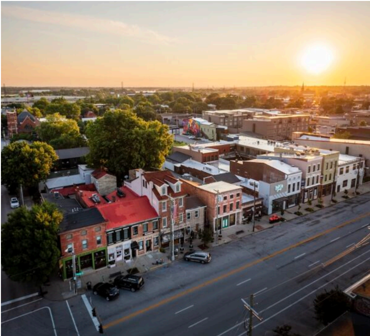
A NuLu streetscape

Louisville, Kentucky, was not on my map of places to visit, but forces conspired to get me there, including several friends who once lived there. “Be sure to check out NuLu,” was the refrain.