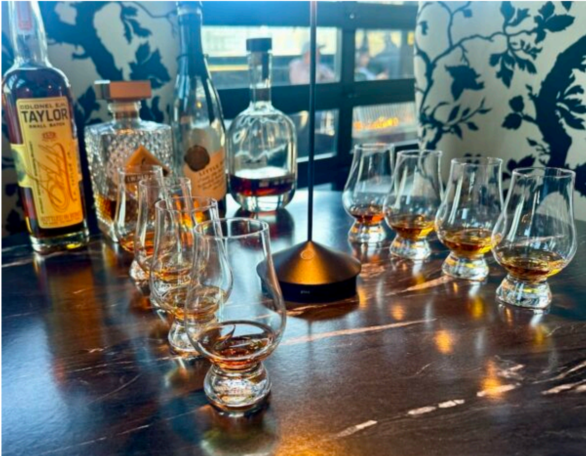
A tasting of four bourbons at Hotel Bourré Bonne