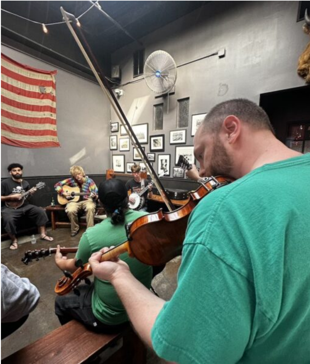
A circle of musicians is a staple at Feast BBQ

I had read about Feast BBQ , set on the further end of the strip at 909 E. Market Street. It's been a top contender in the LEO Weekly Readers' Choice awards since it opened in 2015. The look of the 1920s building, a former mechanic shop, is honest and unpretentious; they kept the industrial bones of the place. Still, there's something homey and right about it all because here, the main point is the food.