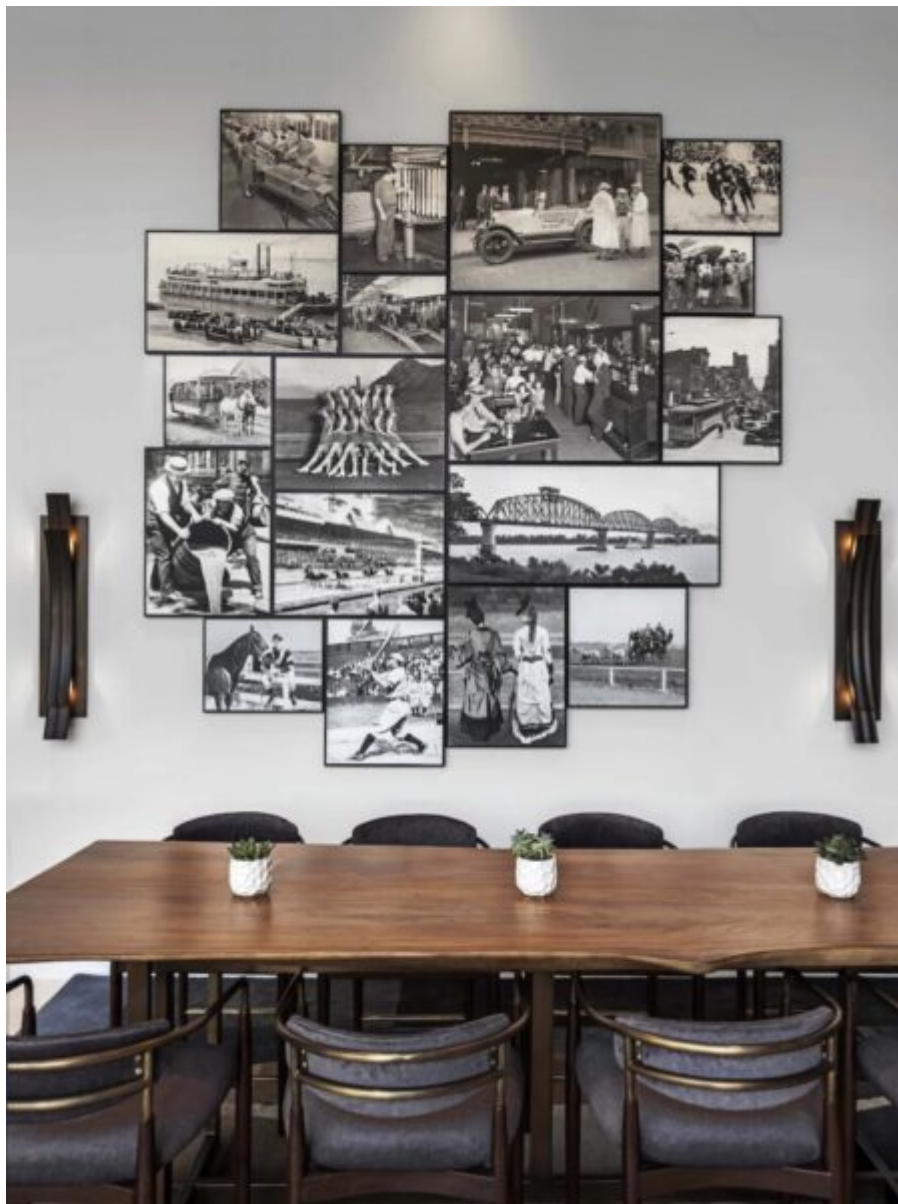
A collection of historic photos just off the lobby

I found artwork referencing Kentucky history throughout the hotel, but appreciated that it wasn't overwhelming. For example, there's a collage of historic photographs just off the lobby that, every time I glanced at it, gave me context for my stay.