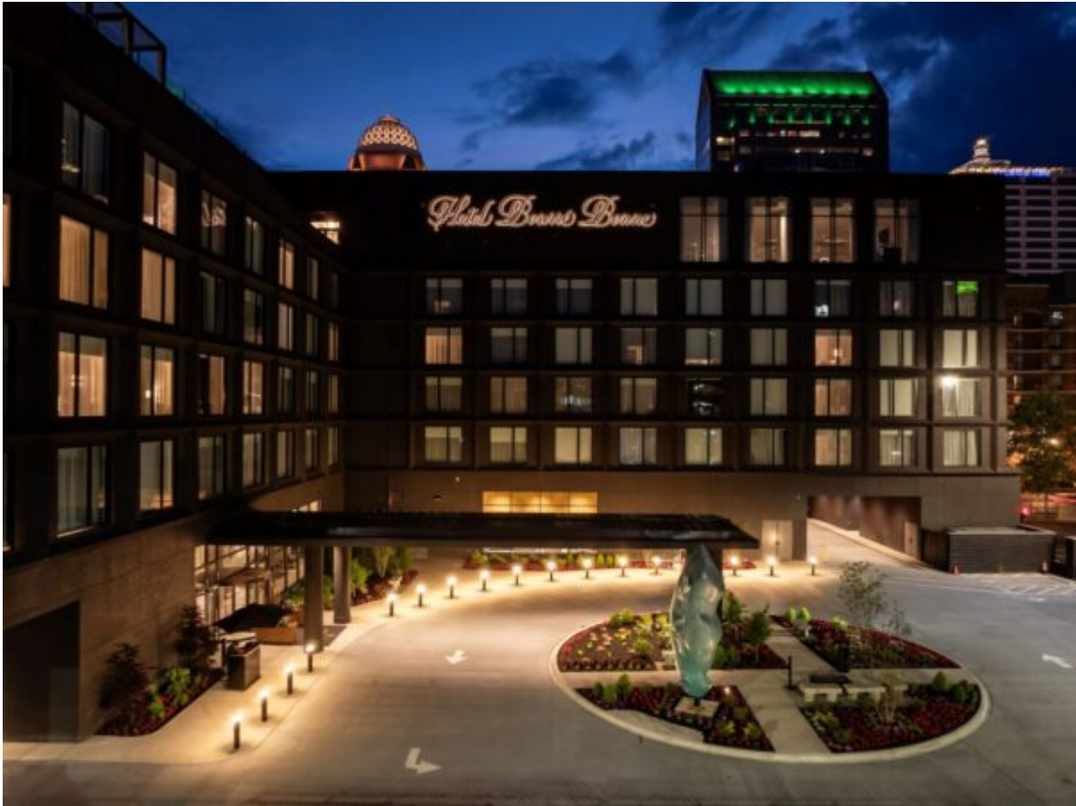
Hotel Bourré Bonne

The hotel's black sculptural facade mimics stone (management says it's reminiscent of igneous rock). The material gives the building an elegant, monumental look. The six-floor structure is set with wide arches at the top and bottom that recall Louisville's historic cast-iron architecture. A large oxidized horse head sculpture greets you outside the entry.