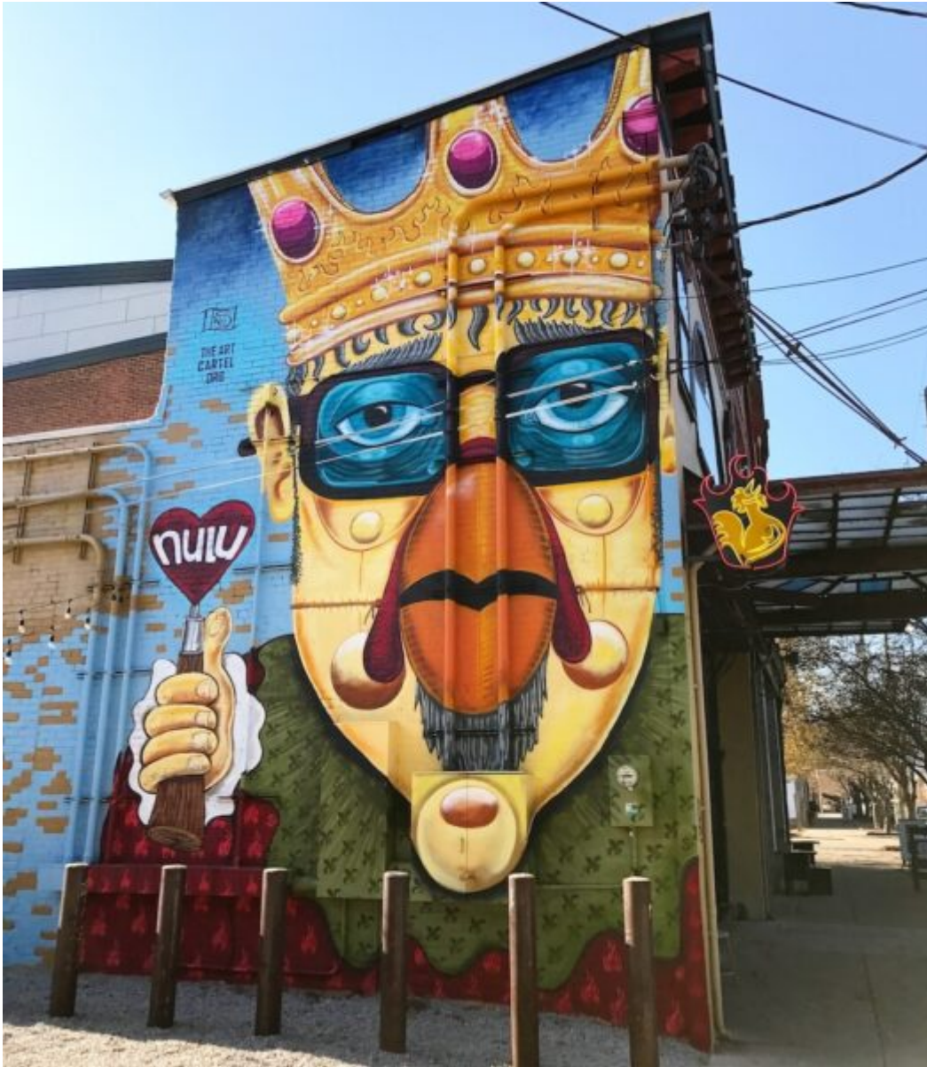
A mural on Royals Hot Chicken

The musicians sat on benches backed by a large, tattered American flag on the wall. As I ate, the easy music pulled me in. It might have been the beer, but I kept thinking, “This city is growing on me.”