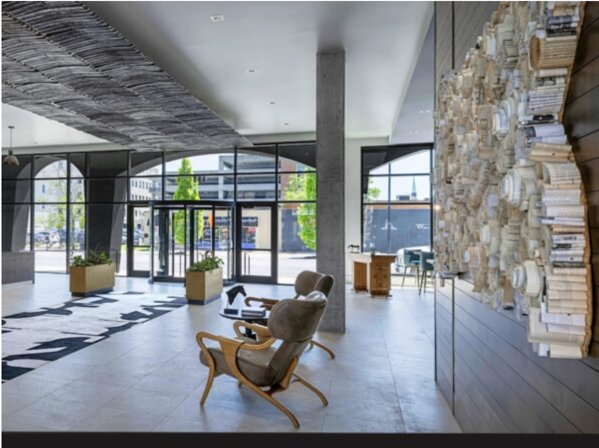
Hotel Bourre? Bonne lobby

Looking up after entering the lobby, I saw deconstructed bourbon barrels (called staves), lining the ceiling—a tribute to Kentucky’s distilling legacy. My short walk around the lobby, the rooftop pool, and bar turned up interesting art I wanted to explore. But first, I strolled Whiskey Row , a block spanning Main Street that dates to the mid-1800s. As the name suggests, the trade here included Kentucky bourbon, but also spirits from other states, including West Virginia and Pennsylvania. The liquor was blended along the row, warehoused, and shipped downriver to New Orleans, and also to the West.