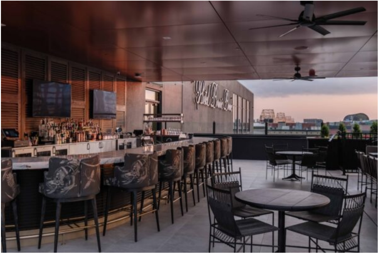
The hotel's rooftop includes a pool and hot tub

Among the bottles we sampled was I.W. Harper, a 15-year bourbon with rich, tannic notes. “A spicier, bolder extraction,” Butterworth explained. “Nutty, spicy, and rich and robust. It has an oaky tannic finish. Sort of a granola, grainy mouthfeel.” He was spot on with the description.