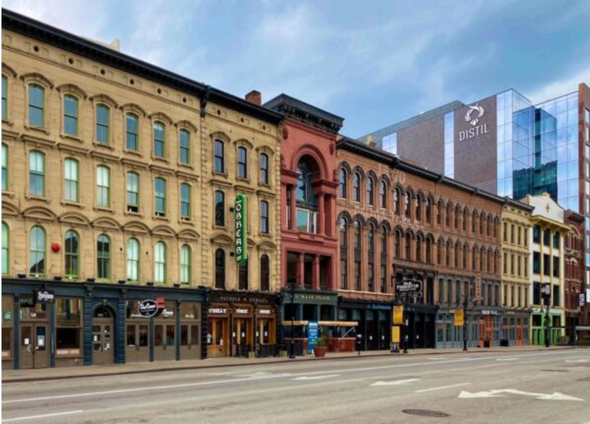
Louisville's Whiskey Row

Along the stretch, also called the Iron Quarter, there are numerous cast-iron facades—it's one of the largest concentrations outside of New York's SoHo. Now, the Row is largely a tourist district with hints of a bourbon theme park feel. Tasting rooms are lined up with logo-branded merch crowding doorways: glassware, leather flasks, Derby hats, and bourbon-infused chocolate.