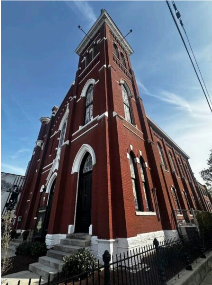
The Last Refuge is housed in a renovated 1880s German Methodist church

The Last Refuge is the flagship venue for Bob Dylan's Heaven's Door Spirits brand. The property includes enormous black-and-white murals of Dylan painted on the building. You get the feeling that he's watching over the place.