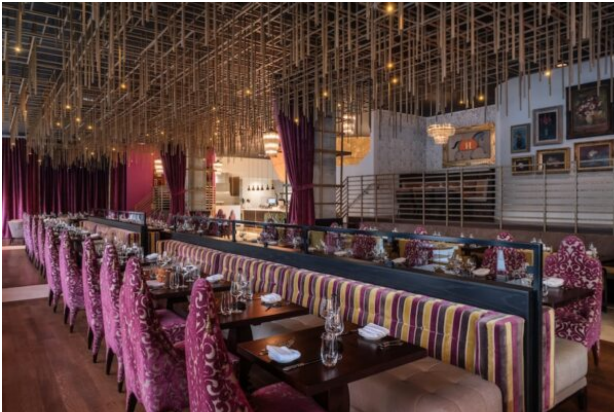
The Steakhouse Bourré Bonne

The French-inspired menu has a good selection of appetizers—smoked fish dip, lamb meatballs, and tuna tartare, among others. Steak choices include Fischer Farms filet mignon, Black Hawk Farms Wagyu strip, and Australian Wagyu Picanha. I chose the latter, served with truffle butter—delectable. But even more so, my starter: the braised octopus with five-spice sweet potato, fried kale, charred onion aioli, and garlic chili crisp. It all worked wonderfully, the warm sweetness of the potato, the crackle of kale, and the smoky aioli blending with the heat of the chili crisp.