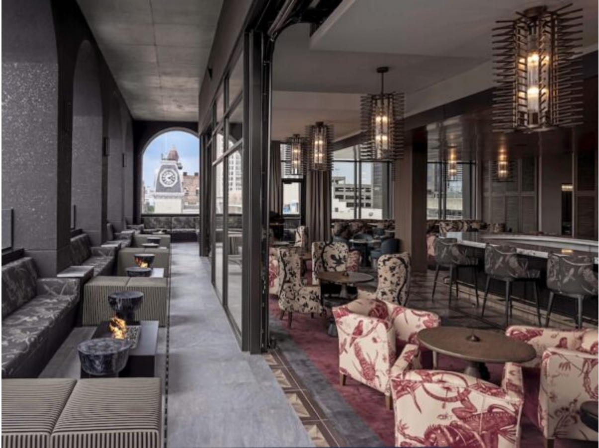
The rooftop bar is flanked by wall windows that open onto the cityscape

“I definitely get the cherry and toasted marshmallow,” I said, tipping my glass.