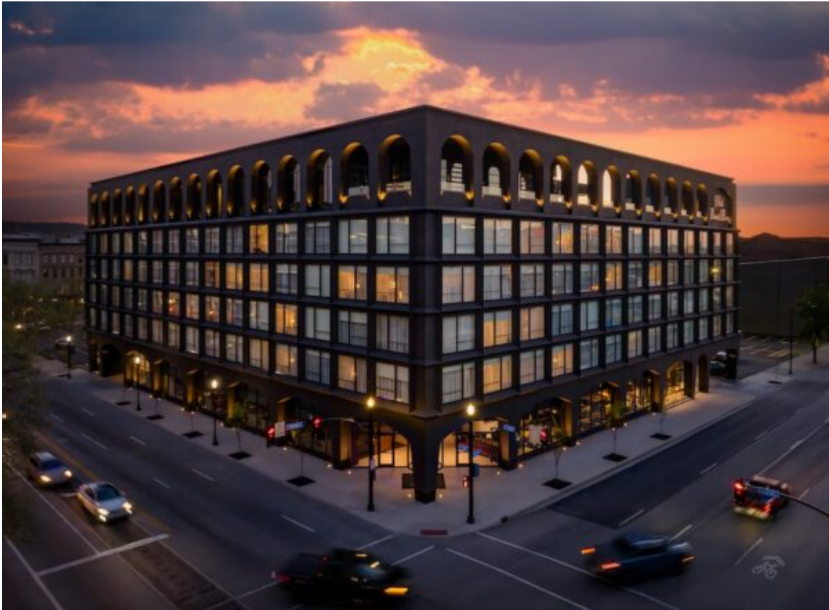
Hotel Bourré Bonne

Nearly all of the relaxed, easy-looking furniture in the hotel is sourced from Bali. It's an unassuming look that's at once stylish and comfortable. Manager Burns calls the property's experience "warm and engaging but not overpowering by any means."