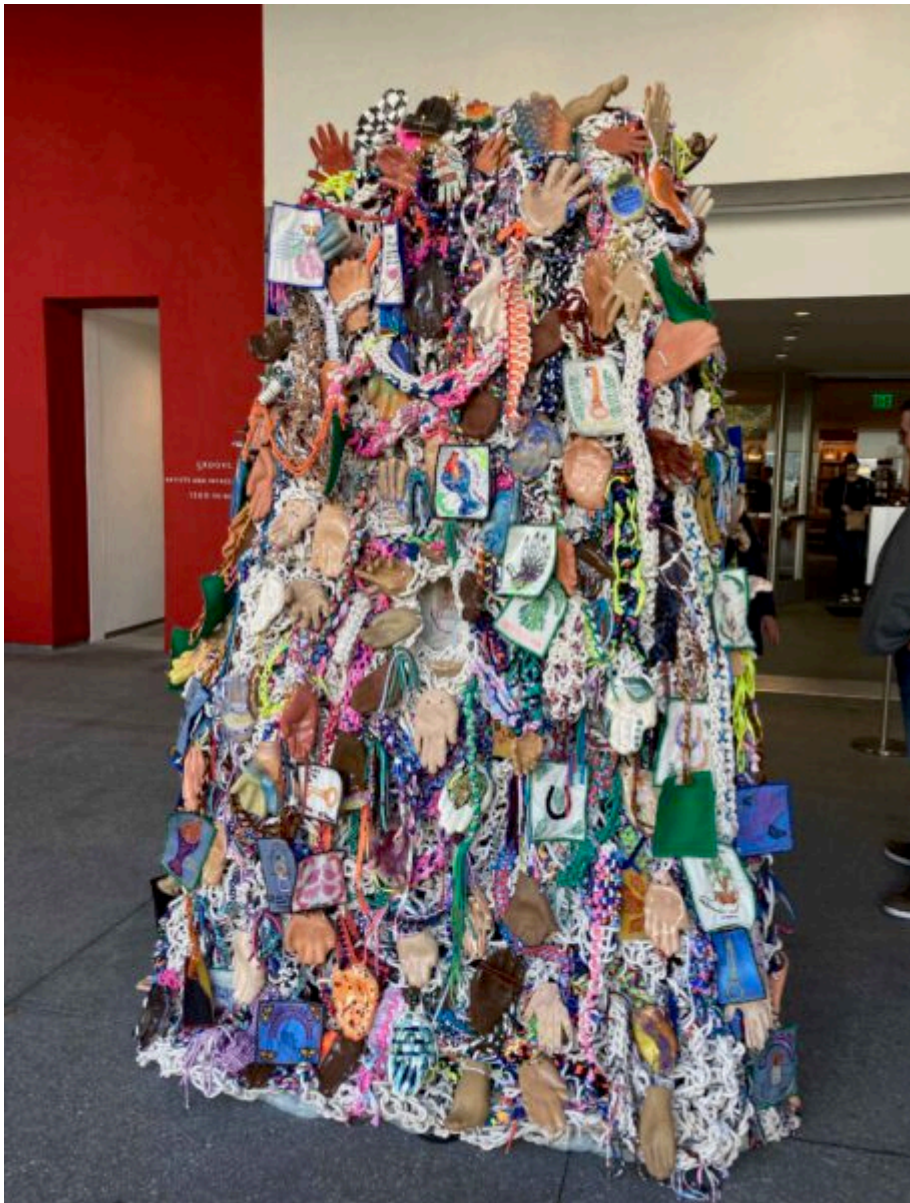
Ambos, Border Quipu

Upstairs you see a mountain of hands, strings and postcards, Border Quipu by the collective Ambos: Art Made Between Opposite Sides , founded by Tanya Aguiñiga. Watch the video about the plight of migrants crossing the U.S.-Mexico border in Tijuana.