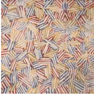
Jasper Johns, Untitled, 1975. Oil and encaustic on canvas, 127.32 x 127.32cm. The Eli and Edythe Broad Collection.