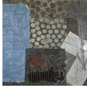
Jasper Johns, Untitled, 1992 - 4. Oil and encaustic on canvas, 199.4 x 300.7cm. The Eli and Edythe Broad Collection.

“The works in the final three galleries (of which this is one) - completed between 1989 ad 2016 - continue Jasper Johns’s explorations of memory, identity and mortality, while expanding his ongoing inquiry into the relationship between perception and meaning.” [FROM A WALL LABEL IN THE GALLERY]