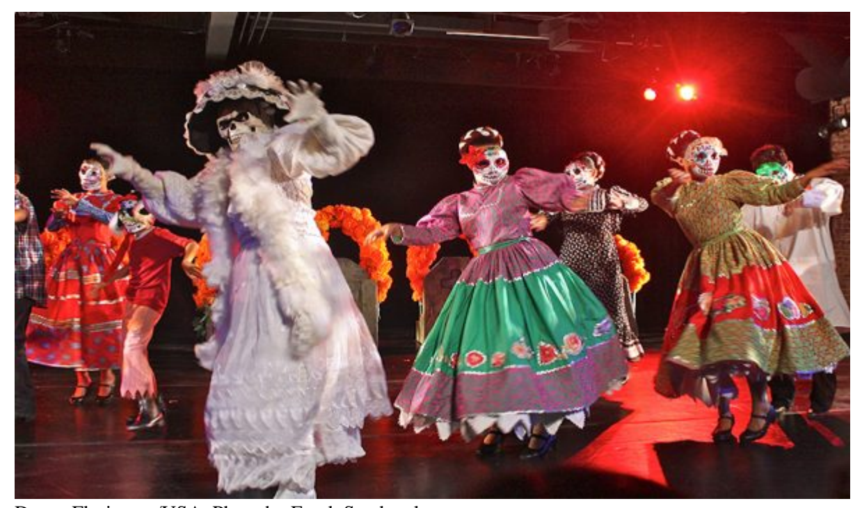
Danza Floricanto/USA.

Danza Floricanto/USA : Fiesta del Día de los Muertos at Floricanto Center for the Performing Arts, 2900 Calle Pedro Infante, East LA; Sat., Nov. 4, 8 pm, Sun., Nov. 5, 5 pm, $15 presale, $20 at door, $10 children at door. Danza Floricanto/USA.