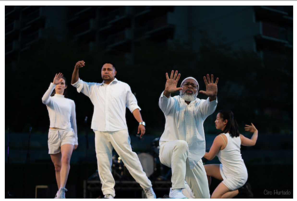
DATA or 7 ways to dance a dance through prison walls.