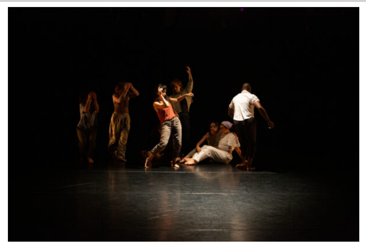
Wild Roots Dance.