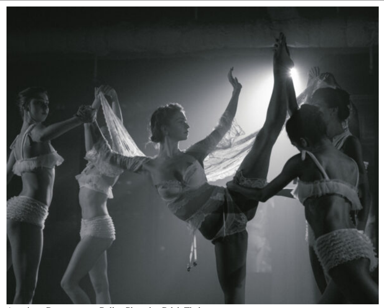
American Contemporary Ballet.