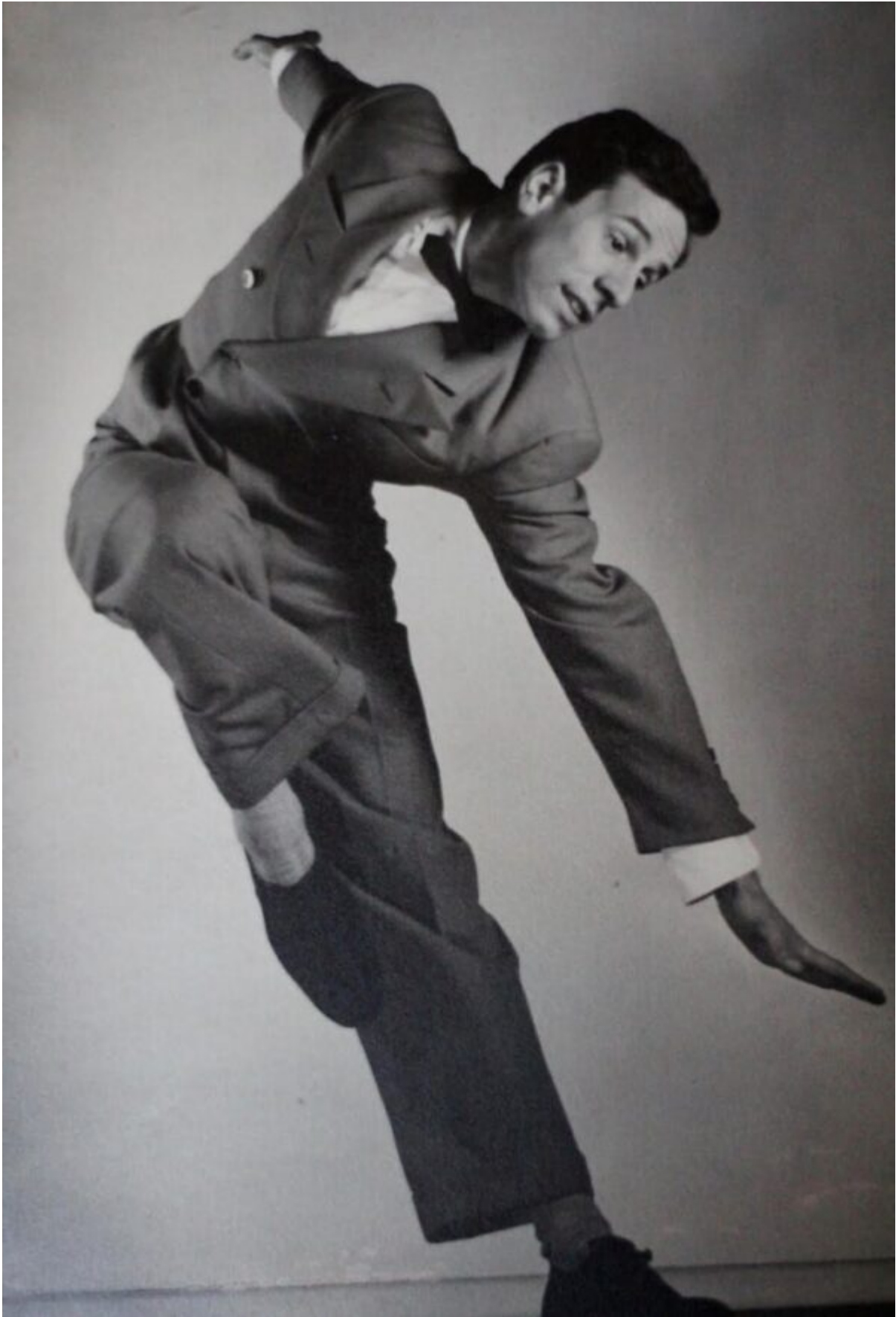
Danny Daniels.