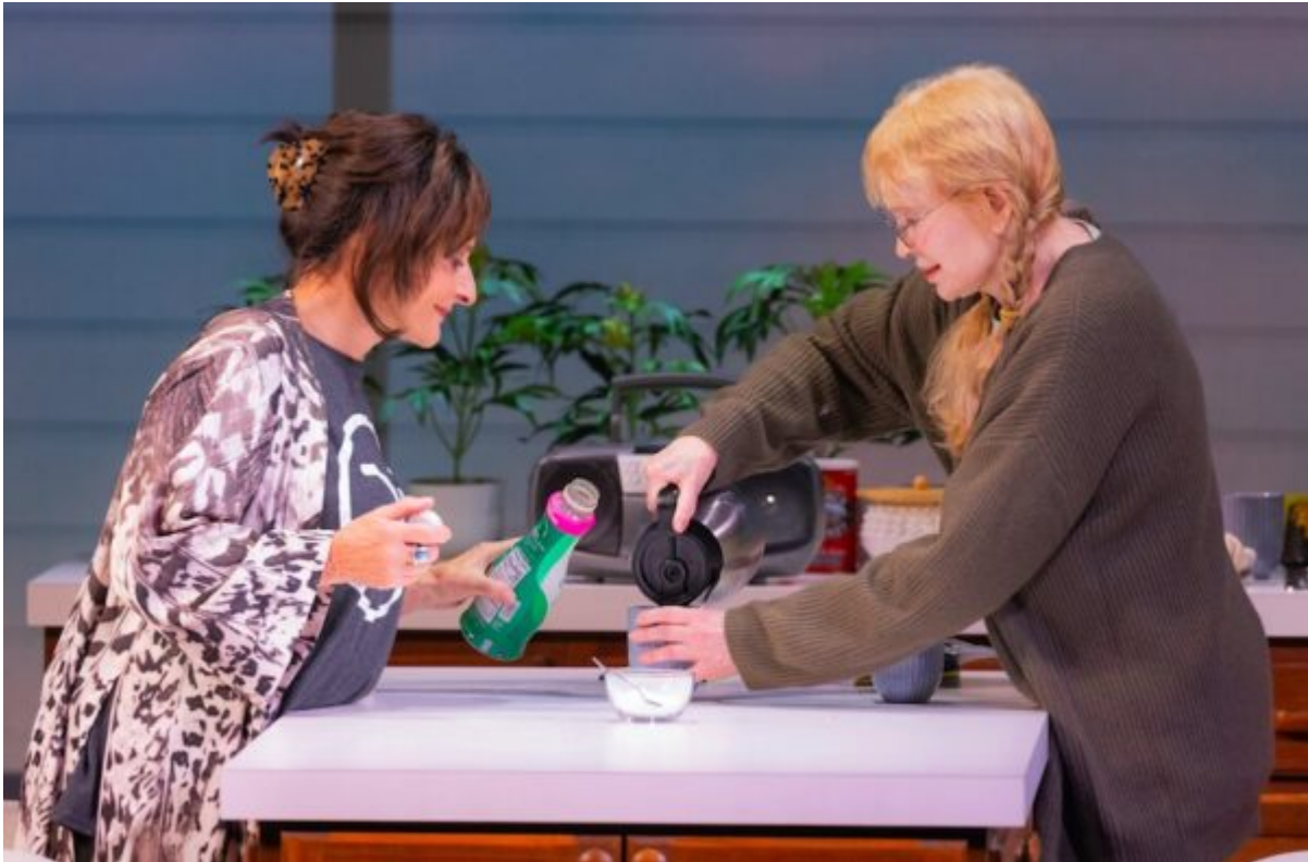
Patti LuPone and Mia Farrow in The Roommate .

David Auburn in his much stronger Summer, 1976 two seasons ago.