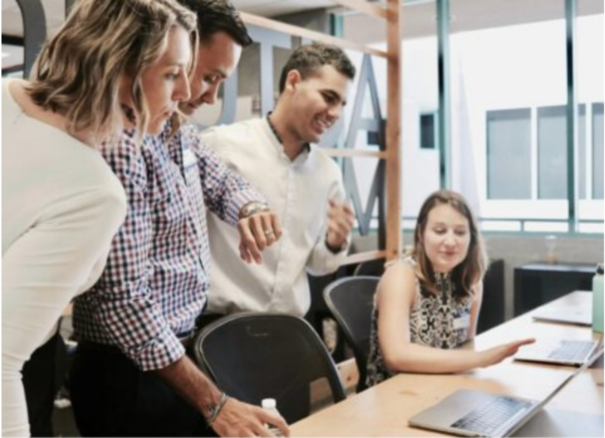
Coworkers gathering around work station.