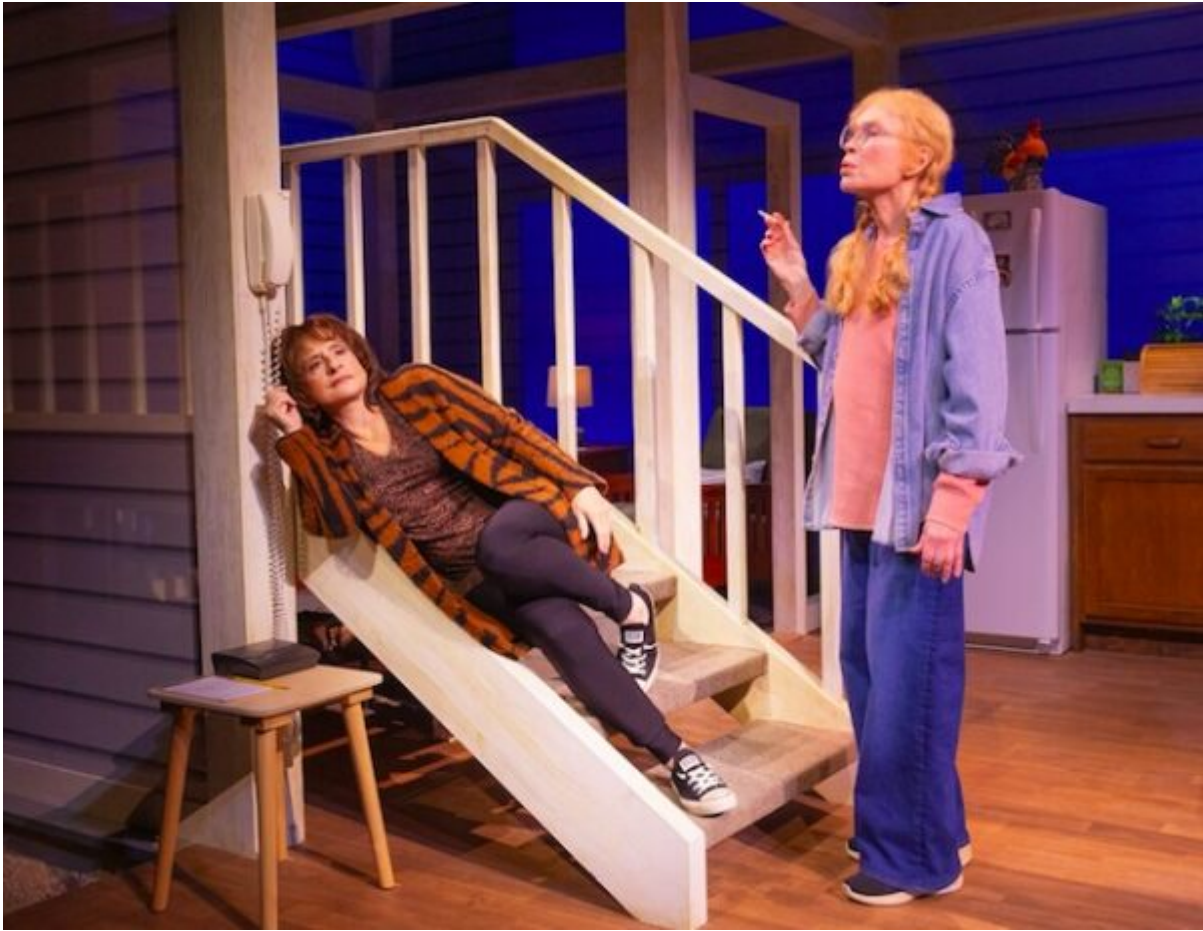
Patti LuPone and Mia Farrow in The Roommate .