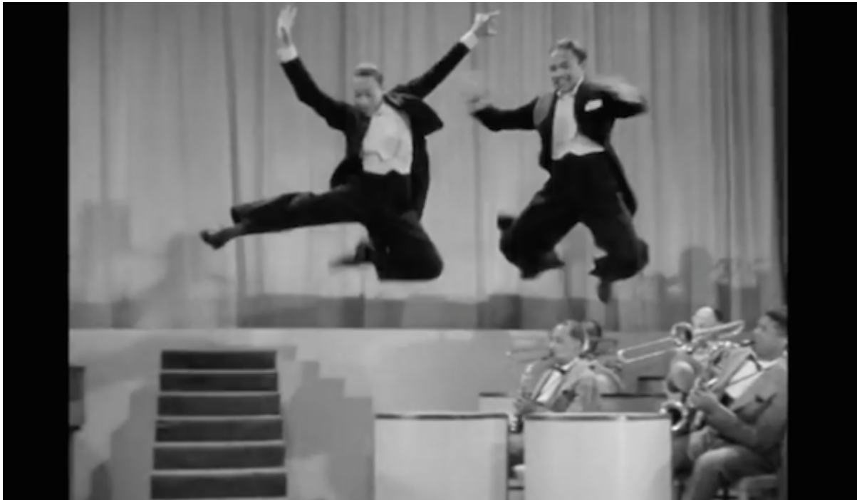
Fayard and Harold Nicholas, The Nicholas Brothers.