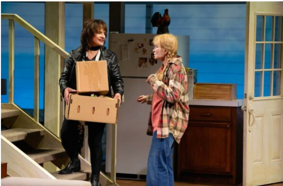
Patti LuPone and Mia Farrow in The Roommate .

The Roommate , Jen Silverman’s slight two-character comedy at the Booth, begins in an unusual way. After the house lights have dimmed, the play’s stars Mia Farrow and Patti LuPone enter. Their names and a photo of them are projected on Bob Crowley’s sprawling farmhouse set. They acknowledge the audience’s applause, exit, and then re-enter in character to start the show. This tactic may just be a decision on director Jack O’Brien’s part to get the star factor out of the way and allow us to concentrate on the play at hand, but this blatant celebrity intro is an inadvertent acknowledgment of the production’s raison d’être . We’re here to see two big names in rare circumstances—this is one of Farrow’s few stage appearances and an infrequent non-musical outing for LuPone, particularly after she very publicly renounced her Equity membership. Silverman’s play is a secondary consideration.