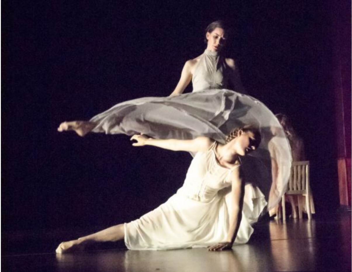
Nancy Evans Dance Theatre.

Since 2019, a consortium of dance companies based in the cities along the San Gabriels have presented themselves under the banner FOOTHILLS DANCEMAKERS . The group returns, offering a chance to sample perspectives on contemporary dance from a quartet of top notch LA-based companies: Benita Bike's DanceArt , Pennington Dance Group , Nancy Evans Dance Theatre and Lineage Dance . Lineage Performing Arts Center, 920 E. Mountain St., Pasadena; Sat., Feb. 10, 7:30 pm, Sun., Feb. 11, 4 pm, $25, $20 students & seniors. Lineage PAC .