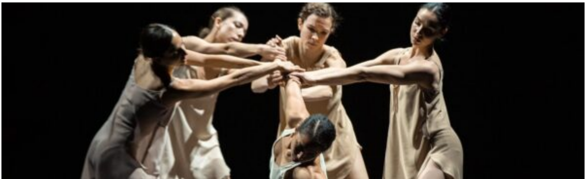
Compañía Nacional de Danza.