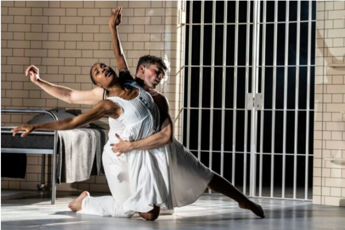
Matthew Bourne's Romeo and Juliet.