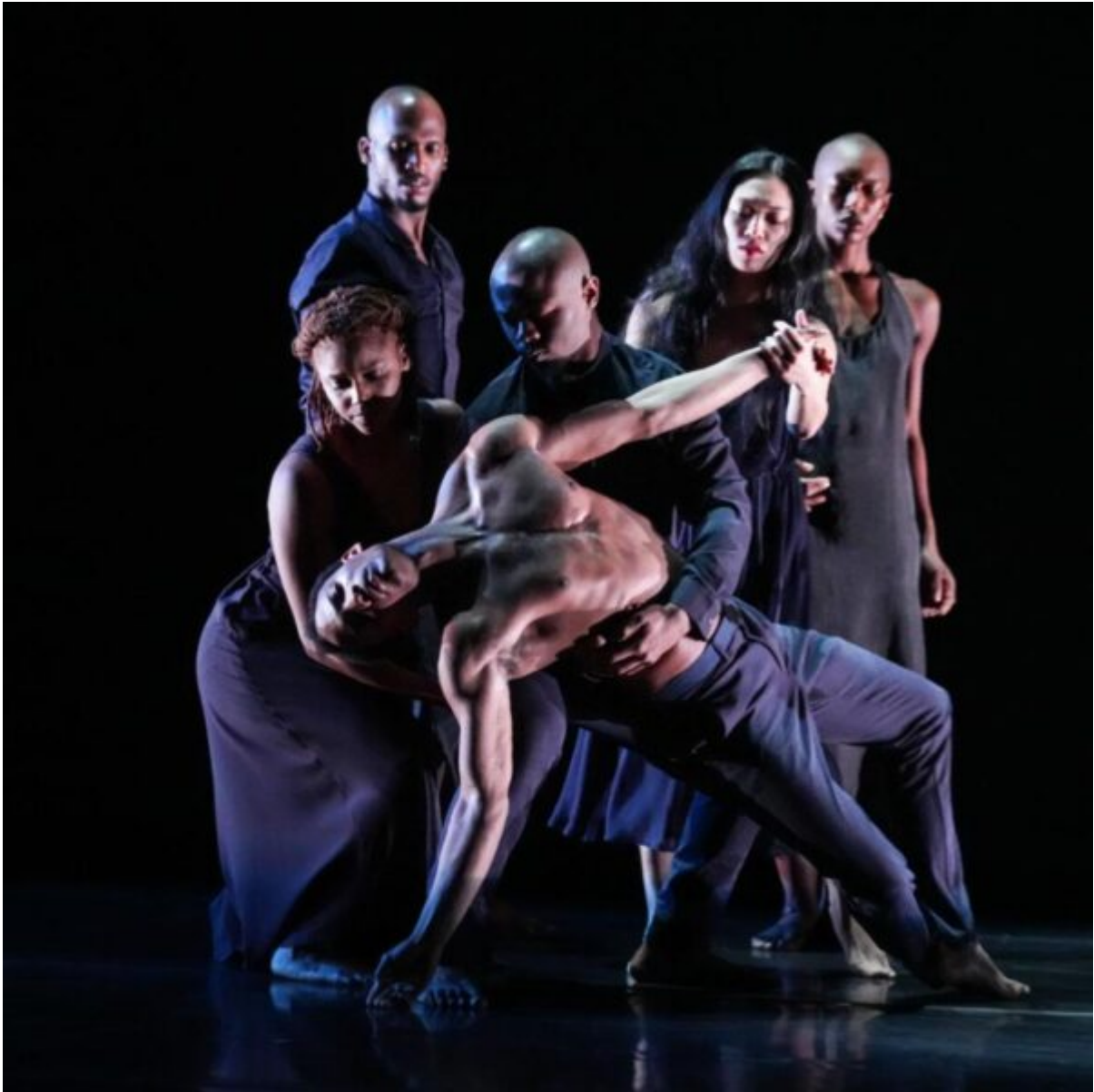
A.I.M. by Kyle Abraham.