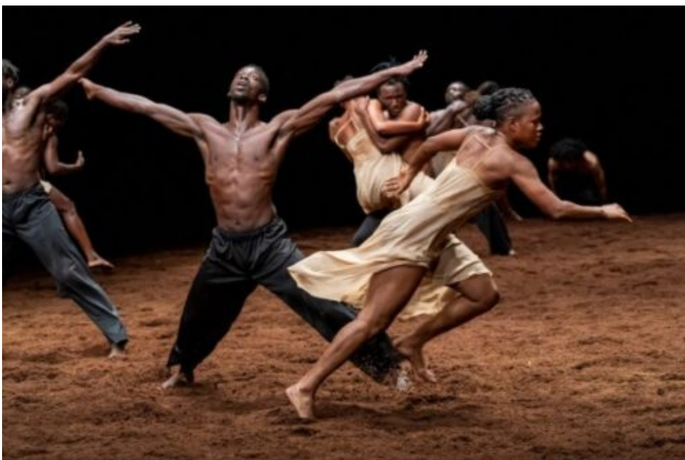
Pina Bausch's "The Rite of Spring."