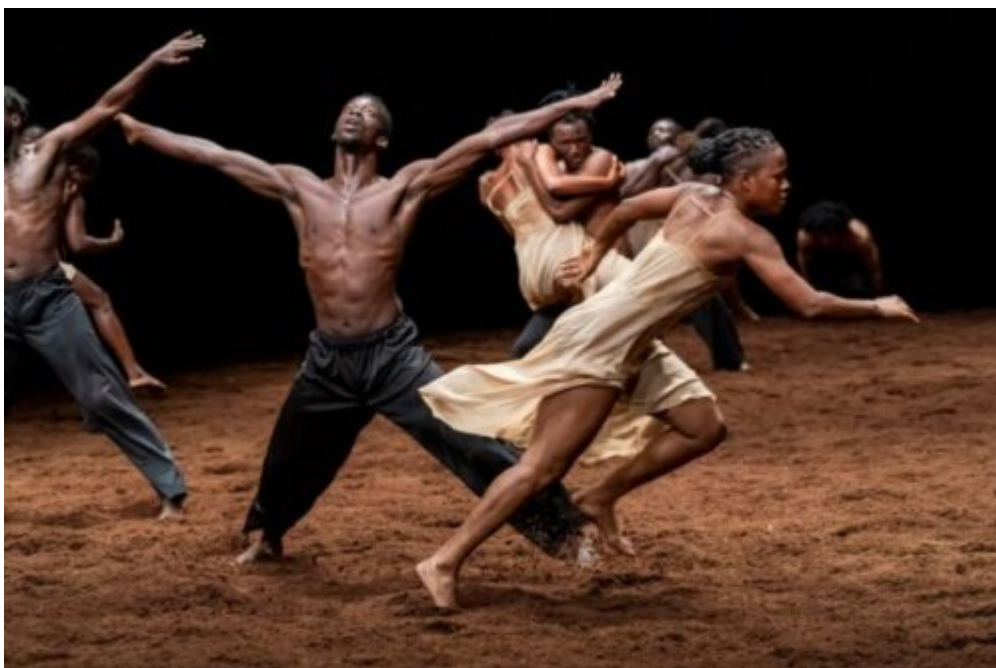
Pina Bausch's "The Rite of Spring."