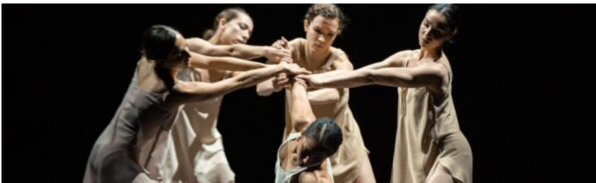
Compañía Nacional de Danza.

The Spanish ballet company Compañía Nacional de Danza made its mark under founder Victor Ullate, later under contemporary choreographer Nacho Duato, and since 2019 with artistic director Joaquín De Luz. Both Duato and de Luz are represented in the works scheduled for this visit, along with a third dance by Sol León and Paul Lightfoot. The Luckman Fine Arts Complex, Cal State University Los Angeles, 5151 State University Dr., East LA; Thurs., Feb. 15, 8 pm, 55-$195. Luckman Fine Arts Complex .