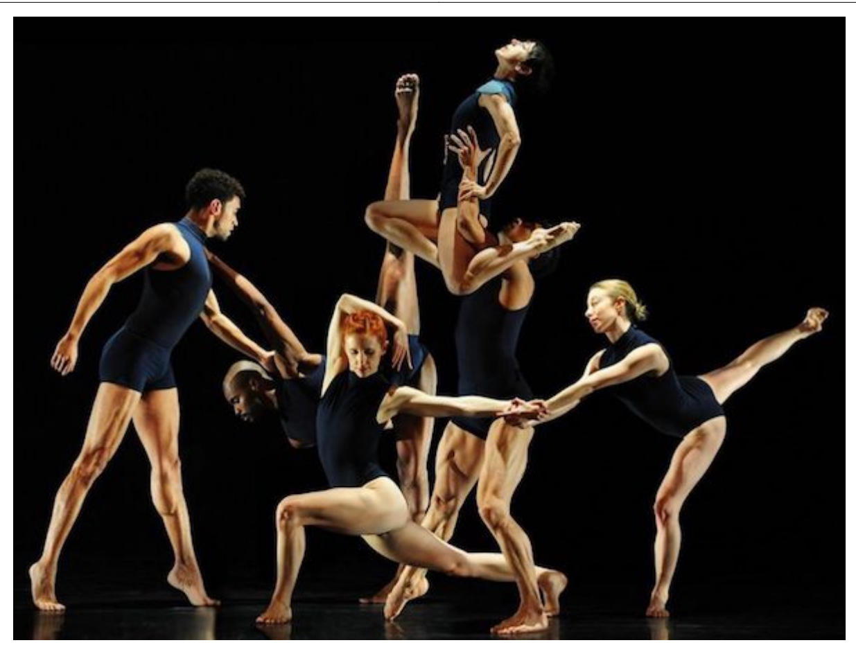
Kybele Dance Theater.