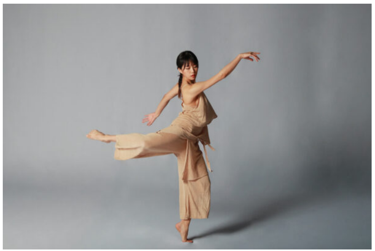
Films.Dance.