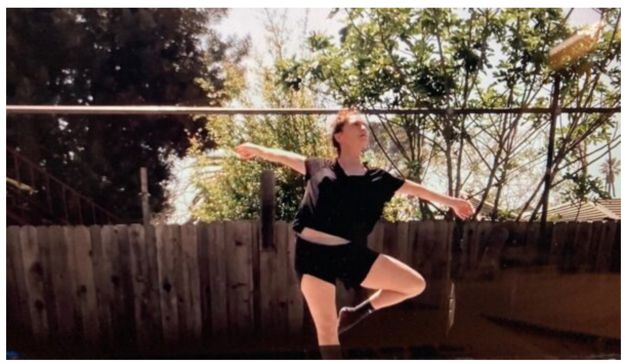
Rosanna Gamson/World Wide.

the tales of the ten travelers unfold one at a time, Gamson's The Decameron Project rolls out ten films, each made by a different artist. All ten episodes are now live and viewable for free on RGWW and on Instagram.