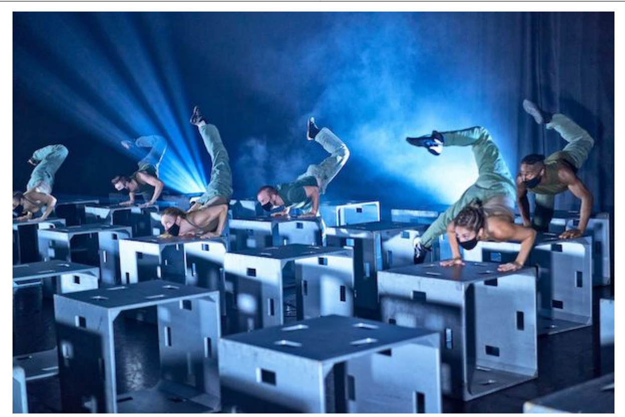
Diavolo Veterans Project.