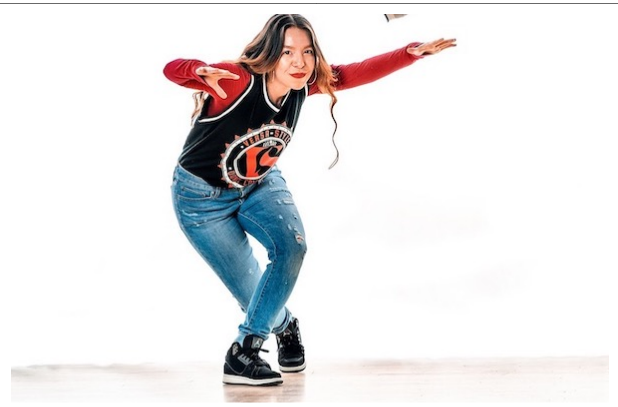
Versa Style Dance.