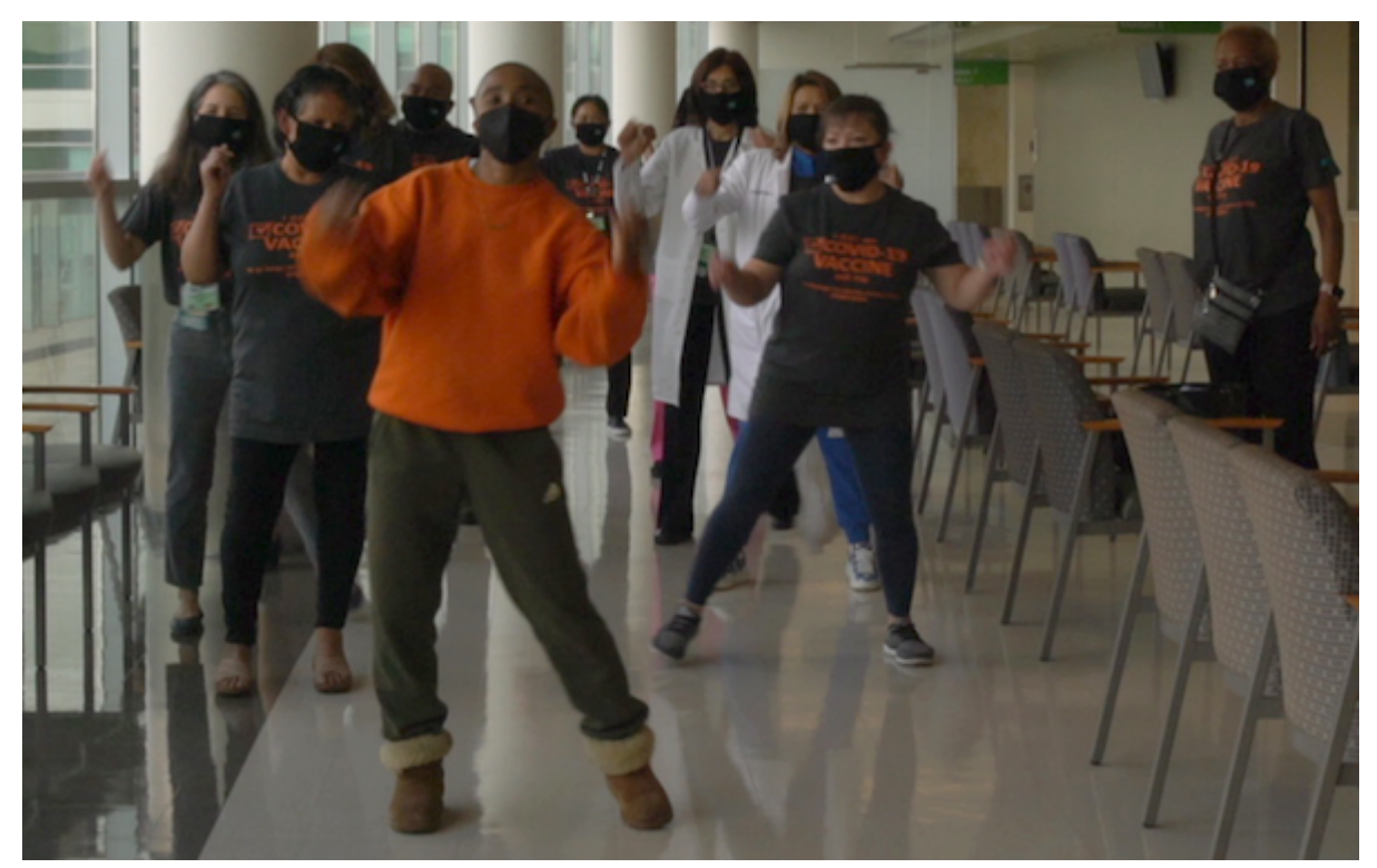
Heidi Duckler Dance.