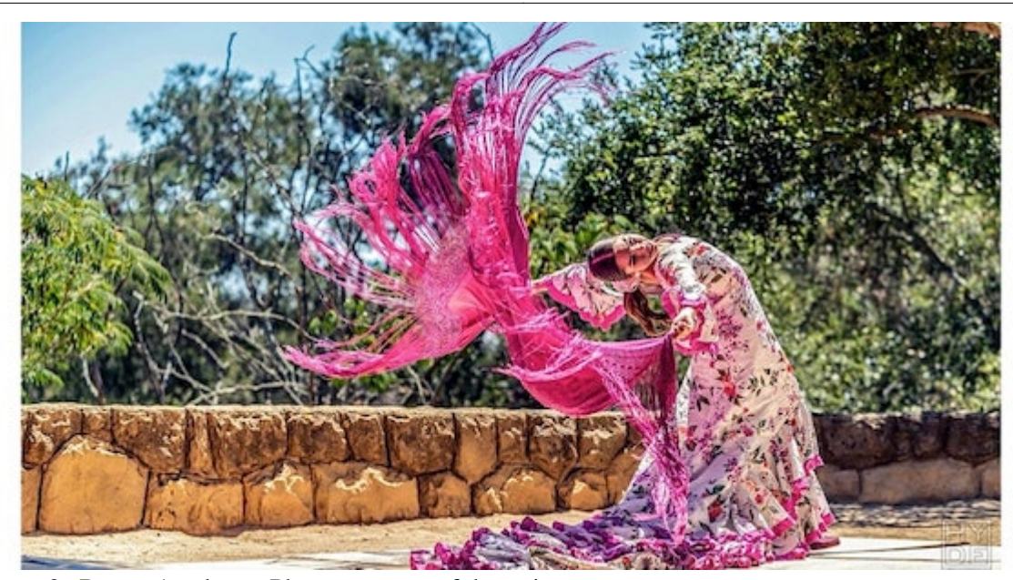
Zermen?o Dance Academy.