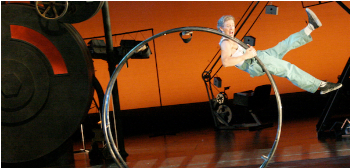
Cirque Mechanics.

Machines meet acrobatics as a depression era factory is transformed in Cirque Mechanics' Birdhouse Factory . At Smothers Theatre, Pepperdine University, 24255 Pacific Coast Hwy., Malibu; Wed., Oct. 27, 7:30 pm, $22.50-$50. Peppertdine .