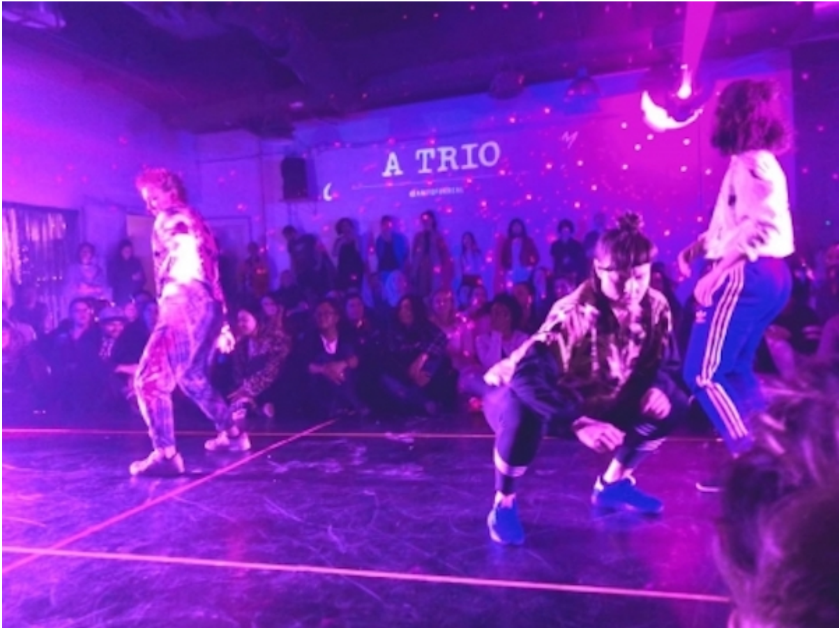
REDCAT NOW Festival.