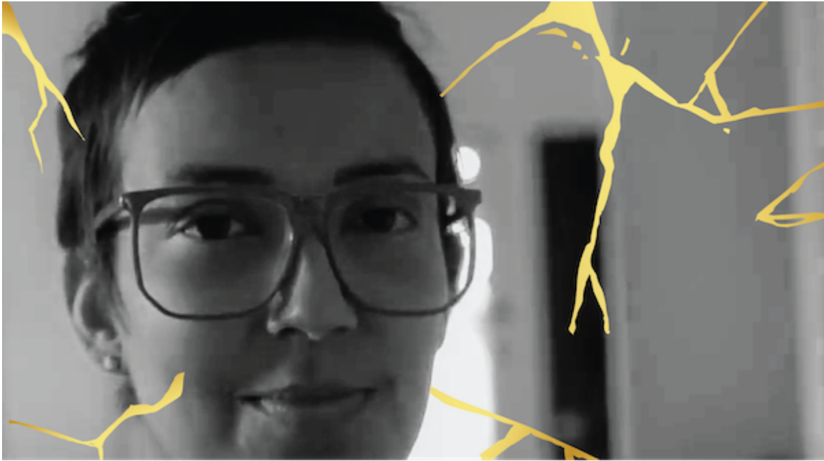
The Kintsugi Spirit.