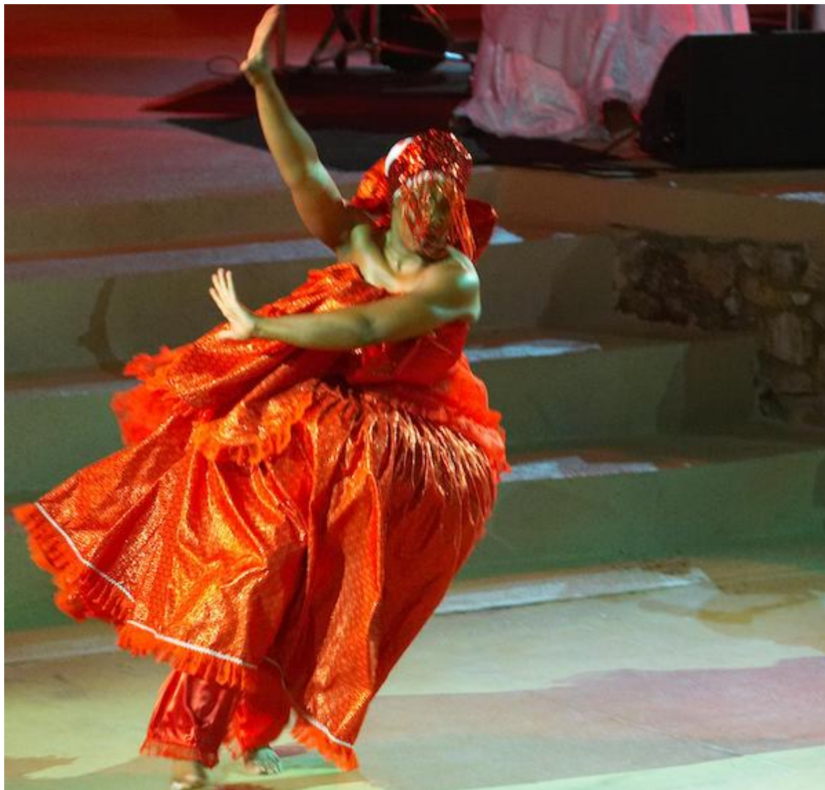
Viver Brasil.