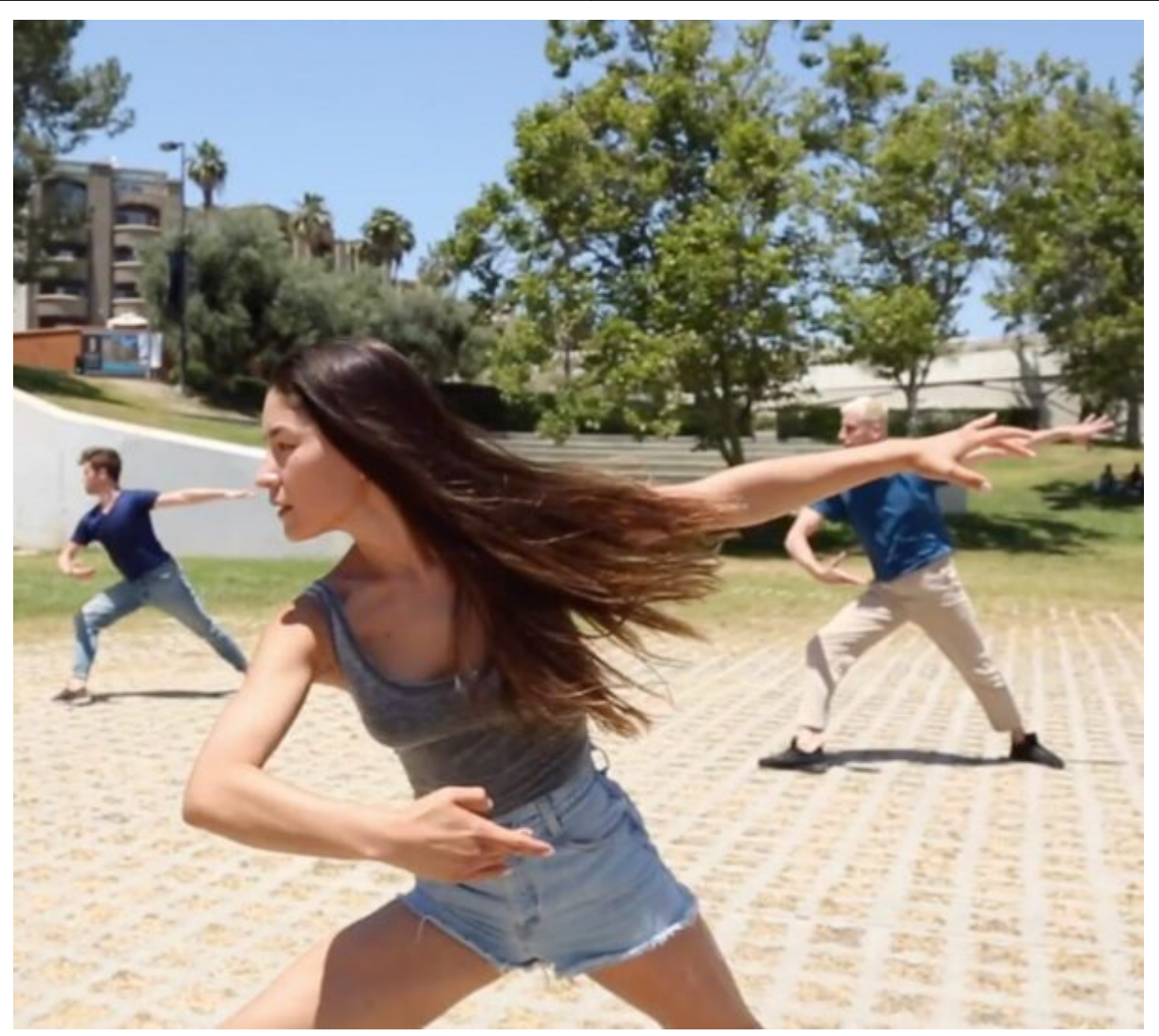
Barak Ballet.