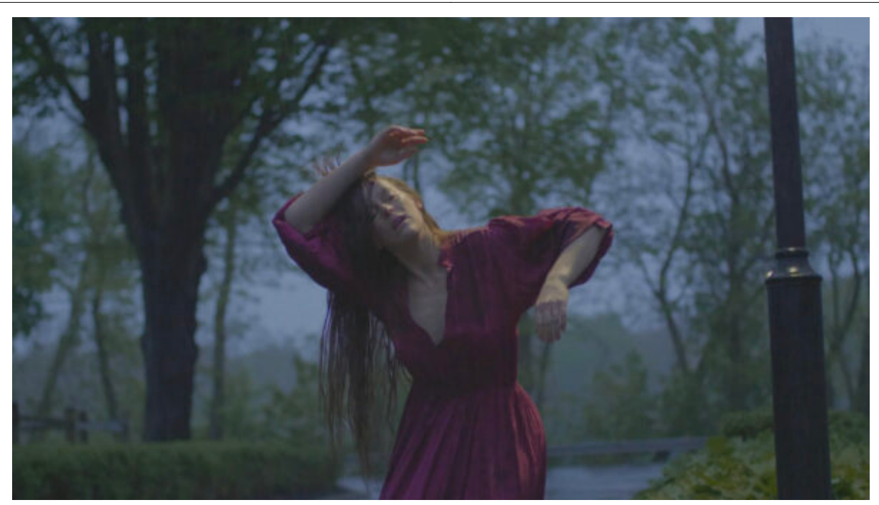
Dance Camera West Drive In.