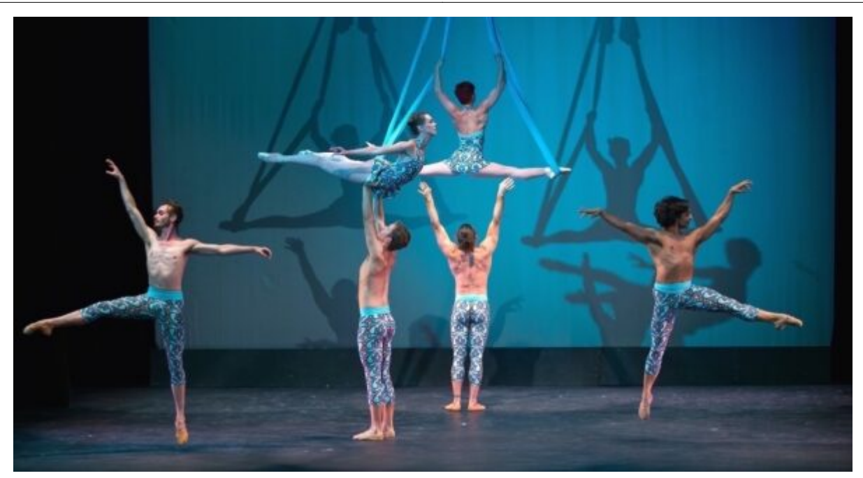
Luminario Ballet.