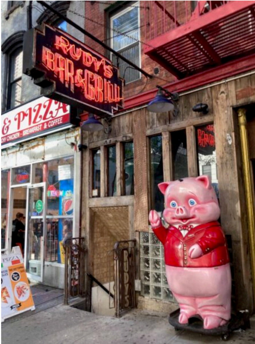
Rudy's, 9th Ave

I perused a street market along 9th Ave, saw some eateries.