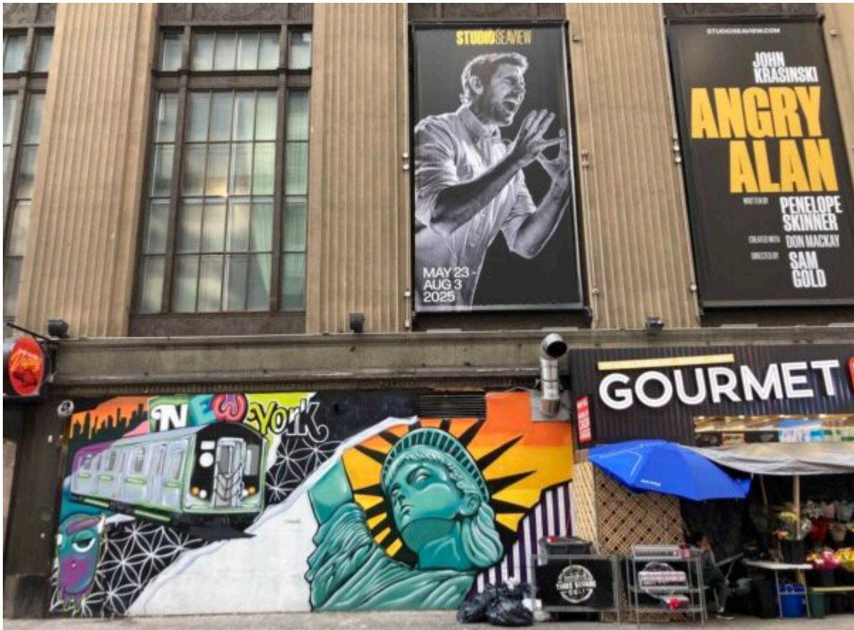
Mural. W 44th St