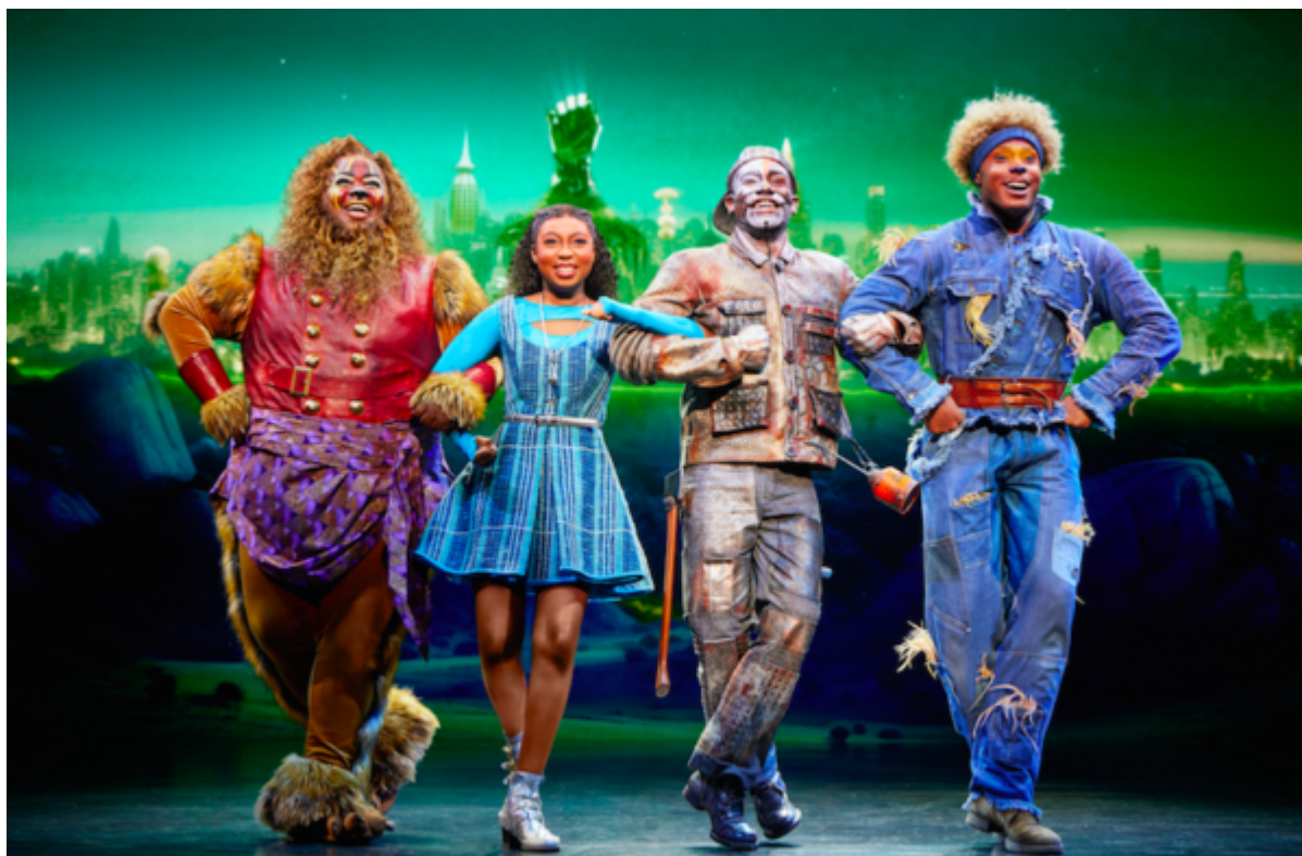
The Wiz.

reputation on the athleticism, flexibility, and group precision of its dancers, but dodged questions about its connections with China's banned Falun Gong. More recently, the organization has faced accusations of dancer abuse and a lawsuit alleging child labor violations. In that context, the company tours local venues from now through early February. The Soraya, Cal State University Northridge, 18111 Nordhoff St., Northridge; Thurs., Jan 15, 2 pm, Fri, Jan. 16, 7 pm, Sat.-Sun., Jan. 17-18, 1 pm, $86-$186. Also at The Music Center, Dorothy Chandler Pavilion, 135 N. Grand Ave., Downtown LA; Thurs., Jan. 22, 2 pm, Fri., Jan., 23, 7:30 pm, Sat.-Sun., Jan. 24-25, 1 pm, $91-$231. Also at Thousand Oaks Civic Arts Plaza, 2100 E. Thousand Oaks Blvd., Thousand Oaks; Fri., Jan. 30, 7:30 pm, Sat.-Sun., Jan. 31-Feb. 1, 1 pm, $94.40-$196.95. Also at Long Beach Terrace Theater, 300 E. Ocean Blvd., Long Beach; Fri., Feb. 6, 7:30 pm, Sat.-Sun., Feb. 7-8, 1 pm, $89-$218. Shen Yun .