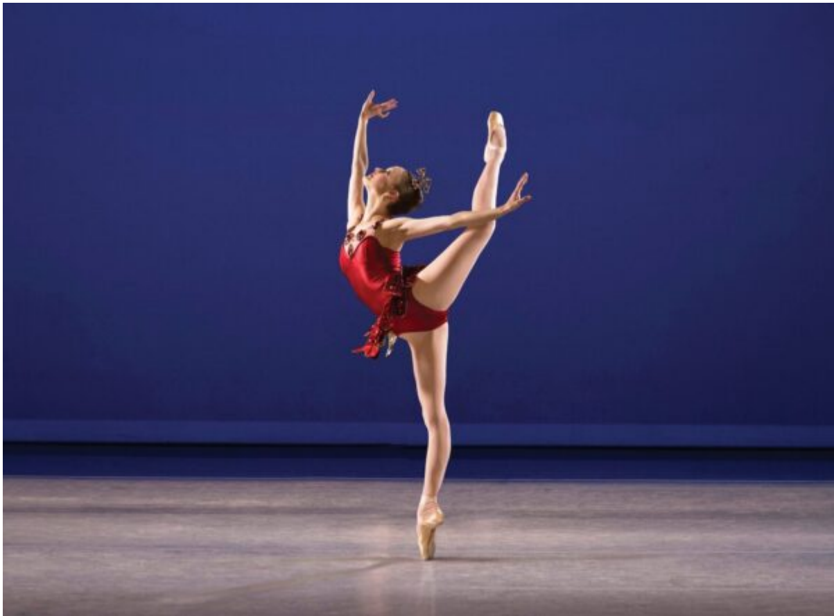
Los Angeles Ballet.

Sun., Jan. 29-31, 7:30 pm, $64.90-$119.90. Los Angeles Ballet .