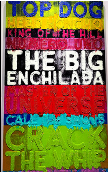
Top Dog, 2018 – Mel Bochner