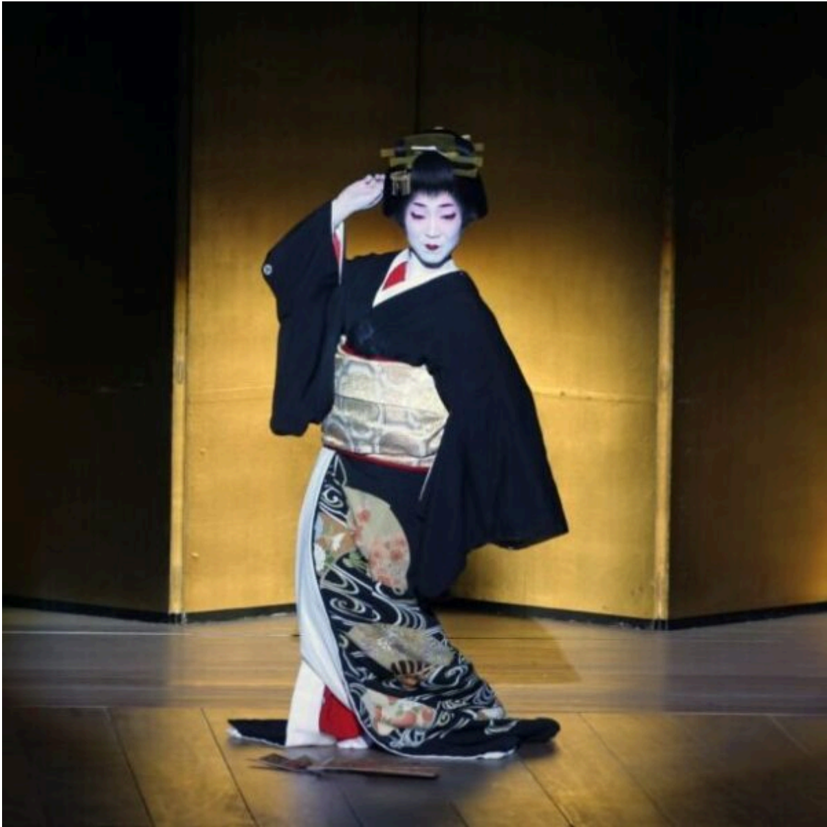
Wai No Kai.