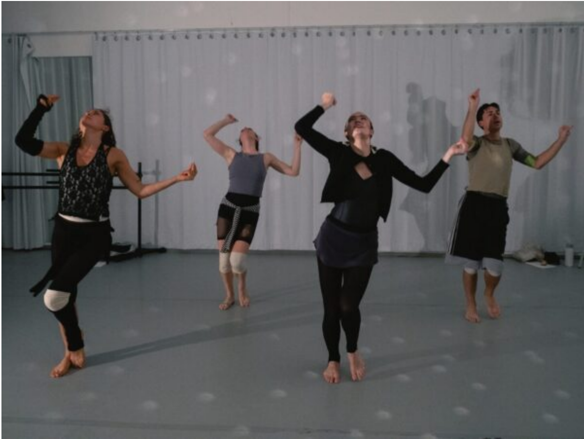
TAQ Dance.