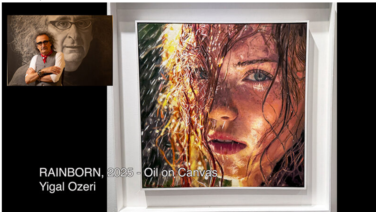
Rainborn, 2025 – Yigal Ozeri