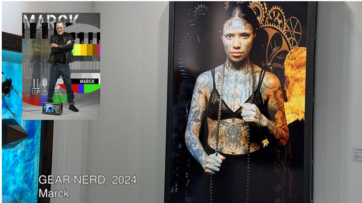
Gear Nerd, 2024 – Marck