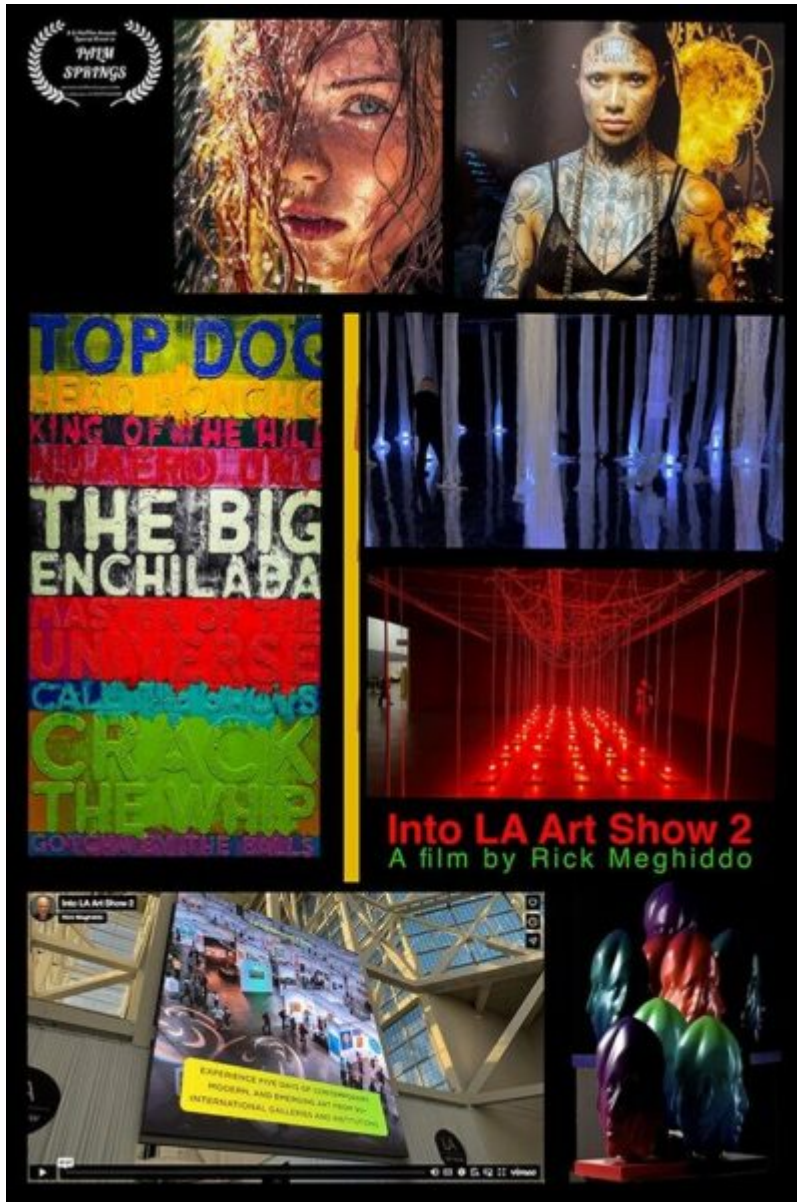
Into LA Art Show poster

Posted in Fine Art , Visual Art | No Comments »