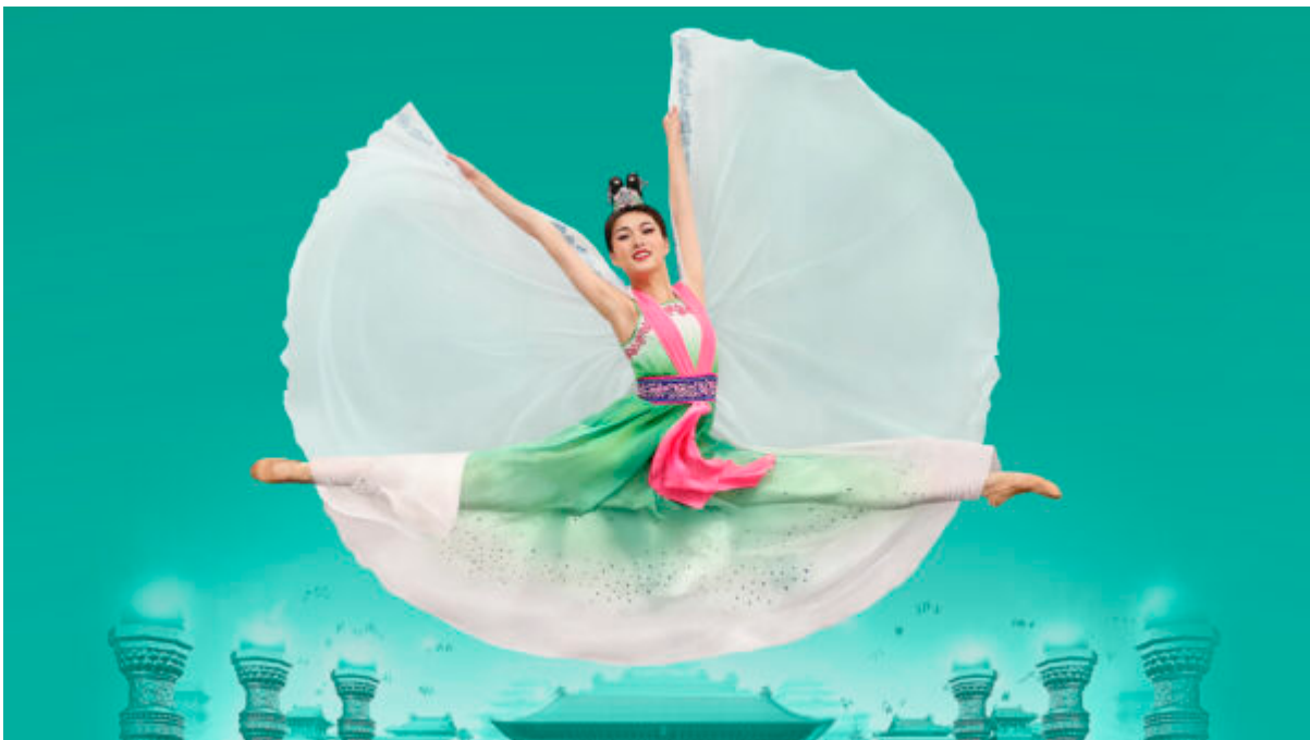
Shen Yun.

The visiting Peking Acrobats bring their artistic gymnastics and breathtaking athletics to town in a show evoking a carnival. Carpenter Center, Cal State University Long Beach, 6200 E. Atherton St., Long Beach; Sat., Jan. 17, 8 p.m., $38.75-$58.75. Peking Acrobats