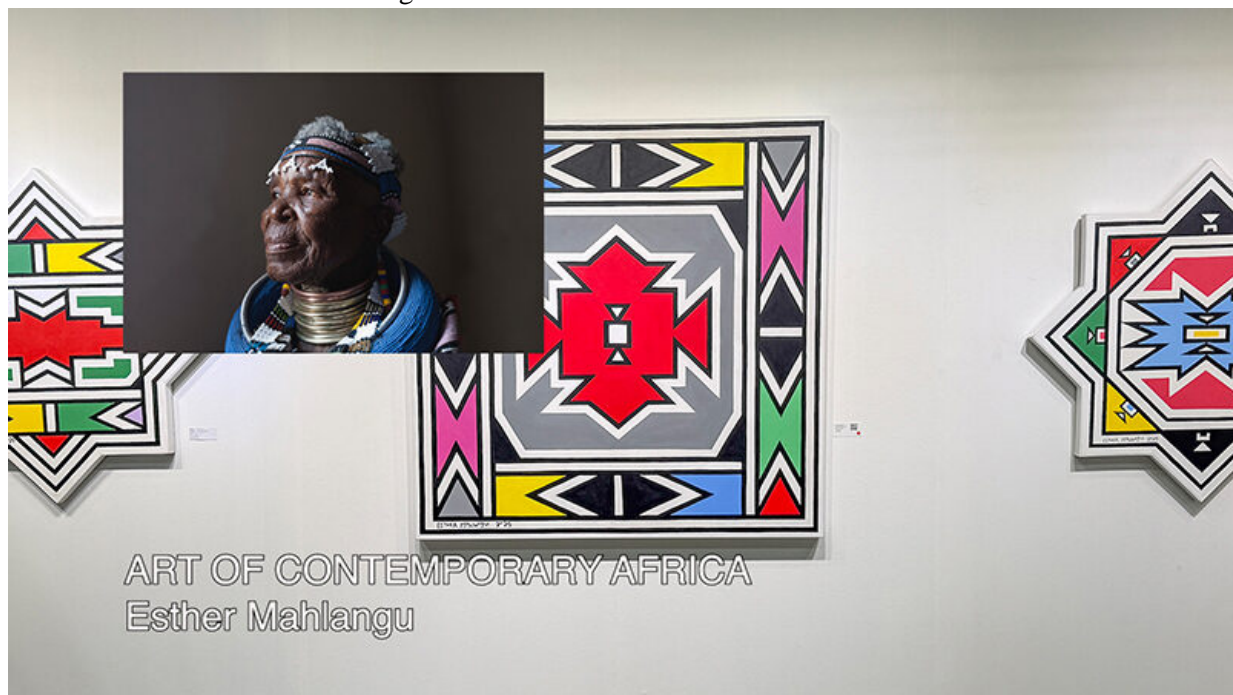
Art of Contemporary Africa – Esther Mahlangu