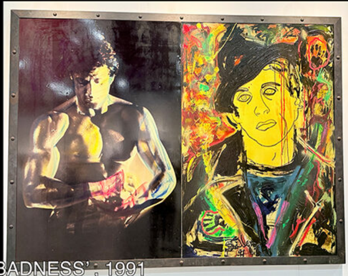
MALE PATTERN BADNESS', 1991 Sylvester Stallone

Male Pattern Badness, 1991 – Sylvester Stallone