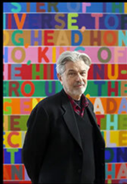
TOP DOG, 2018 Mel Bochner