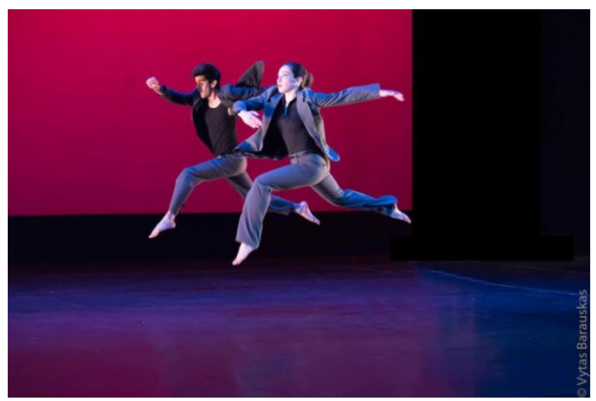
OC Dance Festival's AkomiDance.