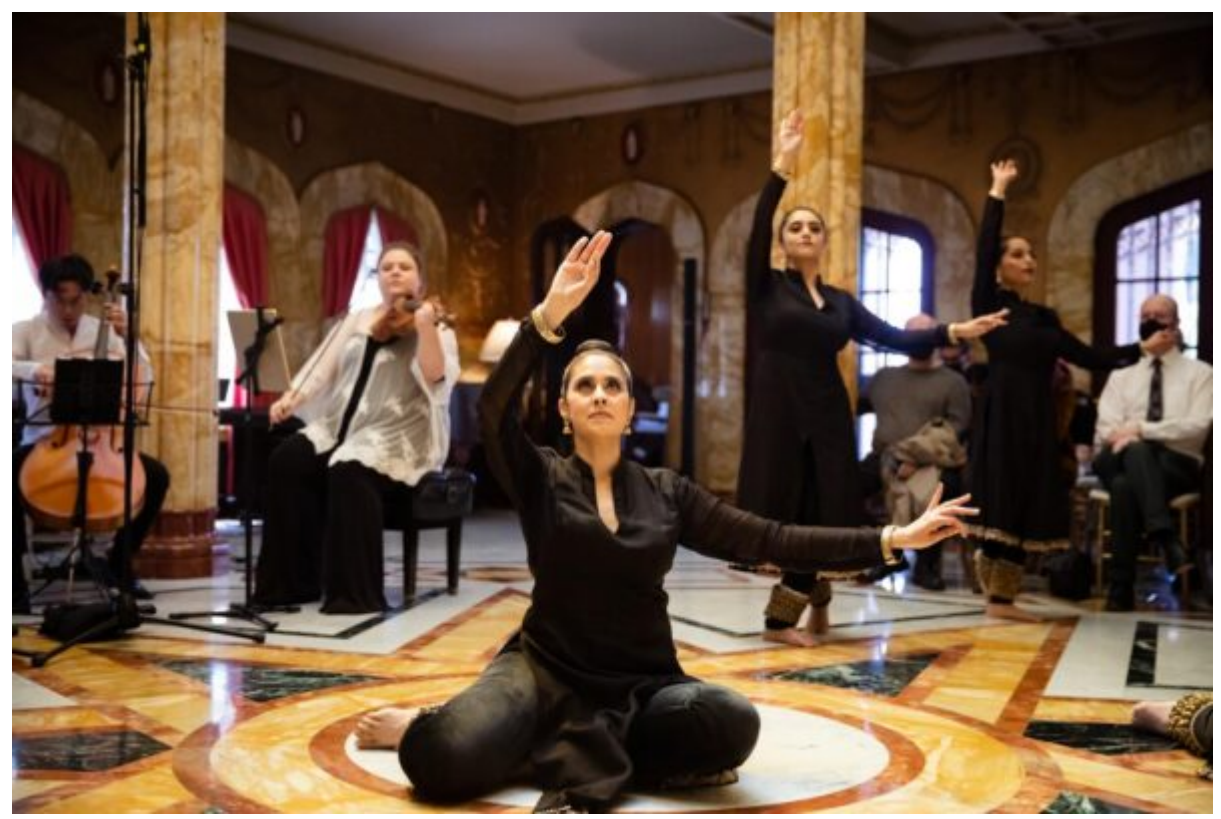
Leela Dance Collective.

In what may prove a pleasant surprise to unsuspecting beachgoers and others, Leela Dance Collective brings India's Kathak dance to Venice Beach, UCLA, Santa Monica Promenade, and the Culver Steps in four days of free pop up performances, plus a concluding ticketed concert performance in Agoura Hills. It's part of Asian American & Pacific Islander Heritage (AAPI) Month. Bruin Plaza, UCLA Campus, 308 Westwood Plaza, Westwood; Thurs. & Fri., May 2 & 3, noon, free. Also along Ocean Front Walk between Venice Blvd. and Rose Ave., Venice, Beach; Sat., May 4, 10 & 11 am, free. Also at the 3rd Street Promenade between Colorado and Wilshire Blvds., Santa Monica; Sat., May 4, 3 & 4 pm, free. Also at the Culver Steps, 9300 Culver Blvd., Culver City; Sun., May 5, noon, 2 & 5 pm, free. Also ticketed performance at Agoura Hills Performing Arts & Education Ctr., 28545 W. Driver Ave., Agoura Hills; Sat., May 11, 4:30 & 7:30 pm, $25 The PAECs; livestream $10 Imagine India.