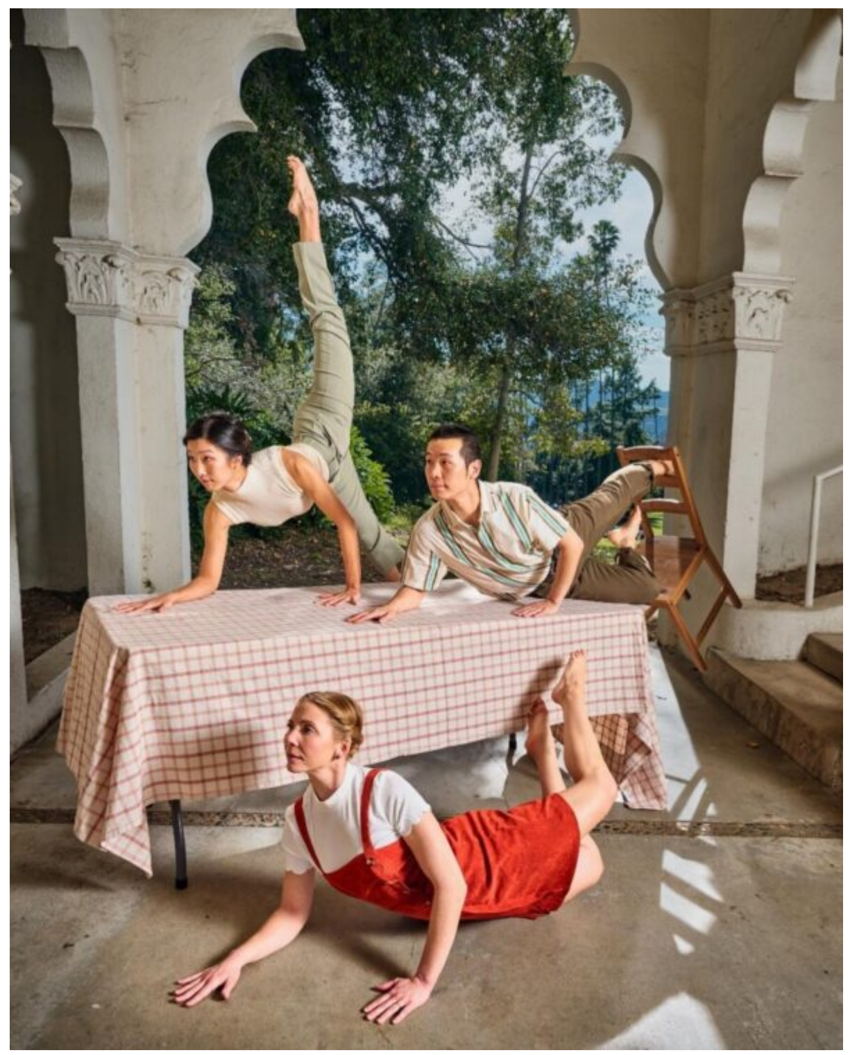
Re:borN Dance Interactive.