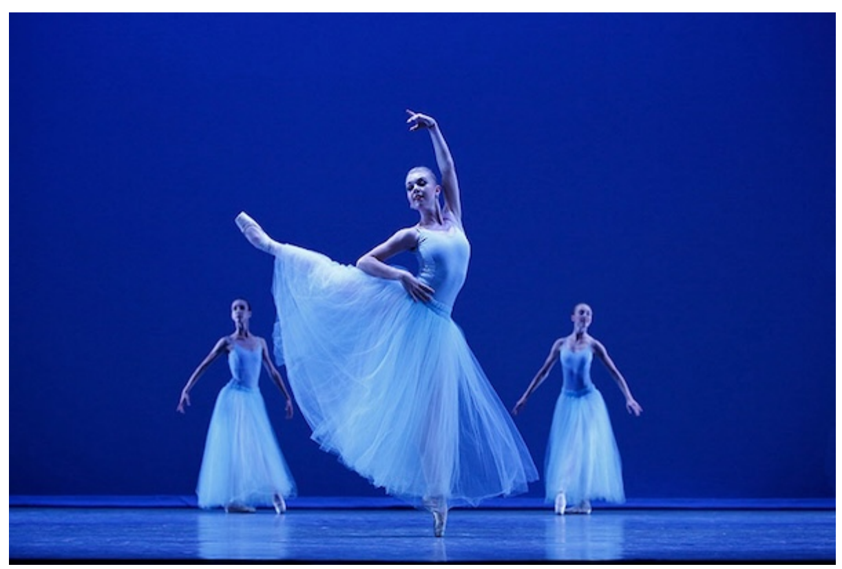
Los Angeles Ballet.

Redondo Beach Blvd., Redondo Beach; Sat., May 25, 2 & 7:30 pm, Also at UCLA Royce Hall, 10745 Dickson Ct., Westwood; Sat., June 1, 2 & 7:30 pm, $76 to $137. Los Angeles Ballet.