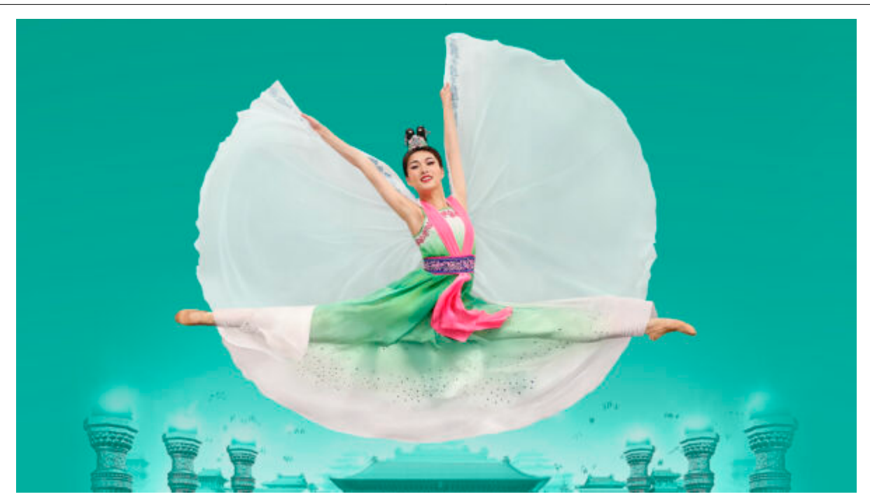
Shen Yun.