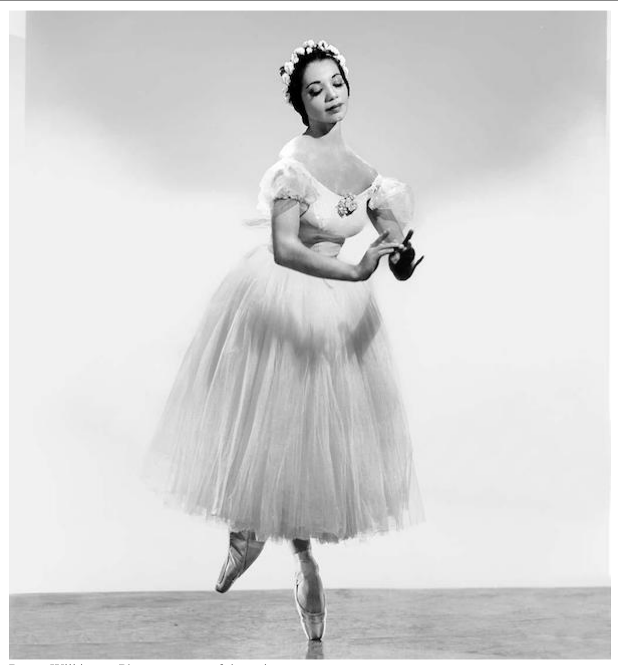
Raven Wilkinson.

The White Feather: A Persian Ballet Tale at Irvine Barclay Theater, 4242 Campus Dr., Irvine; Wed., March 22, 7 pm, $35-$135. Irvine Barclay Theater.