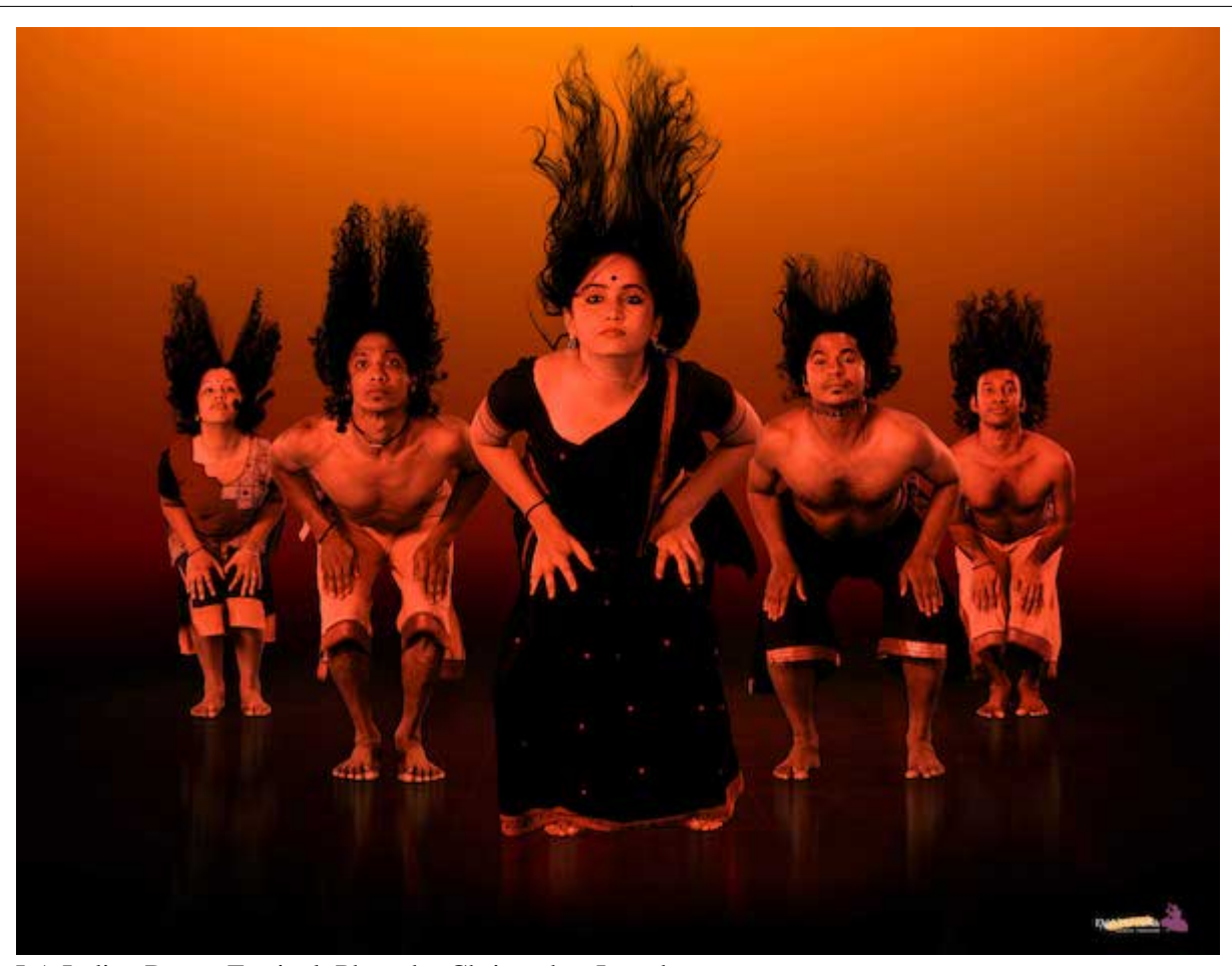
LA Indian Dance Festival.