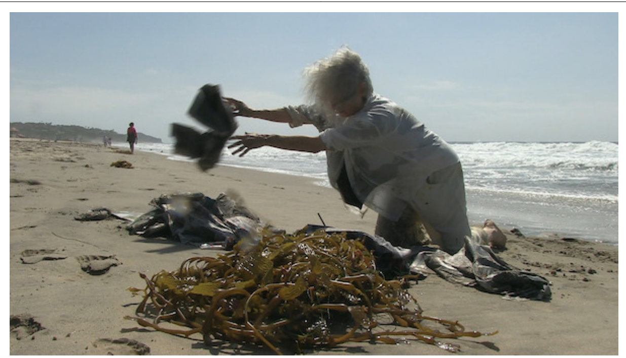
Simone Forti.