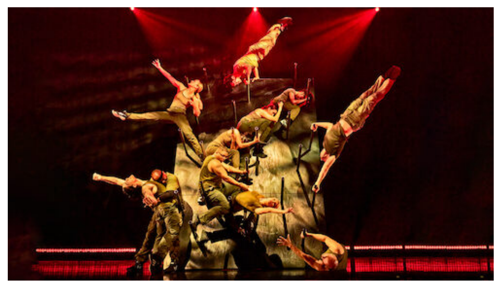
Diavolo Veterans Project.

Diavolo Architecture in Motion-Veterans Project in This is Me: Letters from the Front Lines . Streaming Sat., March 18, 5 pm, $20. Diavolo.