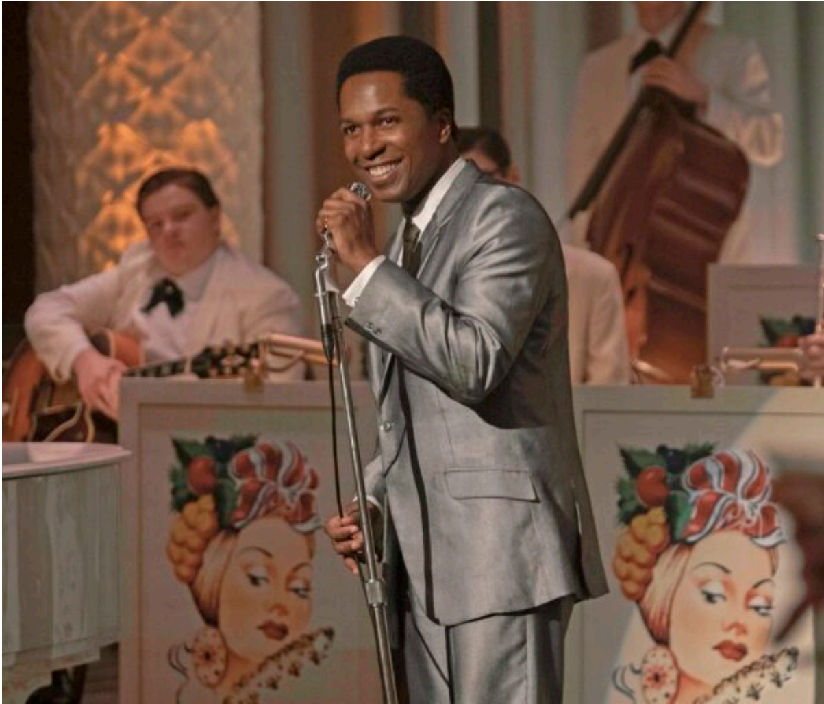
Leslie Odom Jr.-Sam Cooke

I had seen Leslie Odom Jr. in Harriet (2019) directed by Kasi Lemmons, in the film version of the stage musical Hamilton by Lin-Manuel Miranda, in the movie Music by Sia. I asked him about Samuel Cook, the singer who was killed on December 11, 1964