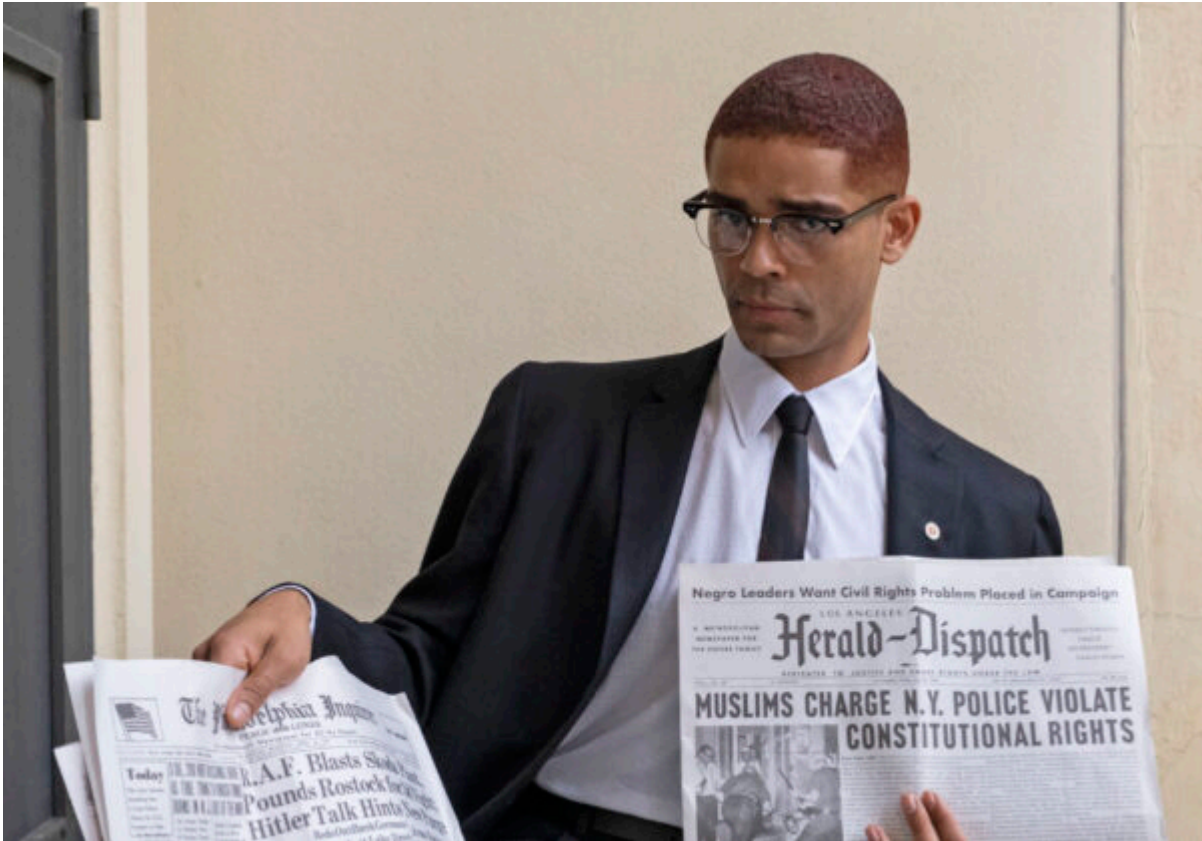
Kingsley Ben-Adir-Malcolm X

I had read The Autobiography of Malcolm X (1965) as a young leftist in Italy, then seen the 1992 movie directed by Spike Lee with Denzel Washington, that shows him shot to death on February 21, 1965. So I asked Kingsley Ben-Adir about Malcolm Little.