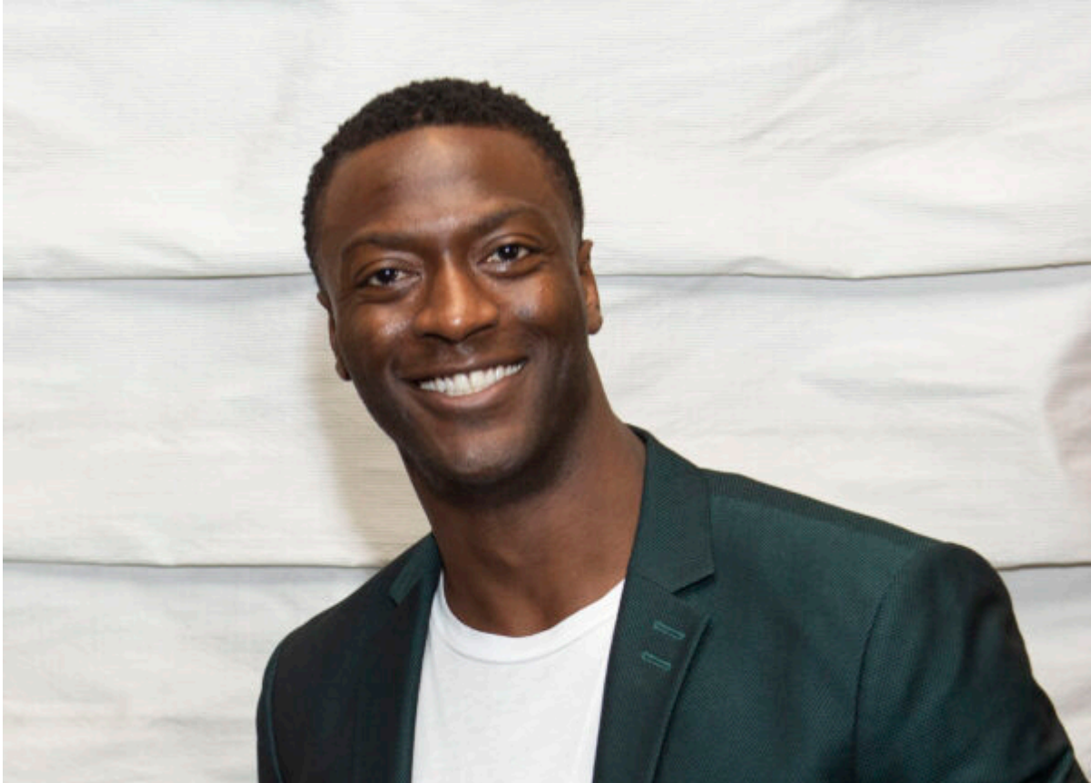
Aldis Hodge

I had seen Aldis Hodge in three performances in 2019, in the movies Brian Banks , where he portrayed the high school football player falsely accused of rape, Clemency , where he played a death-row prisoner claiming his innocence, and as a Boston District Attorney in the TV series City on the Hill with Kevin Bacon. This is what he said of the NFL football player James Brown who is still alive today at the age of 85.