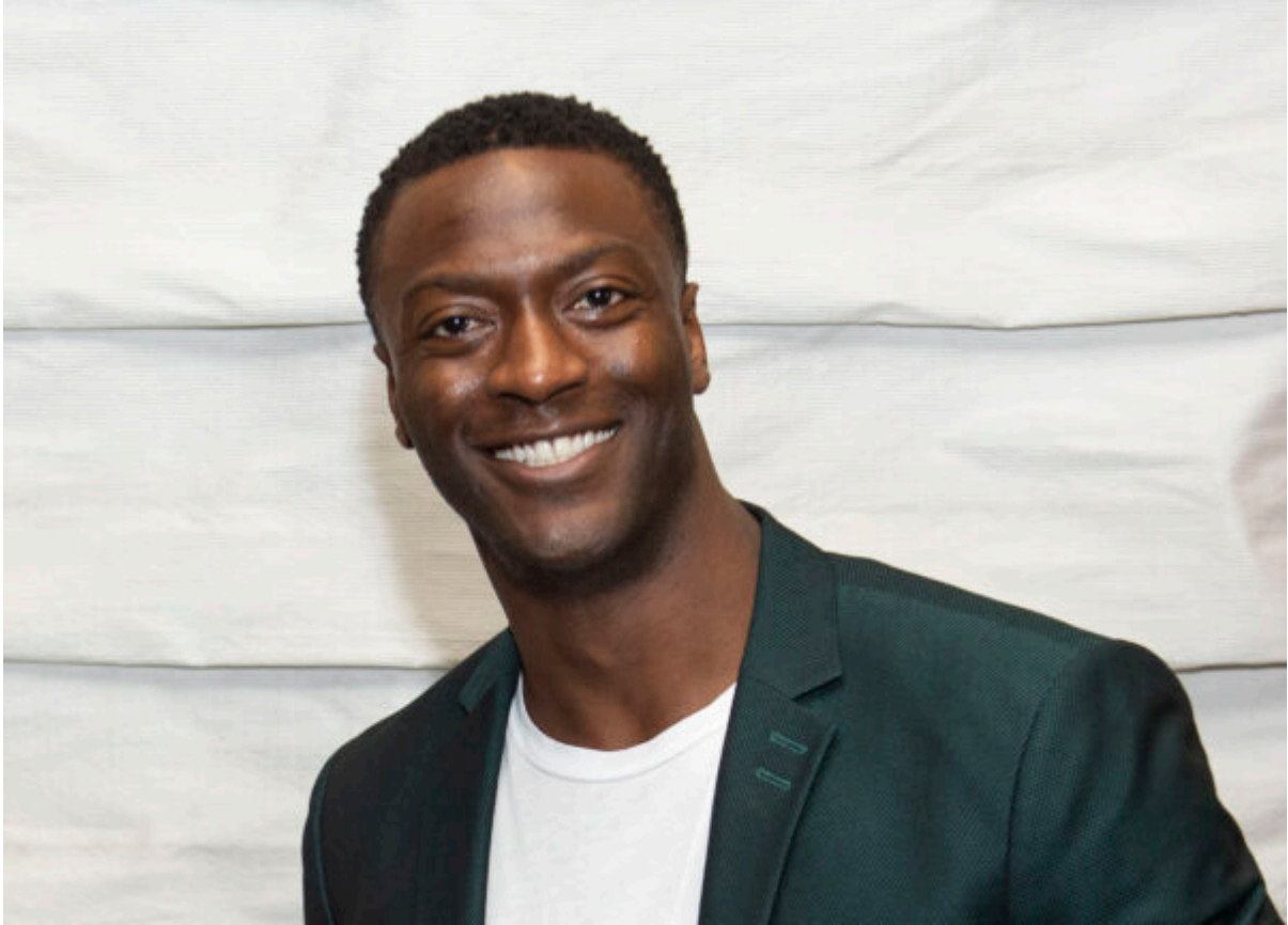
Aldis Hodge

I had seen Aldis Hodge in three performances in 2019, in the movies Brian Banks , where he portrayed the high school football player falsely accused of rape, Clemency , where he played a death-row prisoner claiming his innocence, and as a Boston District Attorney in the TV series City on the Hill with Kevin Bacon. This is what he said of the NFL football player James Brown who is still alive today at the age of 85.