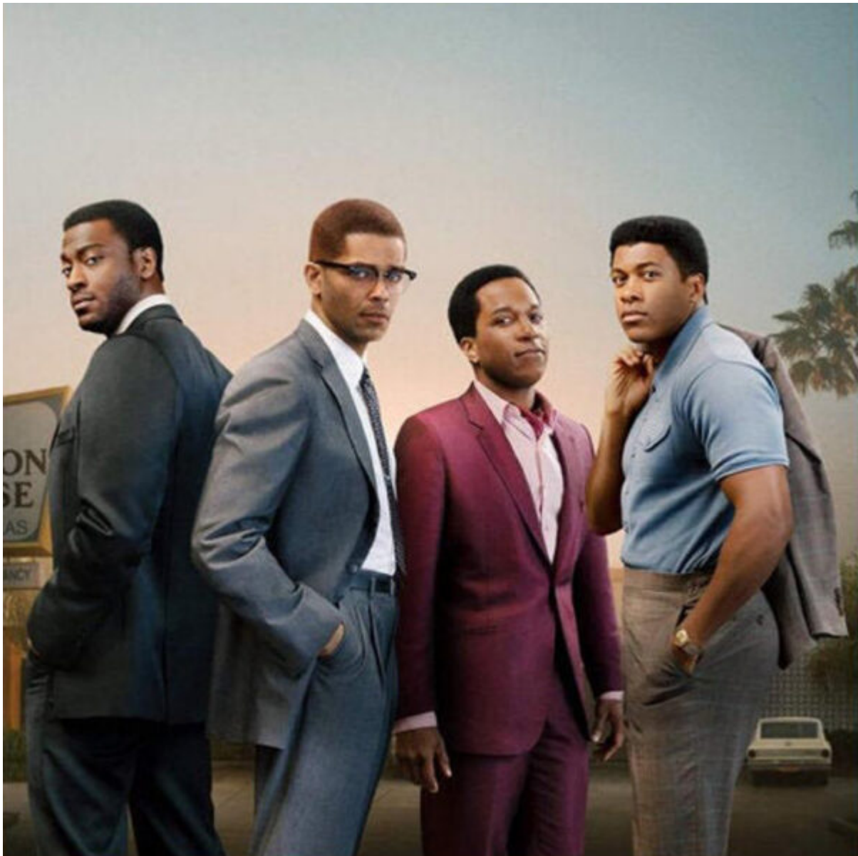
One Night in Miami