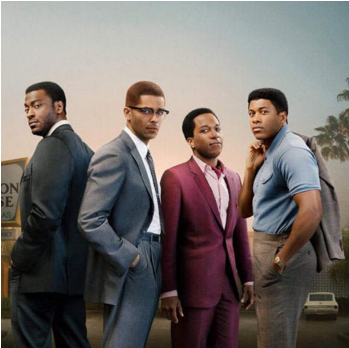
One Night in Miami