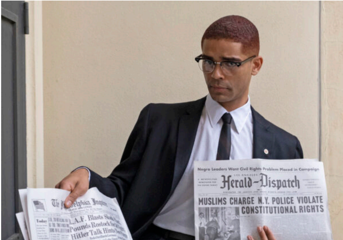
Kingsley Ben-Adir-Malcolm X

I had read The Autobiography of Malcolm X (1965) as a young leftist in Italy, then seen the 1992 movie directed by Spike Lee with Denzel Washington, that shows him shot to death on February 21, 1965. So I asked Kingsley Ben-Adir about Malcolm Little.