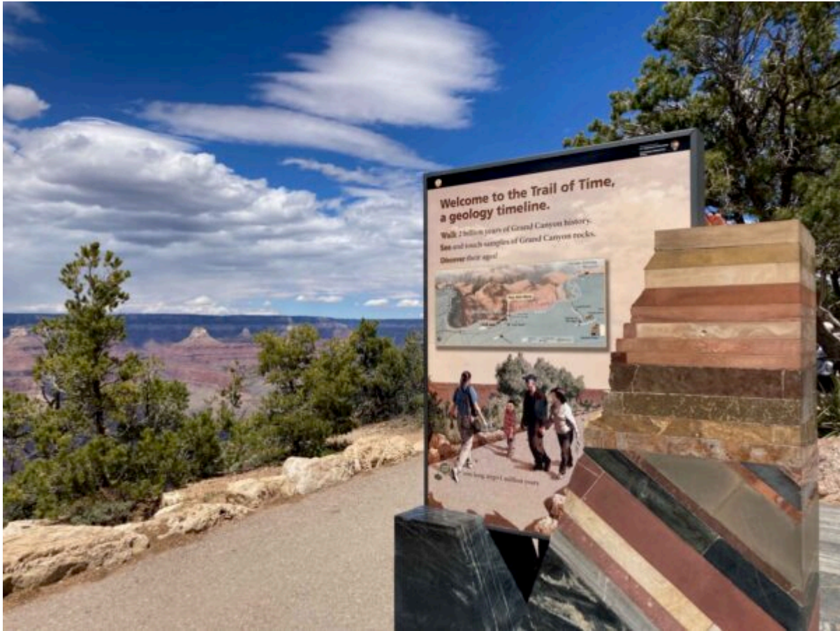
Grand Canyon. Trail of Time