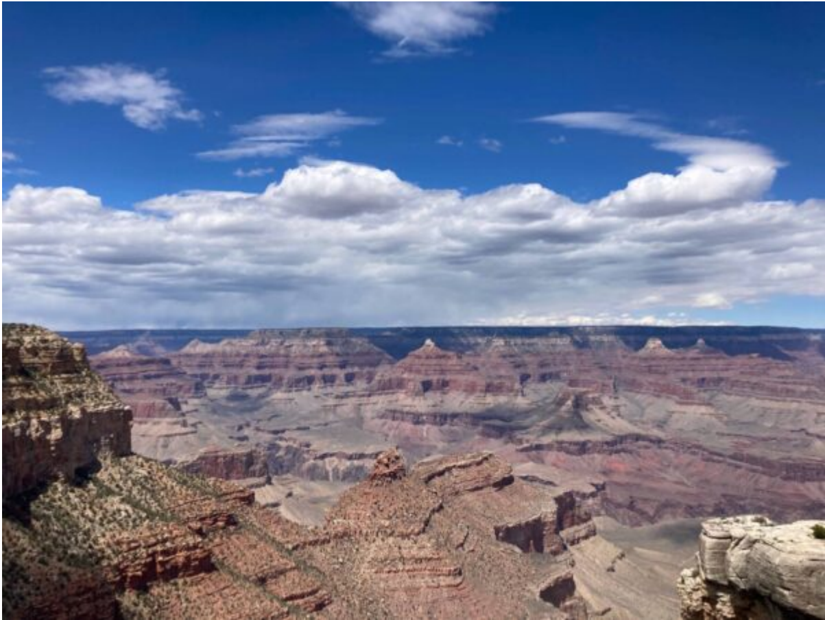
Grand Canyon South Rim

An incredible bonus added to my Road Scholar tour of Sedona was a day trip to the Grand Canyon on Thursday May 9. I had been there before, in April 1999, but it was a grey cloudy day followed by a snowfall, while this time it was sunny with blue skies and white puffy clouds, a delight to my photographer's heart.