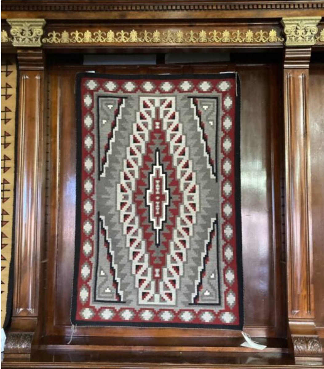
Navajo rug. Cameron Trading Post

The landscape of Sedona and the Grand Canyon reminded me of the red sandstone pillars of Monument Valley , that I first visited in 1975 while working on the set of an Italian western starring Terence Hill . I was there again in 1985 during a photography trip exploring the life of the legendary people that we Italians then called American Indians. Please read my article: Indigenous People in the US .