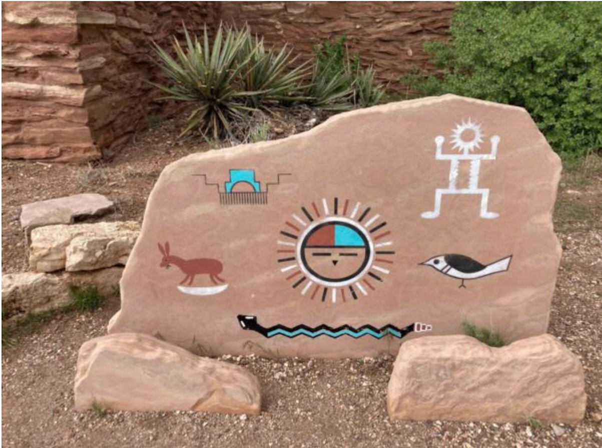
Hopi House. Grand Canyon