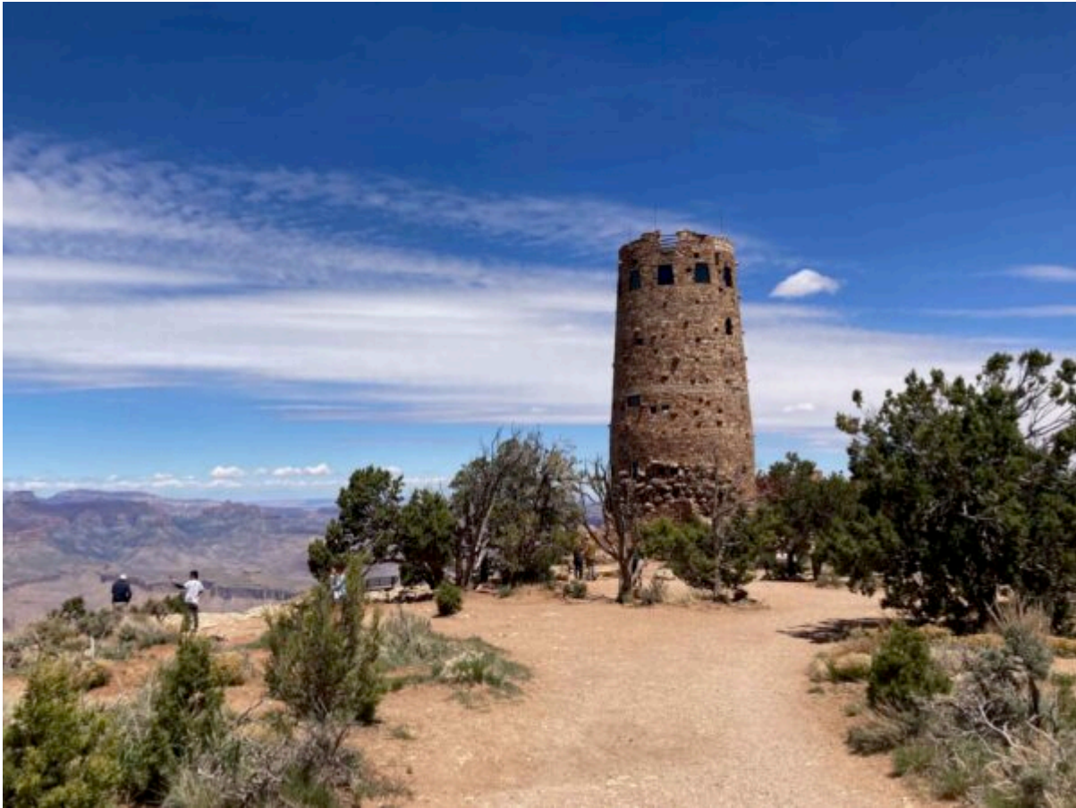
Grand Canyon. Desert View Watchtower

We first visited the East Entrance at Desert View with the watchtower built by architect Mary Colter in 1932. It was exciting for me to finally get a glimpse of the Colorado River way down at the bottom of the canyon and see its aqua green water. Colorado means red or rust-colored in Spanish, but that refers to the rock formations that the river cuts through.