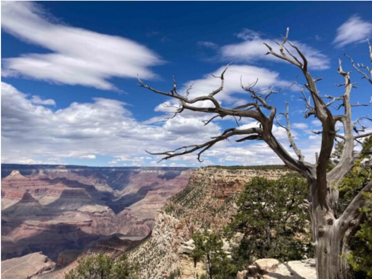
Grand Canyon South Rim

When I periodically sat down to rest and meditate during my walk, I realized that mankind may perish due to climate crisis, a viral pandemic, or a nuclear war, but the earth will survive.