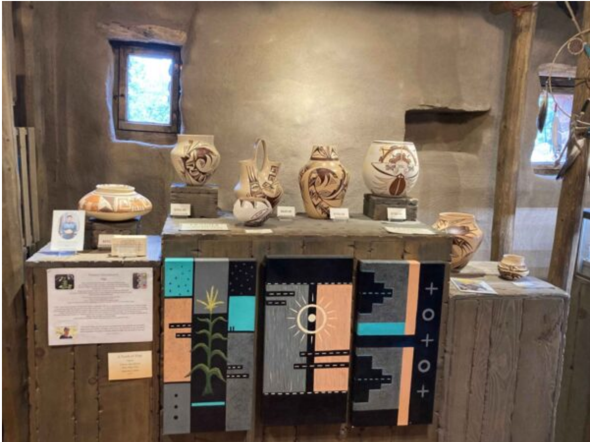
Hopi House. Pottery

Kindly read my article Sedona, Red Rock Country , and click on underlined words for links to background info.