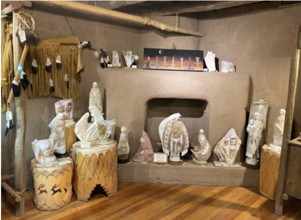
Hopi House. Alabaster statues.

I also studied the documentary Incident at Oglala (1992) directed by Michael Apted and narrated by Redford. Sadly Leonard Peltier was not granted parole on July 2, after spending nearly 50 years in prison, unjustly convicted in 1977 of murdering two FBI agents on the Pine Ridge Reservation. The only hope at this point is that President Joe Biden will grant him clemency