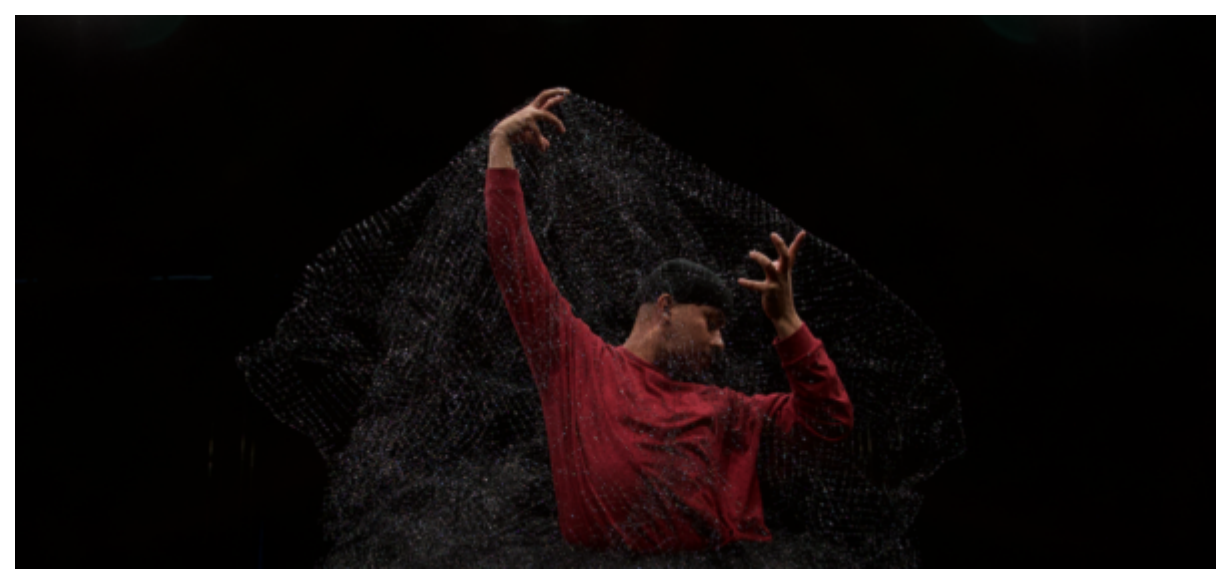
CSULB's "We Made This For Us."