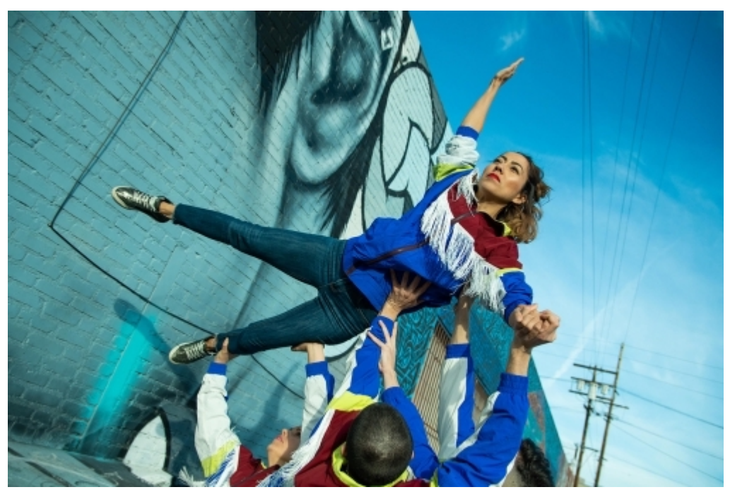
Primera Generación Dance.

Two dance companies share the virtual stage as part of this week's Grand Paark's Our L.A. Voices . The Chinese Dance Company of Southern California (CDCSC) tells classic Chinese stories through dance, while the quartet who comprise Primera Generación Dance focus on the Mexican American and LatinX experience. Thurs., Apr. 29, 6 p.m. PDT, free at Grand Park.