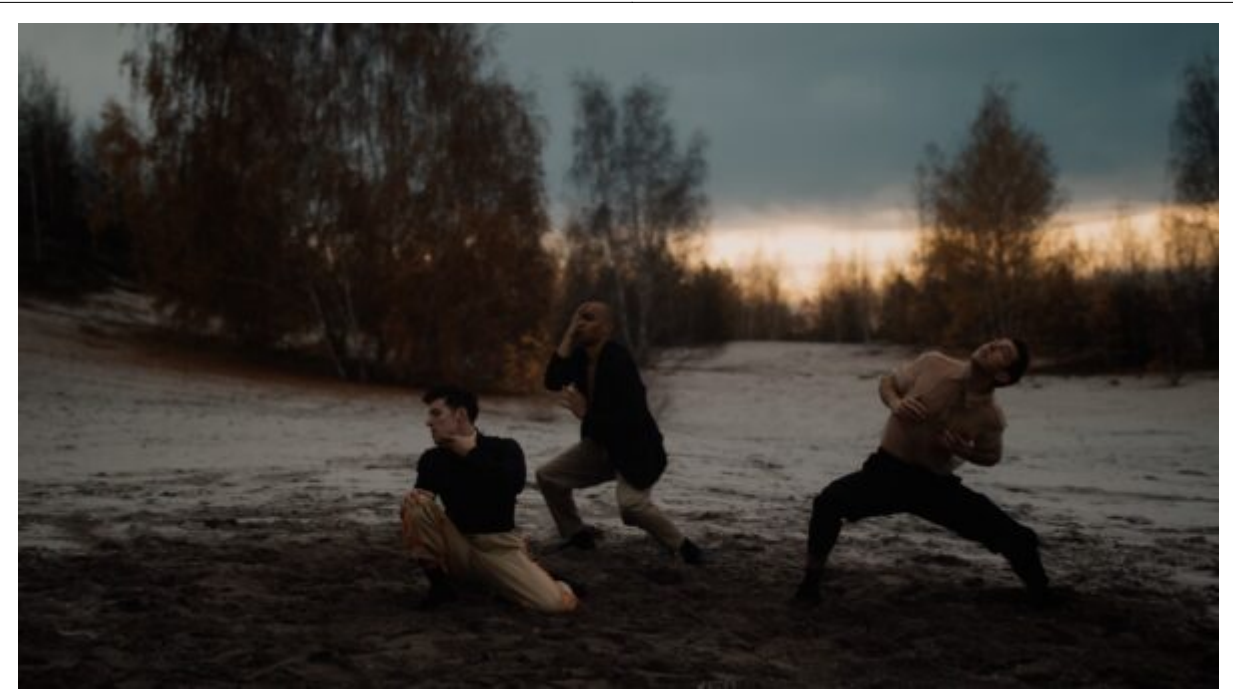
Films.Dance "Torn."