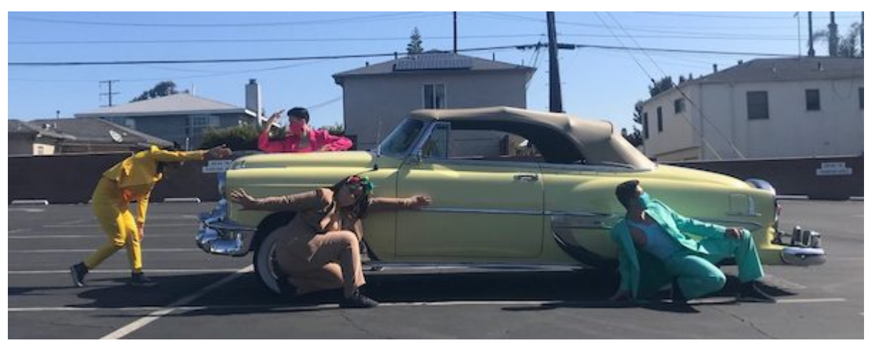
Suárez Dance Theater.