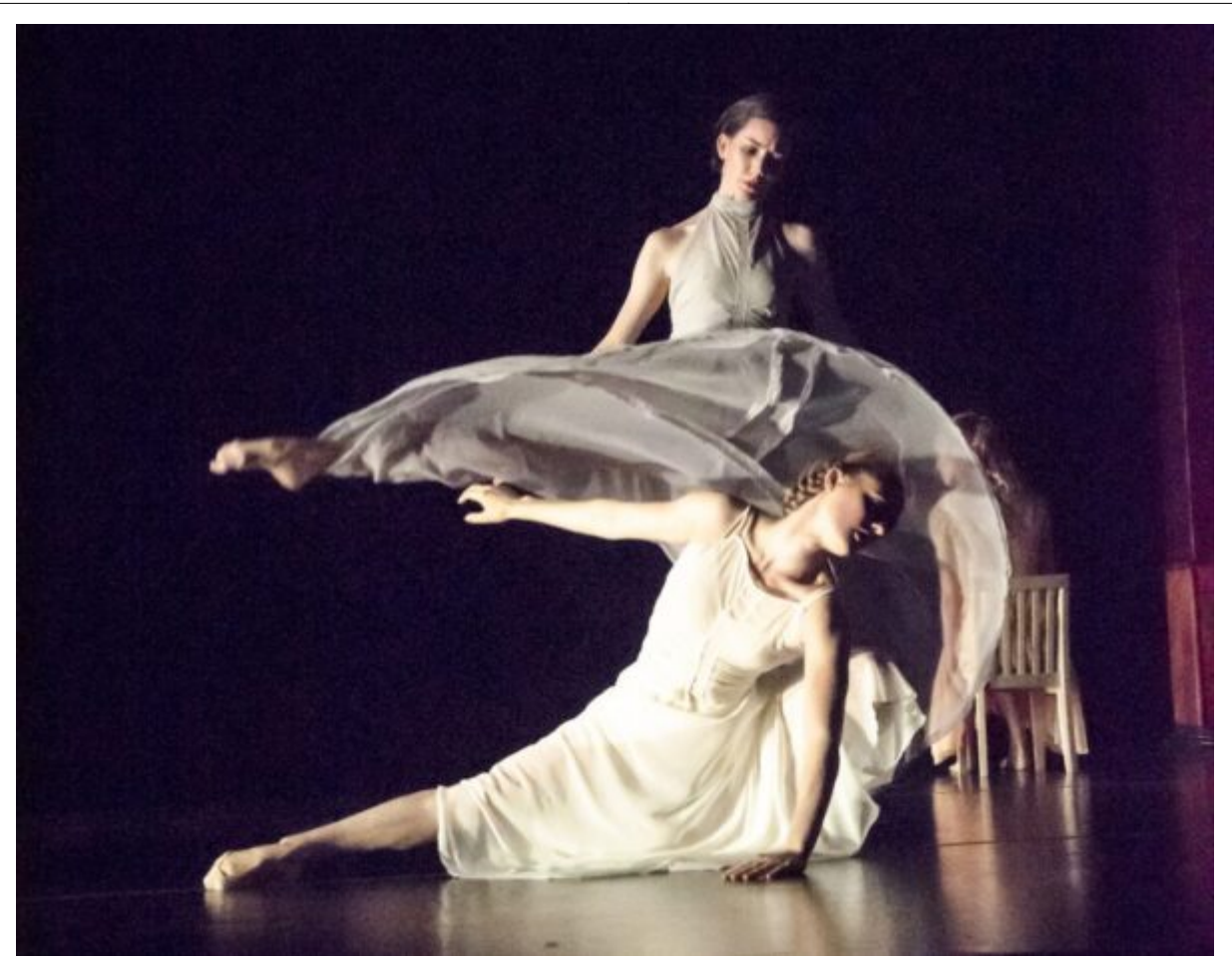
Nancy Evans Dance Theater.