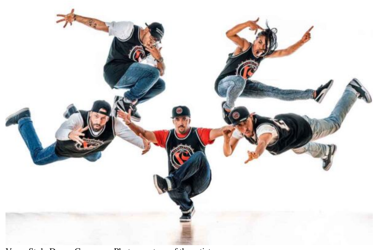
Versa Style Dance Company.

For more than a decade, the street dance ensemble Versa Style Dance Company has been both a thrilling performance presence and a valued community asset through educational performances and social justice programs. This edition of the Brand Library Dance Series 2021 finds the troupe streaming from this elegant setting in the Glendale foothills. The venue isn't yet open to in person audiences, but this online presentation shows what happens when these high energy dancers take their dance from the street to a library and art gallery. Streaming on Sat.-Sun., June 19–20, 11 a.m., free. Brand Library.