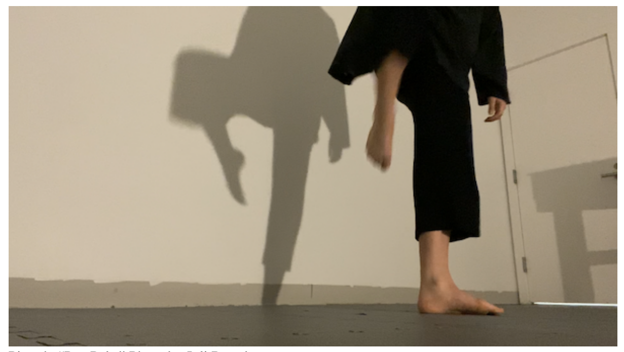
Pieter's "Pen Pals."

Hosted by Julie Brandano and Pieter, Scored Pen Pals paired volunteer participants with a "pen pal" from a different place to exchange "scores" that could include instructions, drawings, and descriptions to fuel this performance event and subsequent publication of the "scores." After a short prep time, the participants perform the result on view, online on Sun., June 20, 5 p.m., free (donations suggested $5 to $20 to support participants). Pieter Performance Space.