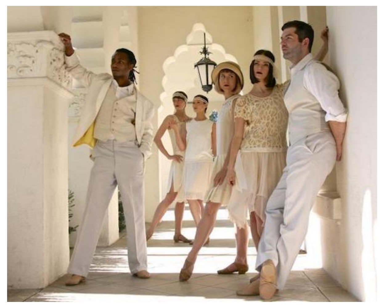
Mixed eMotion Theatrix.