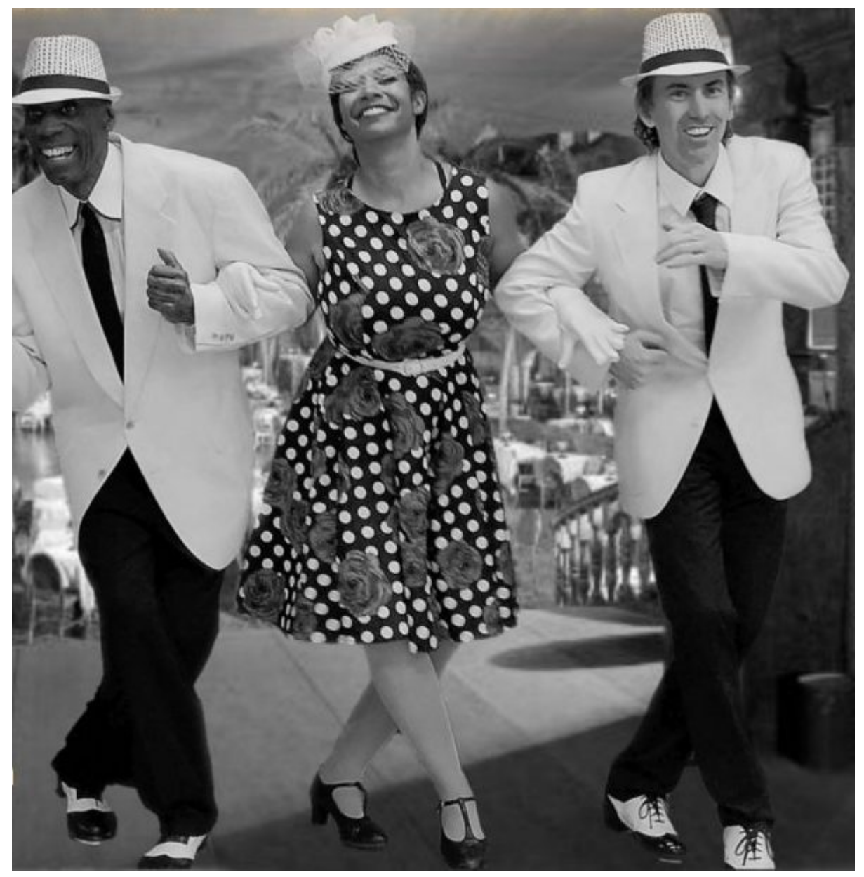
Central Avenue Dance Ensemble.