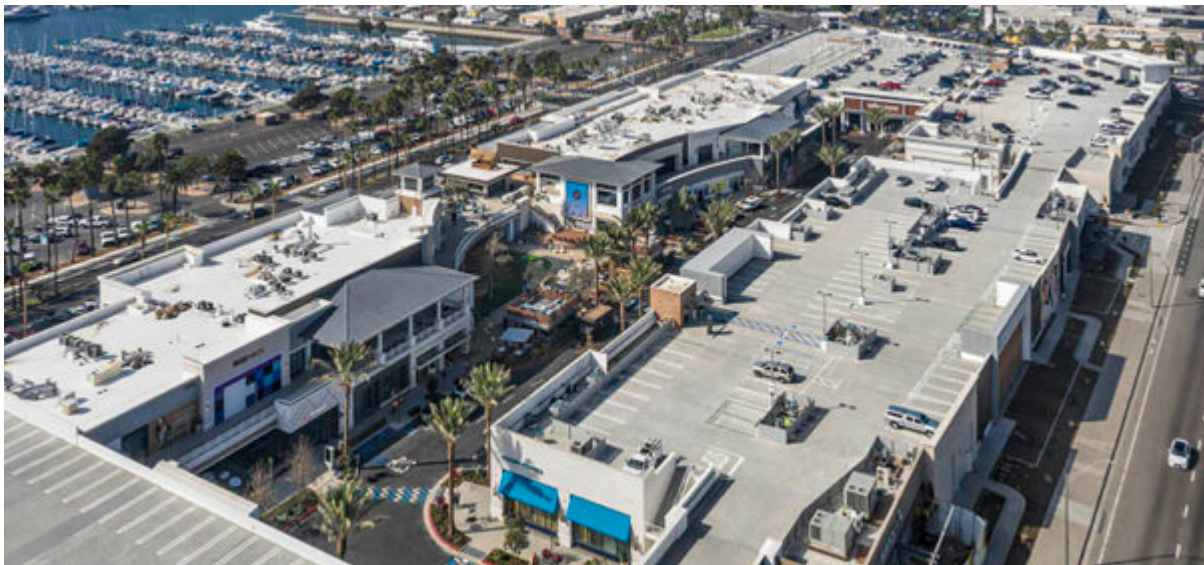
2ND & PCH Shopping Mall, Long Beach