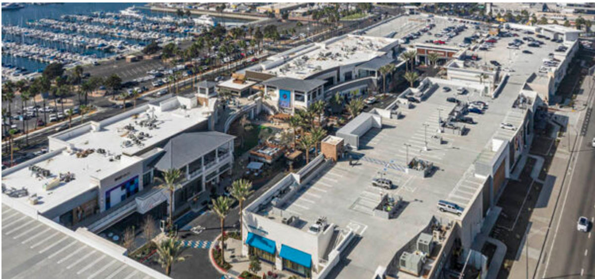
2ND & PCH Shopping Mall, Long Beach