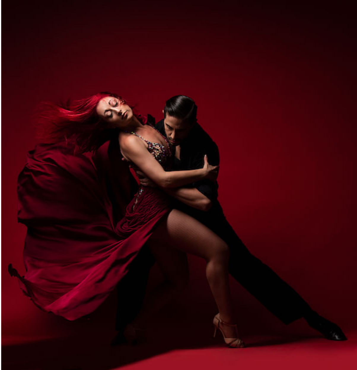
Tango Argentina.

One of the most professional of the touring tango shows, Tango Argentina , stops off for two shows at Segerstrom Concert Hall, Segerstrom Center for the Arts, 600 Town Center Dr., Costa Mesa, Sun., Jan. 16, 2 & 7 pm, $19-$79. Details, tickets & Covid protocols at SCFTA .