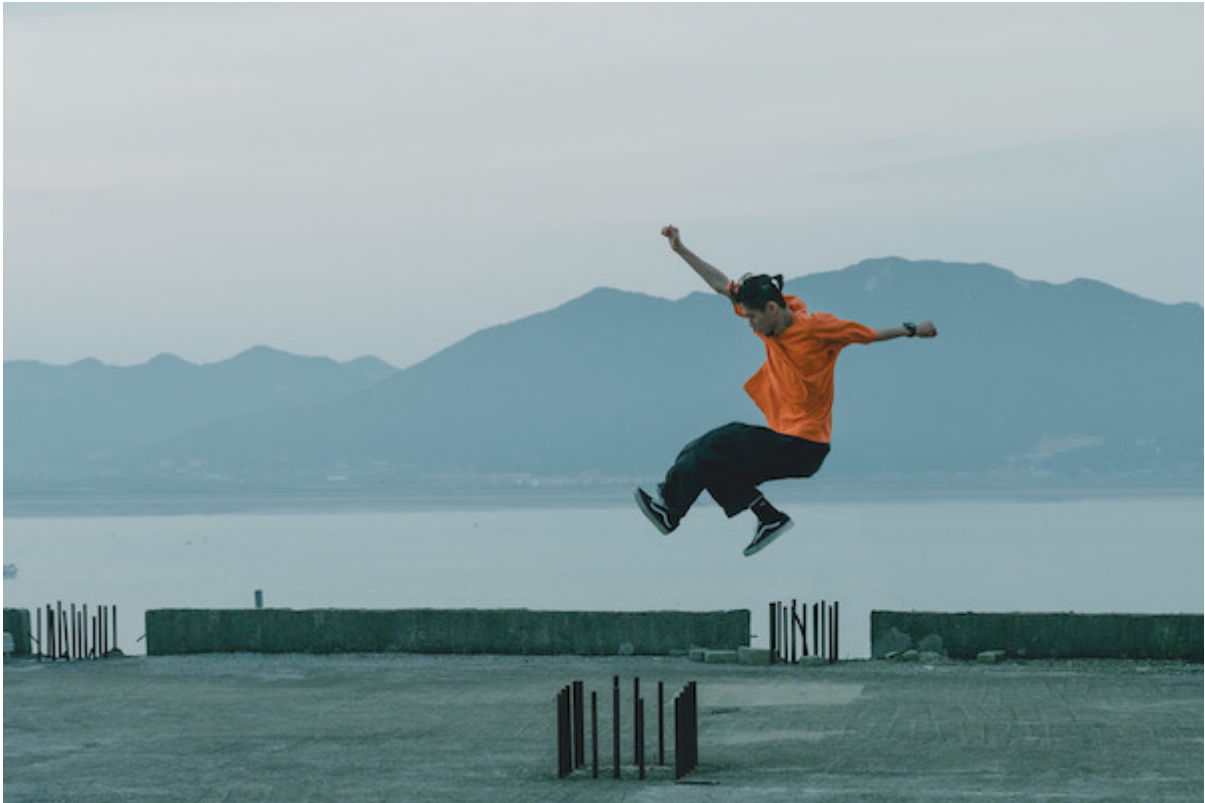
Dance Camera West.

This entry was posted on Sunday, January 9th, 2022 at 7:03 am and is filed under Film , Music , Dance . You can follow any responses to this entry through the Comments (RSS) feed. You can leave a response, or trackback from your own site.