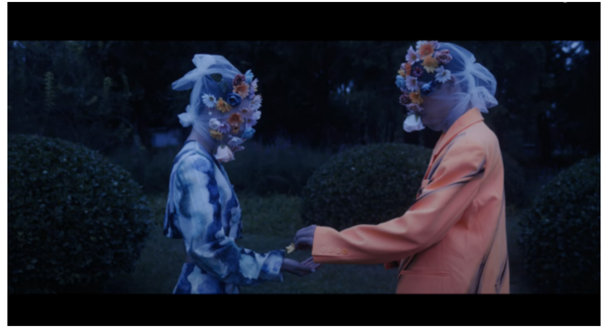
Dare to Dance in Public Film Festival (D2D).