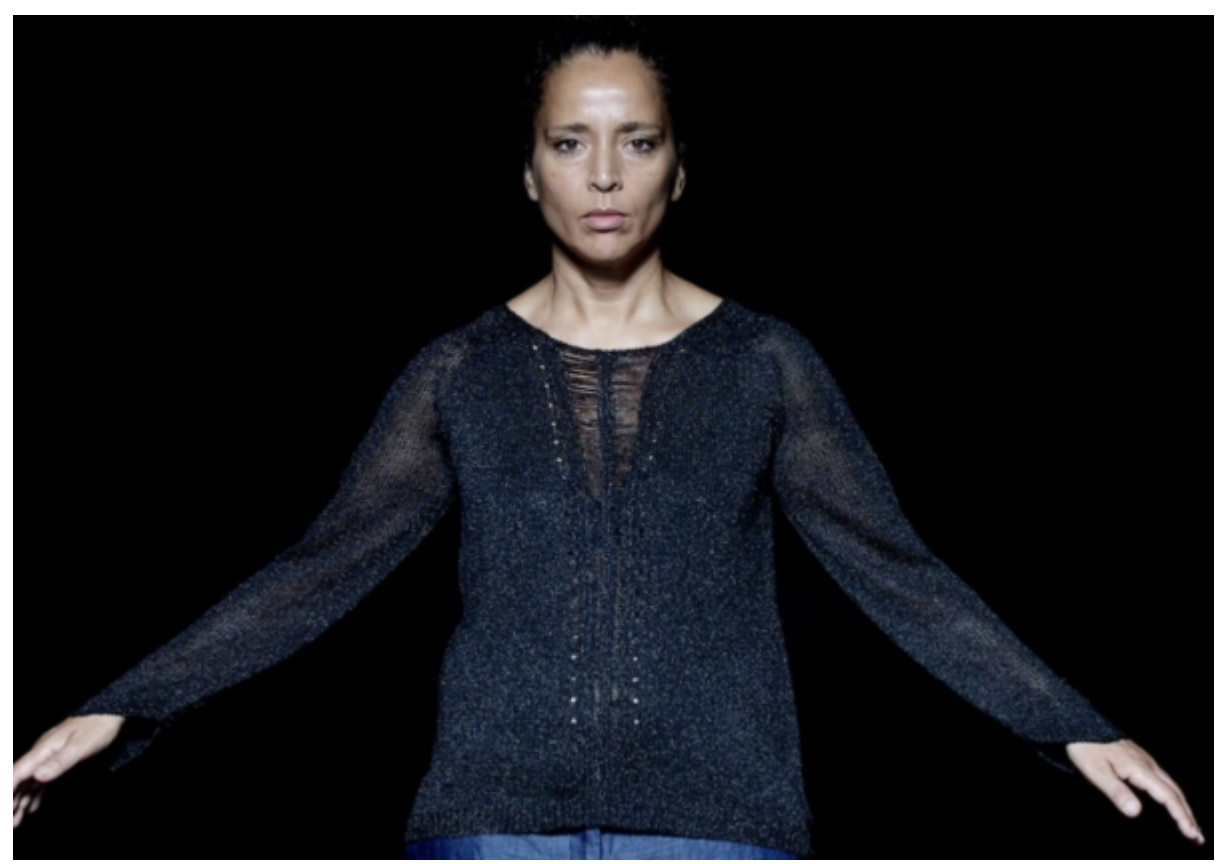
Nacera Belaza. Photo by Isabelle Levy-Lehman

Drawing on ritual Algerian dance, in L'Onde (The Wave) the French Algerian choreographer Nacera Belaza brings a quartet of dancers who blend traditional and modern minimalist movement. The Saturday show includes a post-performance conversation Belaza. REDCAT, Disney Hall, 631 W. 2nd St., downtown; Thurs.–Sat., Oct. 19–21, 8:30 pm, $30. REDCAT.