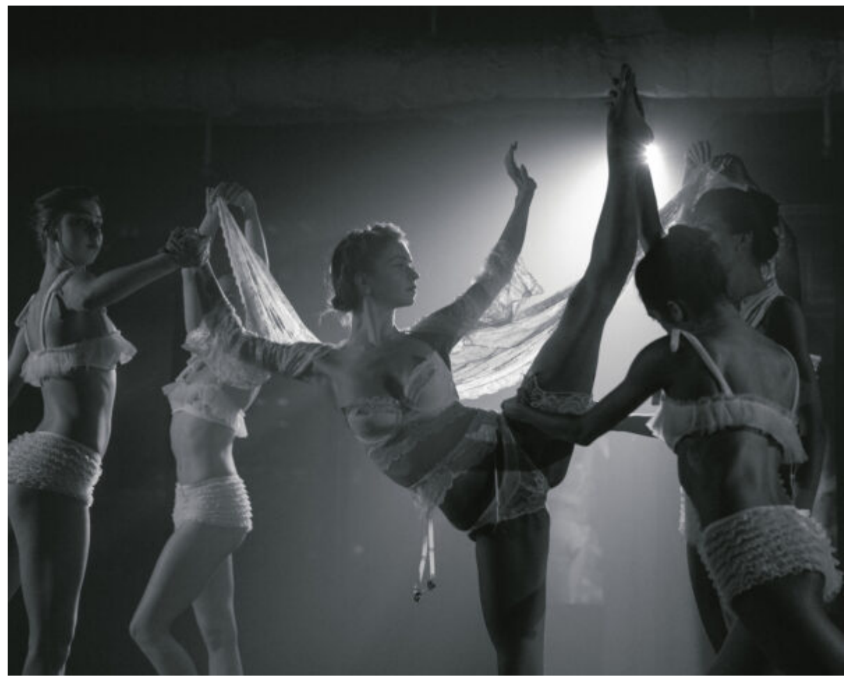
American Contemporary Ballet.