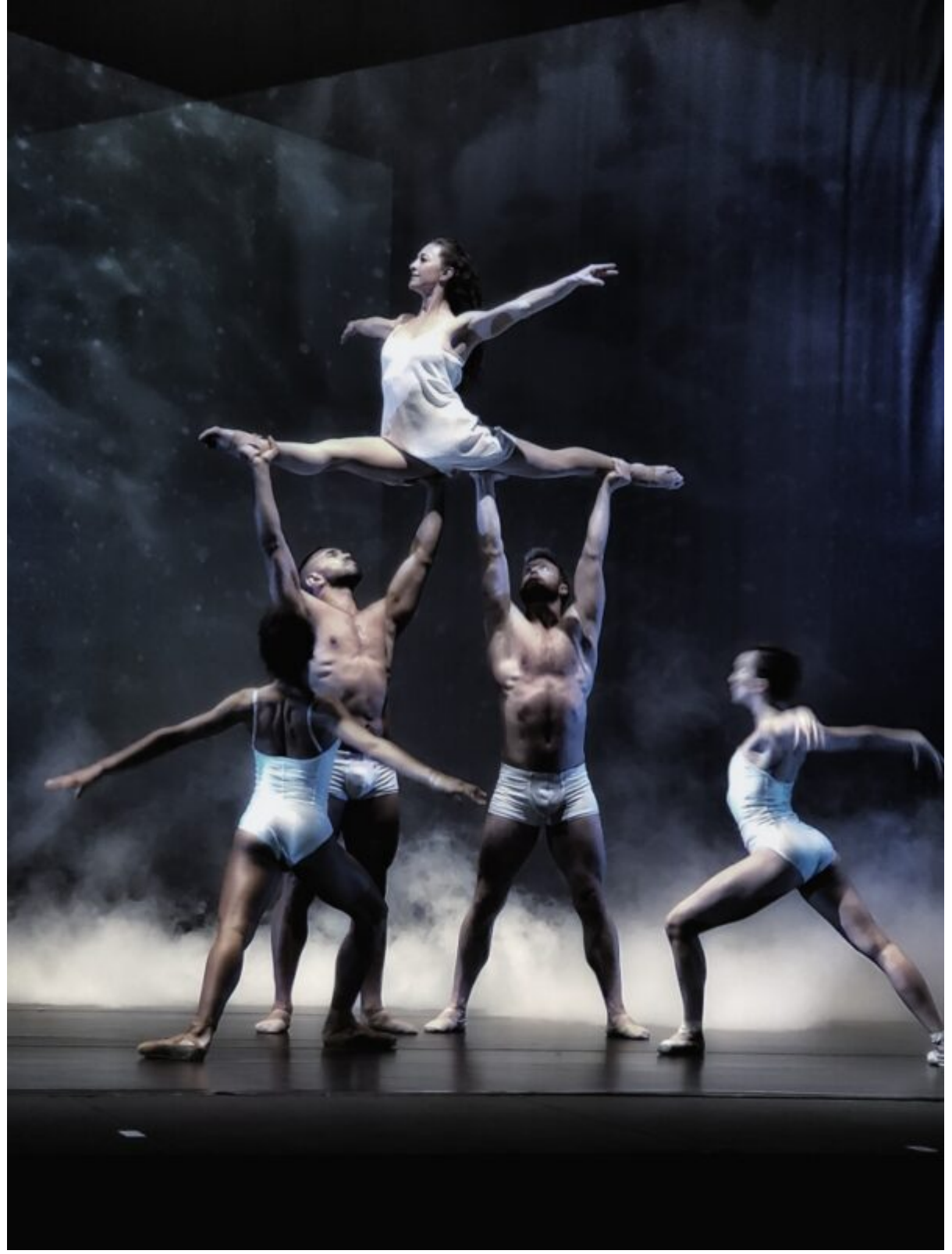
Luminario Ballet.

aerial dance in Zarathustra! The evening includes Grammy winning singer Thelma Houston on stage in a work choreographed by Bianca Sapetto. Violinist Jesus Florido. Avalon Hollywood, 1735 N. Vine St., Hollywood; Sun., Oct. 22, 8 pm performance, $35–$125, 5:30 pm gala reception $350-$550. Luminario Ballet.