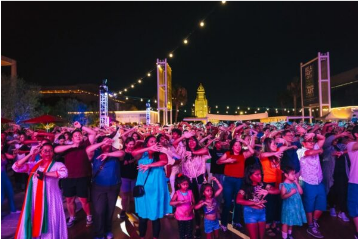
Dance DTLA.