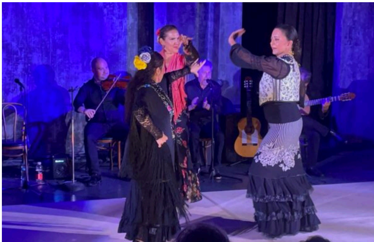
Forever Flamenco.