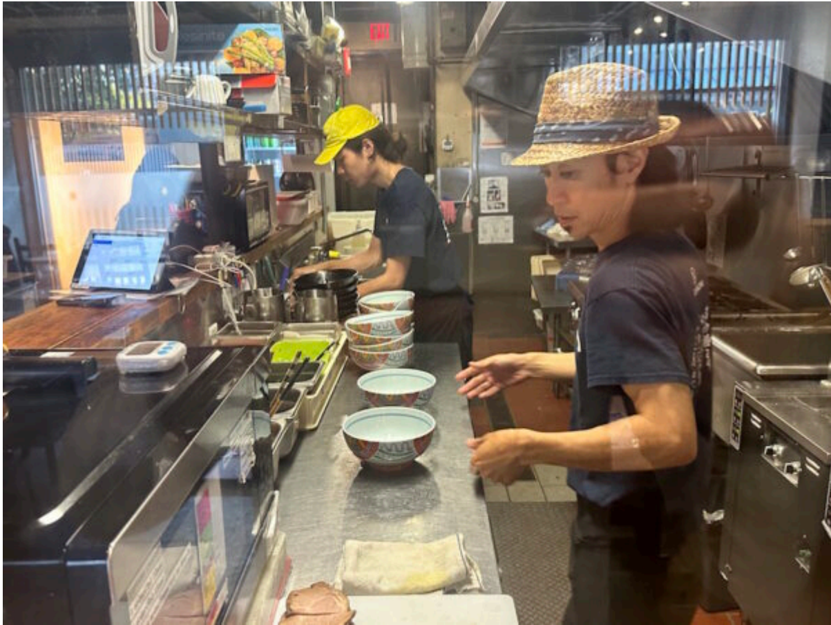
The kitchen at Maruhachi Ra-men

Tan-men was our vegetable choice: Taiwanese and Chinese cabbage, bean sprouts, spinach, carrots, sugar snap peas, green onion, and wood ear mushrooms. It existed, wonderfully, in a creamy chicken broth.