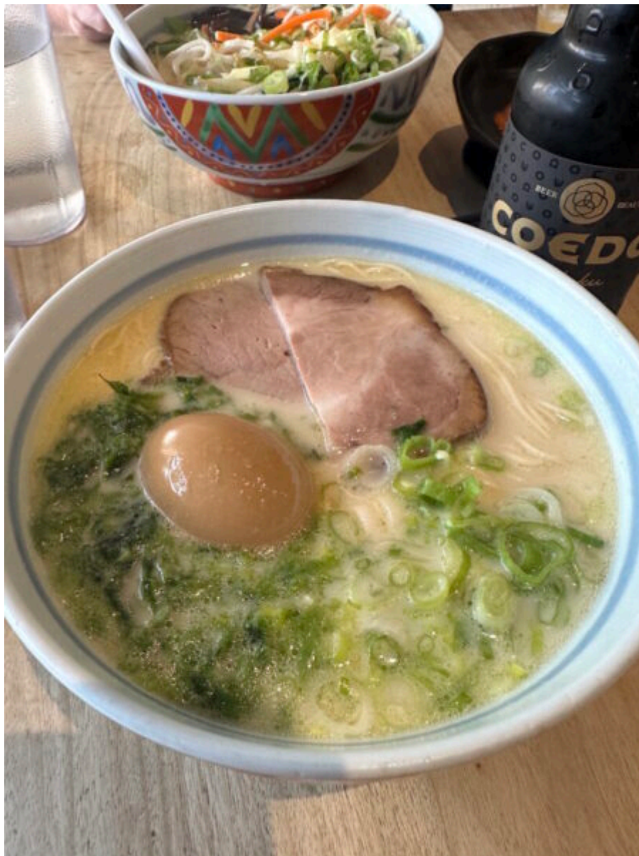
The cafe's specialty: tori-paitan

The shop has a crisp no-nonsense aesthetic, done in grays with wood tables set with short black stools. A beige abstract painting covers one wall. Outside, the door is framed in warm wood, the sign done in Japanese characters. Wood slats surround a large window. Without glancing down the street, you could be in Tokyo.