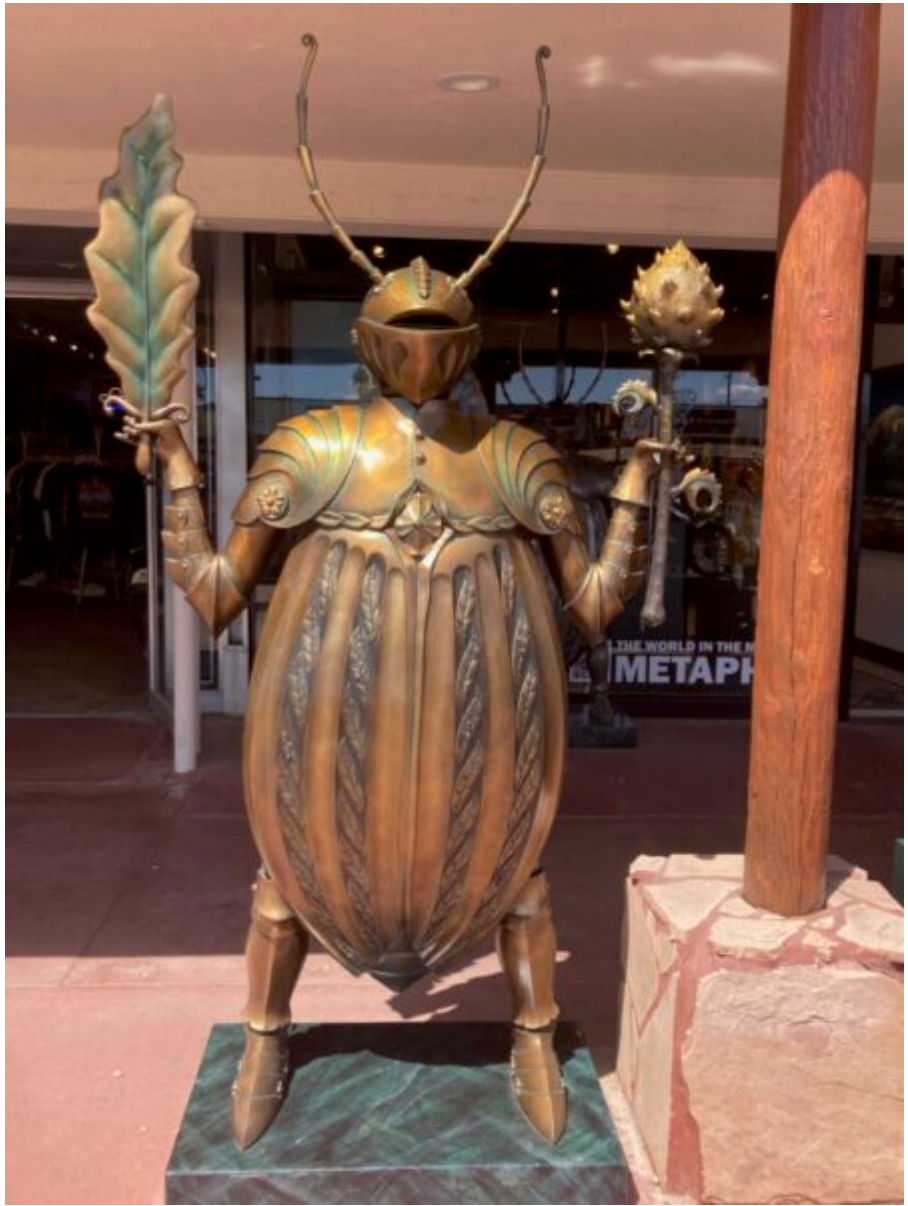
Knight Beetle by Vladimir Kush

In Old Town Scottsdale we noticed the impressive bronze sculptures by Vladimir Kush.