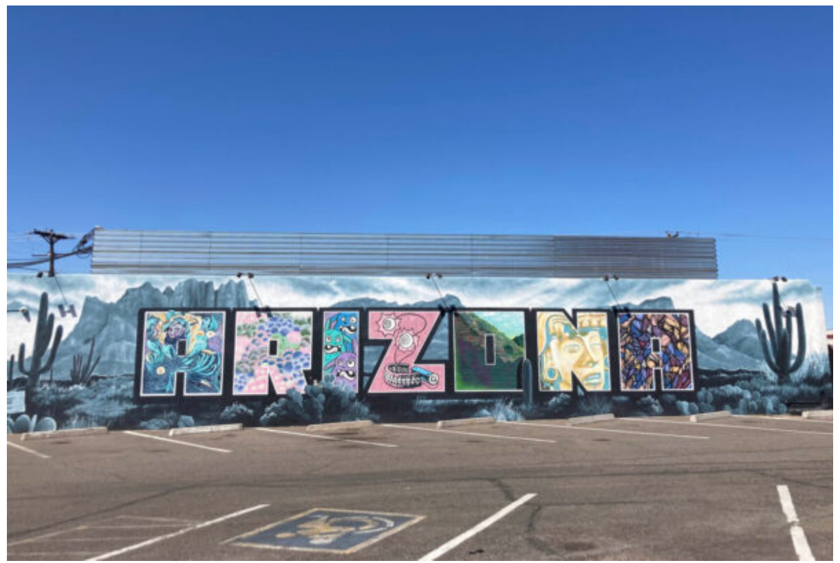
Arizona mural. Rebel Lounge

As lifetime foodies we sampled some of the local restaurants. I cannot fail to mention Los Sombreros, and its outstanding Oaxacan dishes. It felt like being back in that Mexican city. Read article I wrote about my last visit to Oaxaca for the film festival.