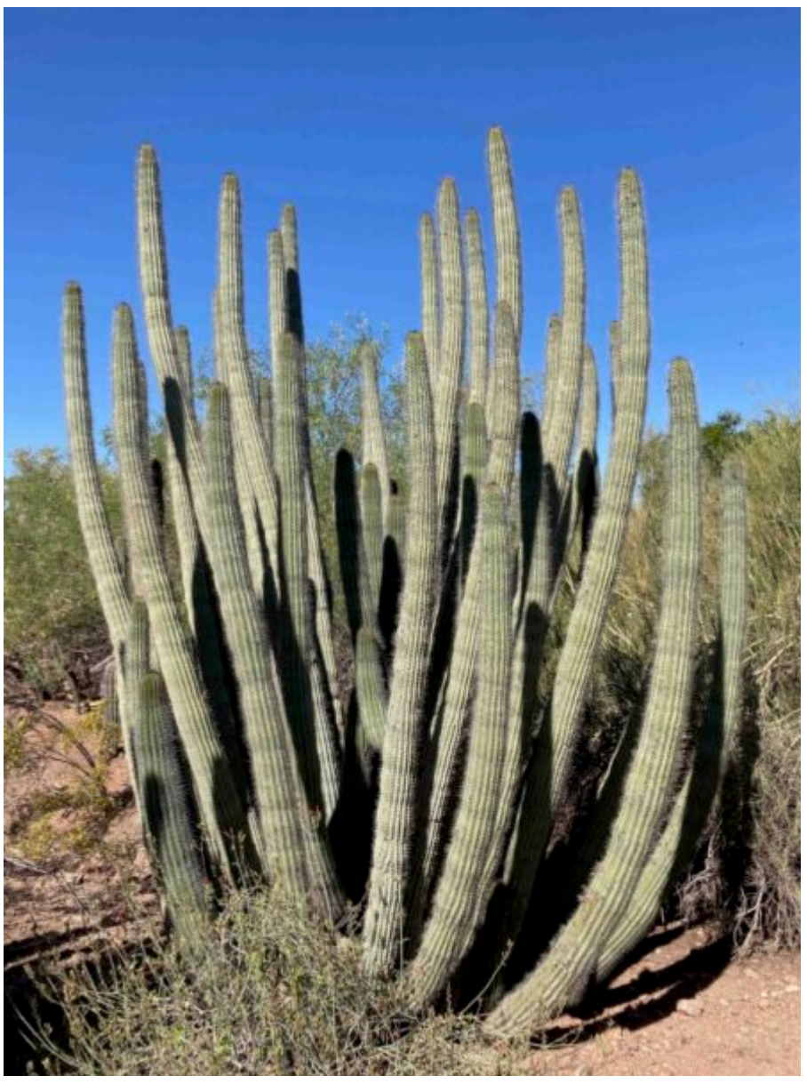
Organ Pipe cactus

I discovered the Toothpick cactus that I had not seen before, in my previous travels to Baja California, Joshua Tree and Tucson.