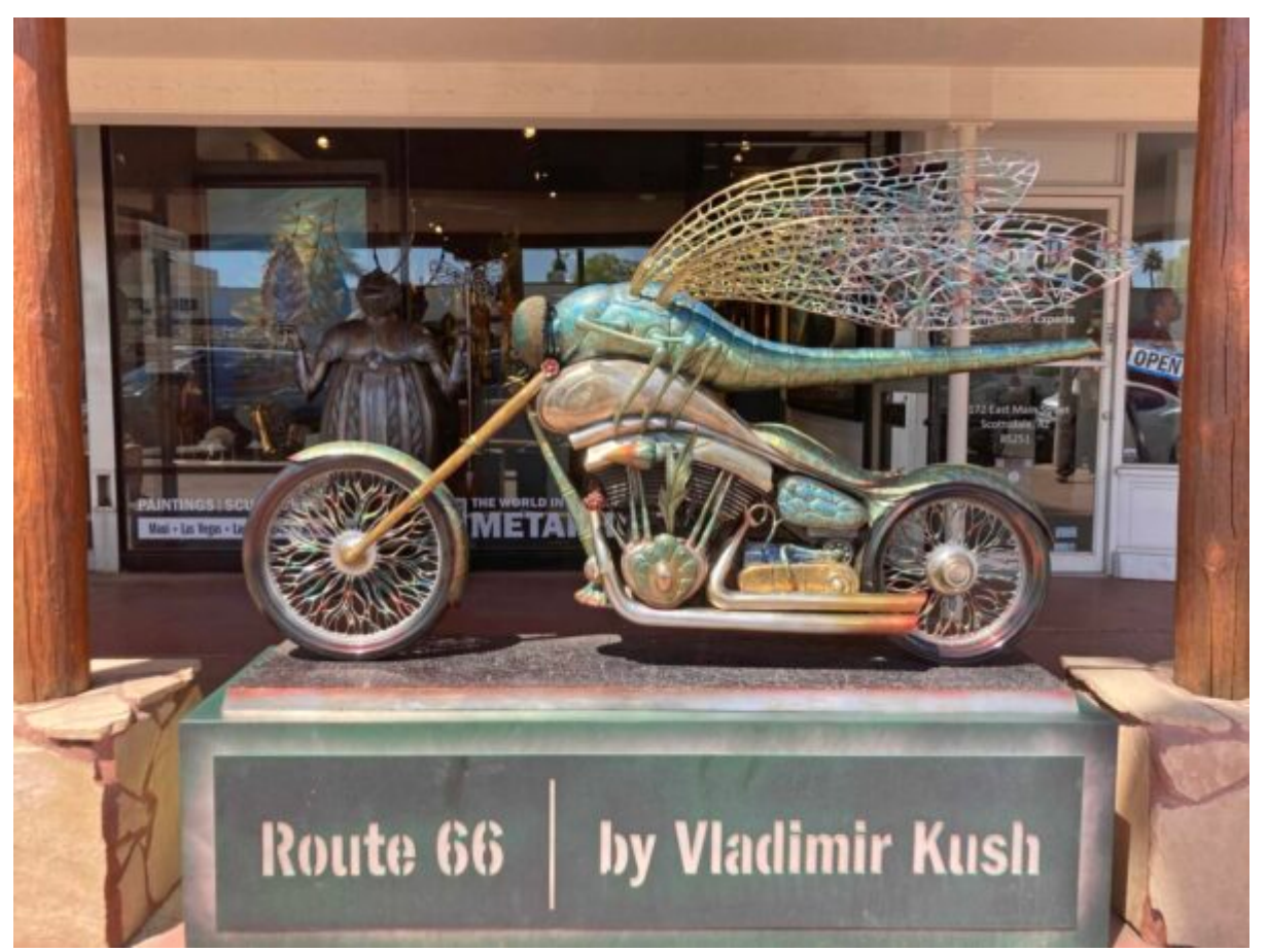
Route 66 by Vladimir Kush

As lifetime foodies we sampled some of the local restaurants. I cannot fail to mention Los Sombreros, and its outstanding Oaxacan dishes. It felt like being back in that Mexican city. Read article I wrote about my last visit to Oaxaca for the film festival.