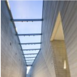
Lascaux IV / Snøhetta + Duncan Lewis Scape Architecture.