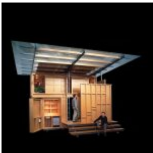
La Petite Maison do Weekend. Patkau Architects.