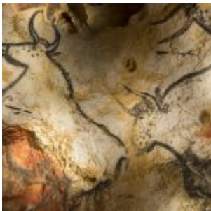
Caves of Lascaux, France. 20,000 BCE.