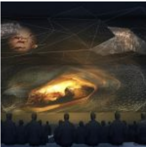
Lascaux IV / Snøhetta + Duncan Lewis Scape Architecture.