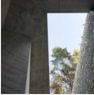
Lascaux IV / Snøhetta + Duncan Lewis Scape Architecture.