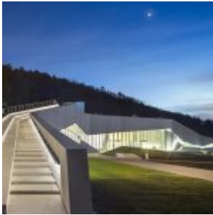
Lascaux IV / Snøhetta + Duncan Lewis Scape Architecture.