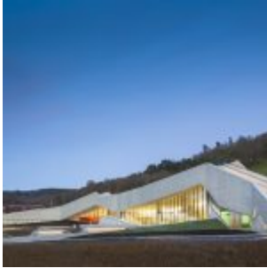
Lascaux IV / Snøhetta + Duncan Lewis Scape Architecture.