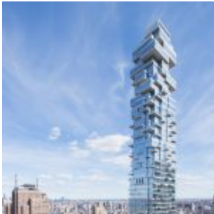
Location 56 Leonard St, New York, NY. Architect: Herzog & de Meuron.