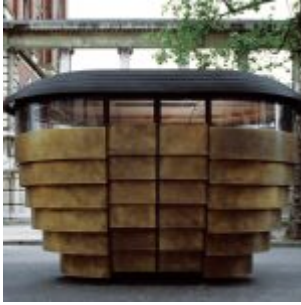
Paperhouse, London, UK. Design: Thomas Heatherwick.