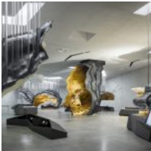
Lascaux IV / Snøhetta + Duncan Lewis Scape Architecture.