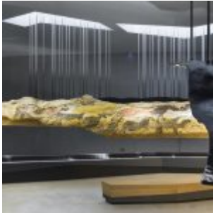
Lascaux IV / Snøhetta + Duncan Lewis Scape Architecture.