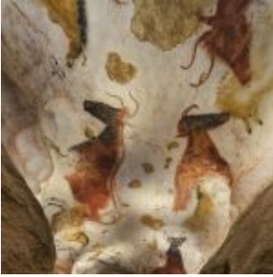
Caves of Lascaux, France. 20,000 BCE.