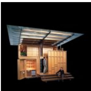
La Petite Maison do Weekend. Patkau Architects.