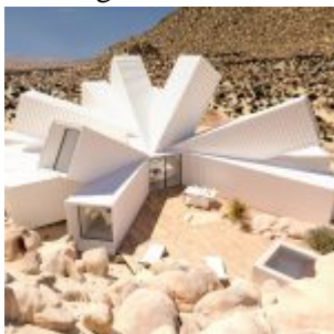
Vacation Home, Joshua Tree. Design: Whitaker Studio.