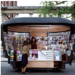
Paperhouse, London, UK. Design: Thomas Heatherwick.