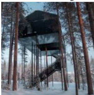
Floating Cabin, Sweden. Architect: Snøhetta.