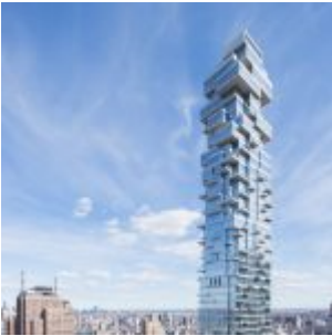
Location 56 Leonard St, New York, NY. Architect: Herzog & de Meuron.