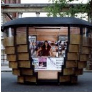
Paperhouse, London, UK. Design: Thomas Heatherwick.