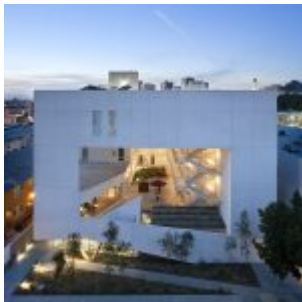
Affordable Housing: The Six, Los Angeles. Brooks + Scarpa Architects

The only organic example shown here is the project by Snøhetta , an international architecture, landscape architecture, interior design and brand design office based in Oslo, Norway and New York City with studios in San Francisco, Innsbruck, Singapore and Stockholm. A major new building has opened in the south of France, framing a huge replica of one of the world's most important examples of prehistoric cave art. Called Lascaux IV, the new visitor complex recreates the appearance and atmosphere of the caves in Montignac where the 20,000-year-old Lascaux paintings are located, but which have been closed to the public for over 50 years.