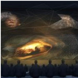
Lascaux IV / Snøhetta + Duncan Lewis Scape Architecture.