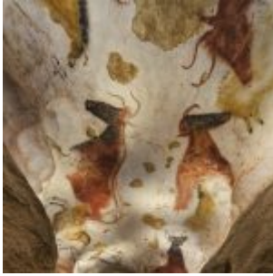
Caves of Lascaux, France. 20,000 BCE.