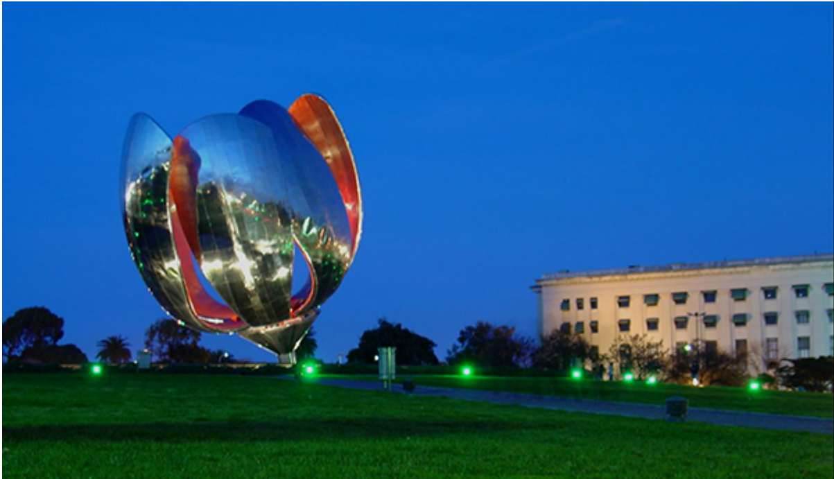
Floralis Generica at Night