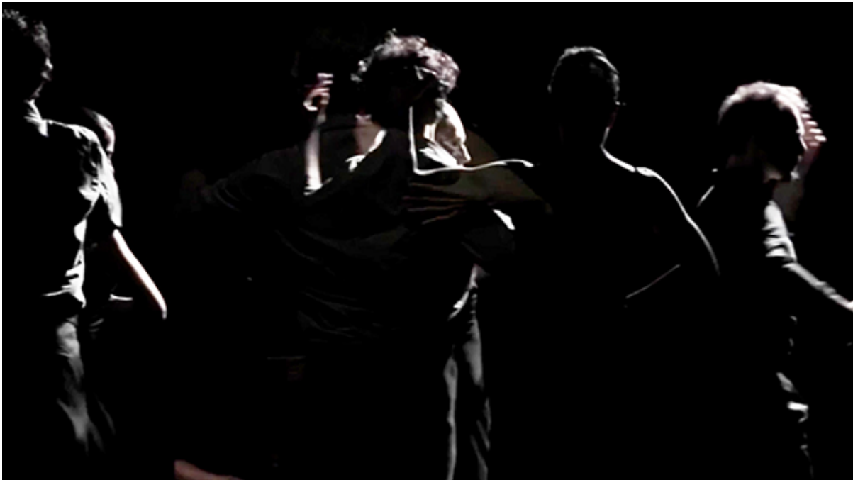
Piazzolla Tango Dancing

As a young bandoneonist, Piazzolla started playing traditional tango in the orchestra of Anibal Troilo, a composer, arranger, and bandleader. However, studying with Ginastera, he abandoned the bandoneon and decided to become a symphonic composer. He returned to the tango as a source of inspiration following Nadia Boulanger's advice.