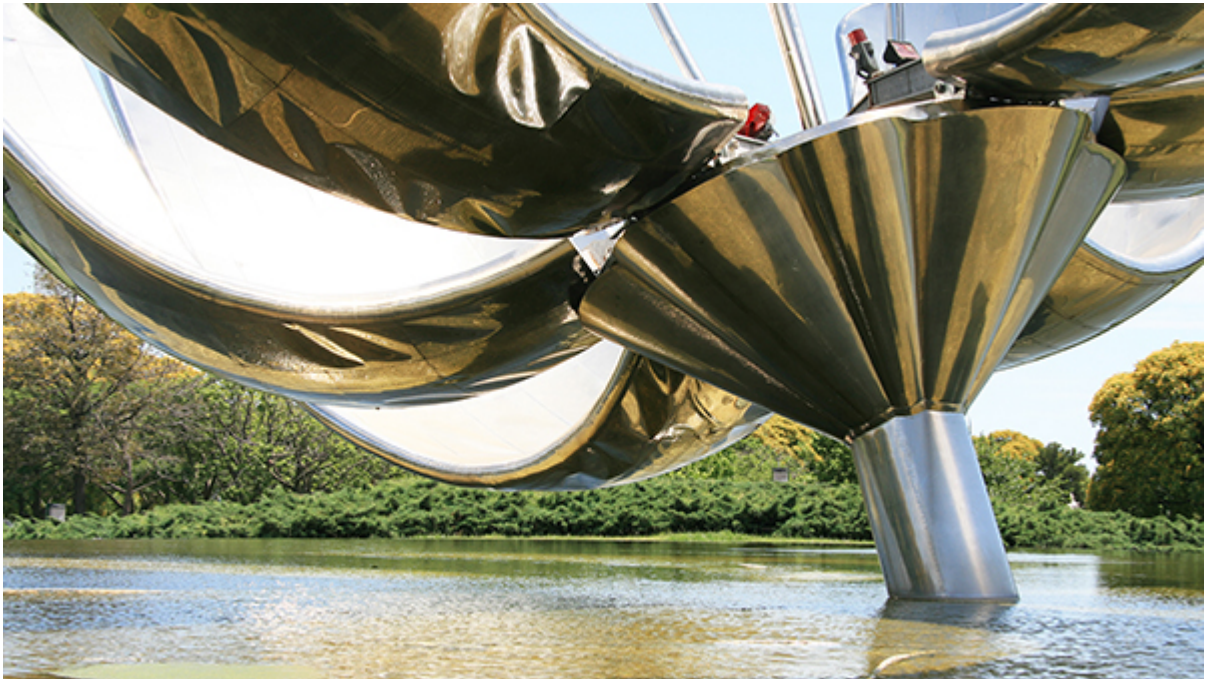
Floralis Genérica – Detail