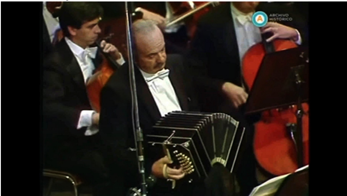
Piazzolla at Teatro Colon

This entry was posted on Wednesday, May 5th, 2021 at 12:28 pm and is filed under Film , Architecture , Music