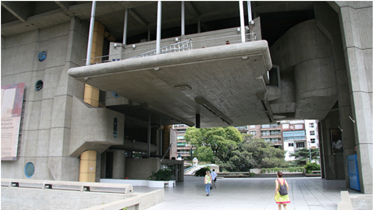
National Library – Entrance