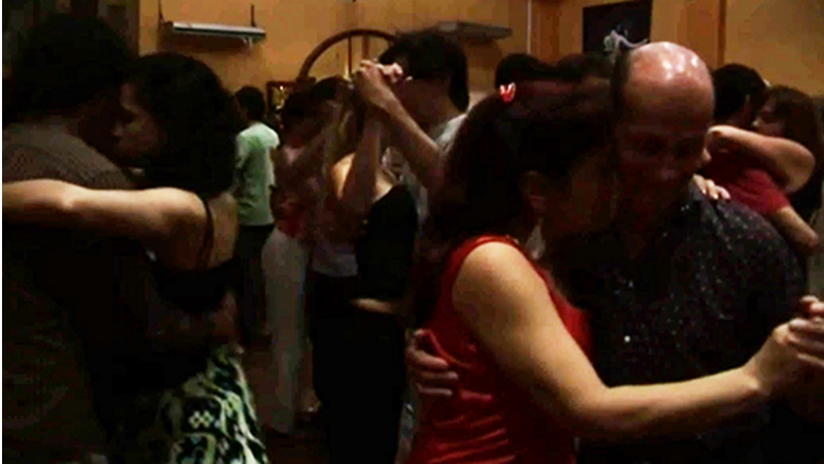
Popular Tango Dancing