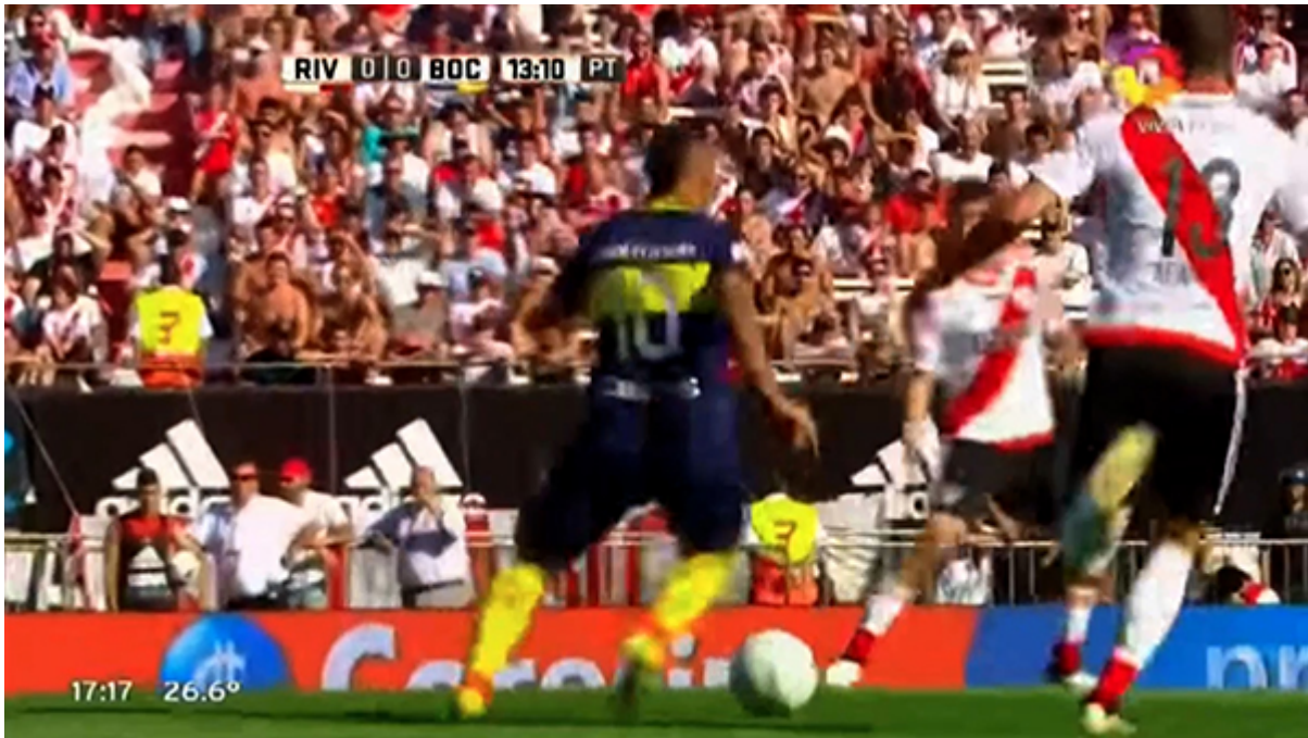
River vs. Boca