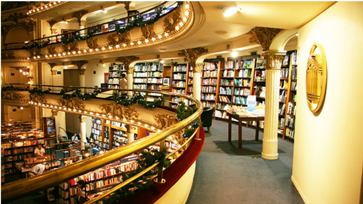
El Ateneo Splendid Bookstore

The film includes an abridged version of a poem I wrote in 1988, Porteño . It portrays how I then saw some aspects of my upbringing. You may read the unabridged version rolling down towards the end on http://meghiddoarchitects.com/selected-poems/ .