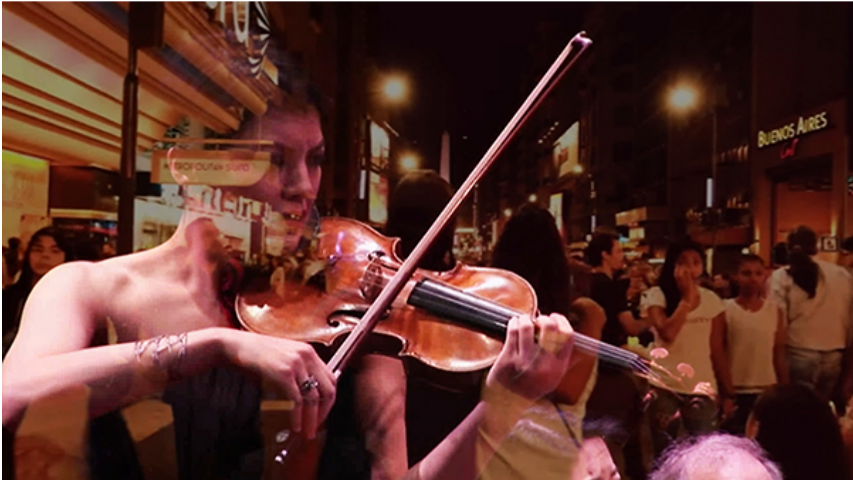
Buenos Aires at Night