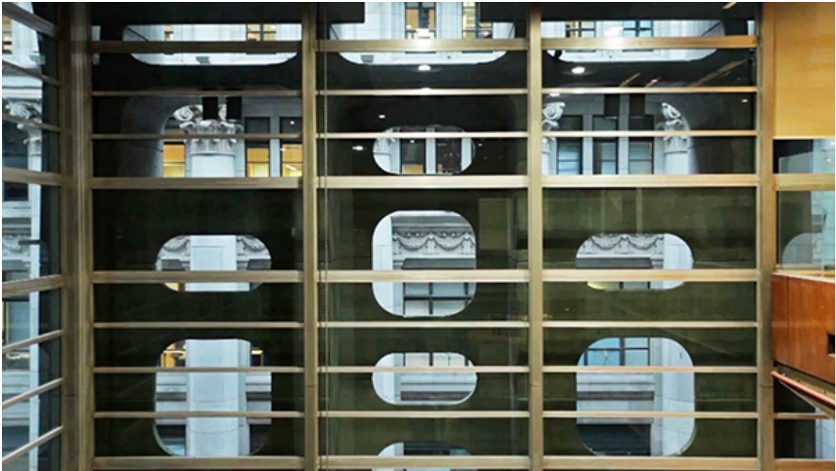
Bank of London – Interior Detail