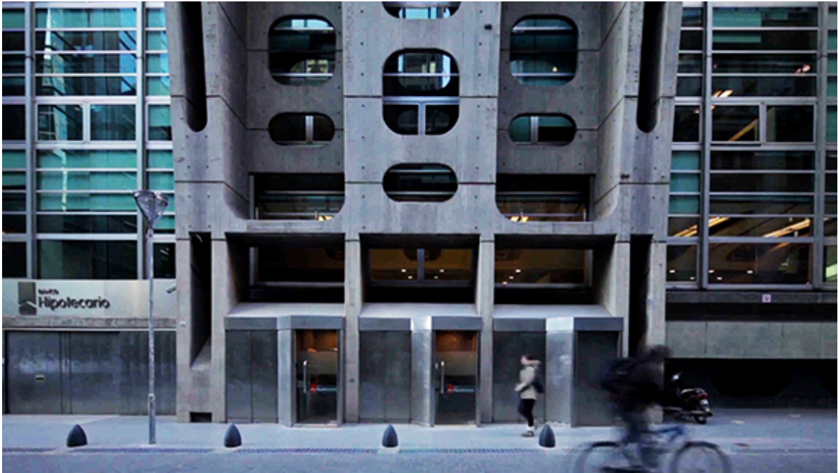
Bank of London – Detail