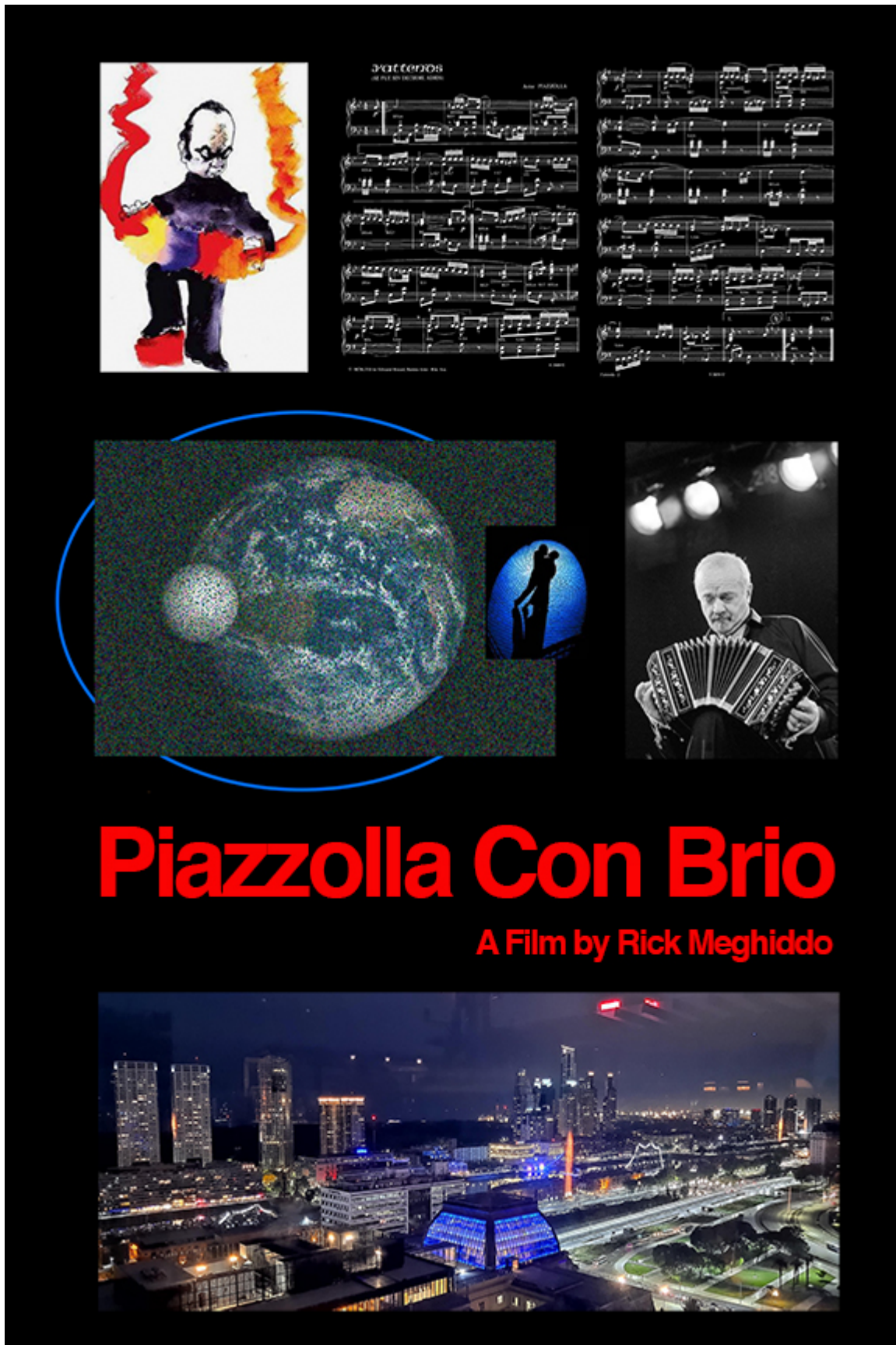
Piazzolla Con Brio – Poster