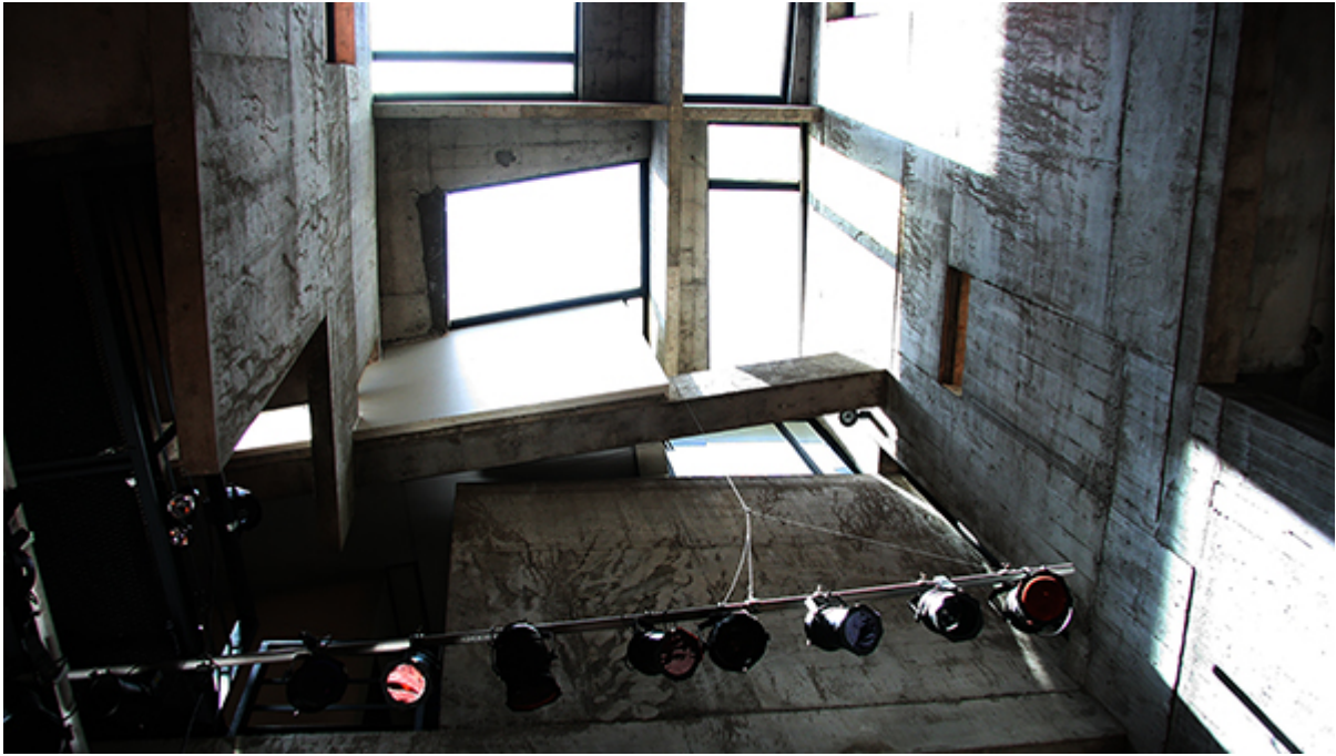
Xul Solar Museum – Detail