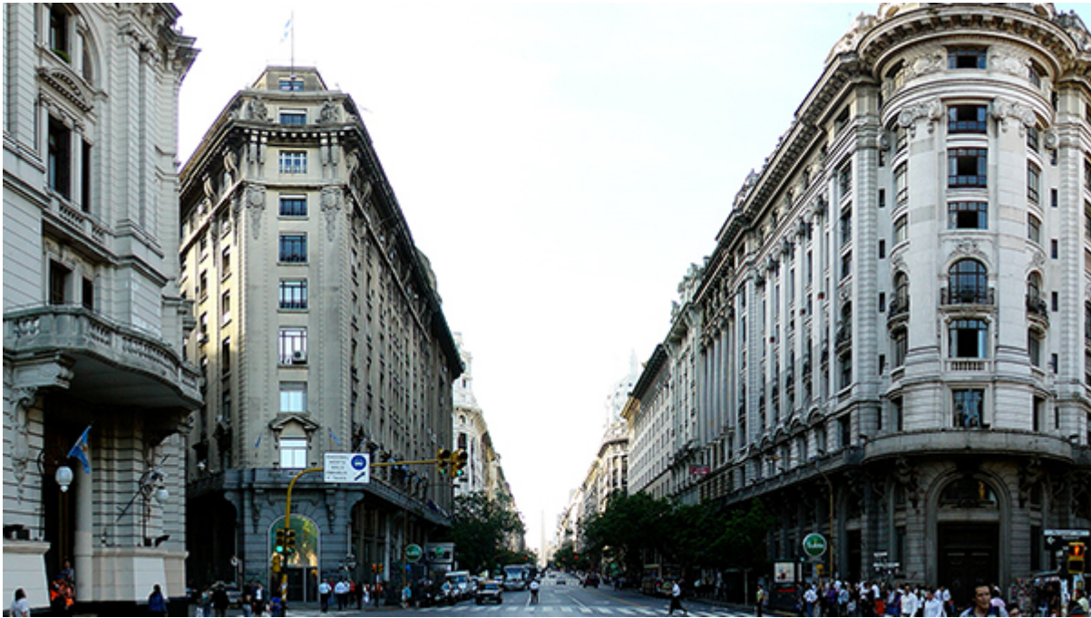
Buenos Aires Boulevard

Buenos Aires molds the identity of its inhabitants, who see themselves as more European than Latin American. Italy exerts the most potent cultural influence, but Buenos Aires is a complex place that includes great architecture, art and has more bookstores per habitant than any other city in the world. Its people are also passionate about soccer, meat, pizza, wine, ethnic food, and, yes, tango.