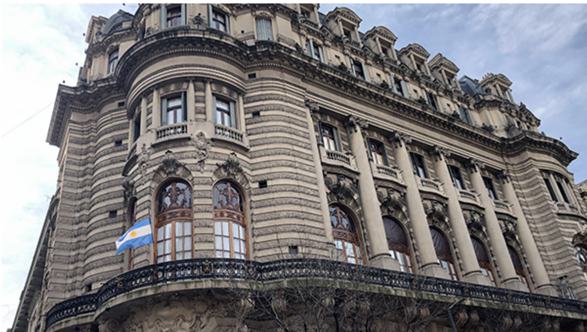
Classical Buenos Aires Building