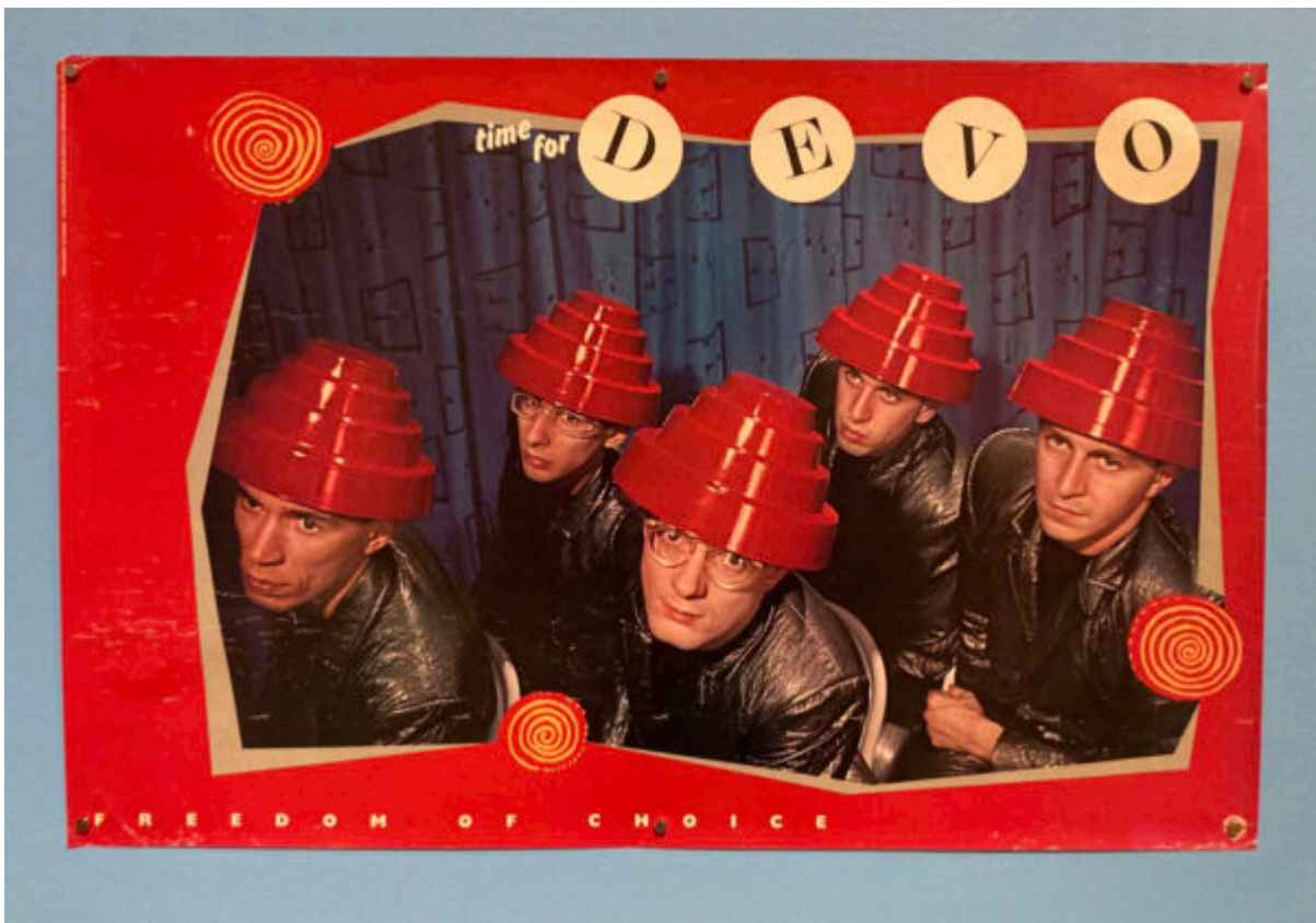
Devo poster at Skirball

The final note from Skirball concludes: Punk is not a sound, it's an attitude, outside the mainstream.