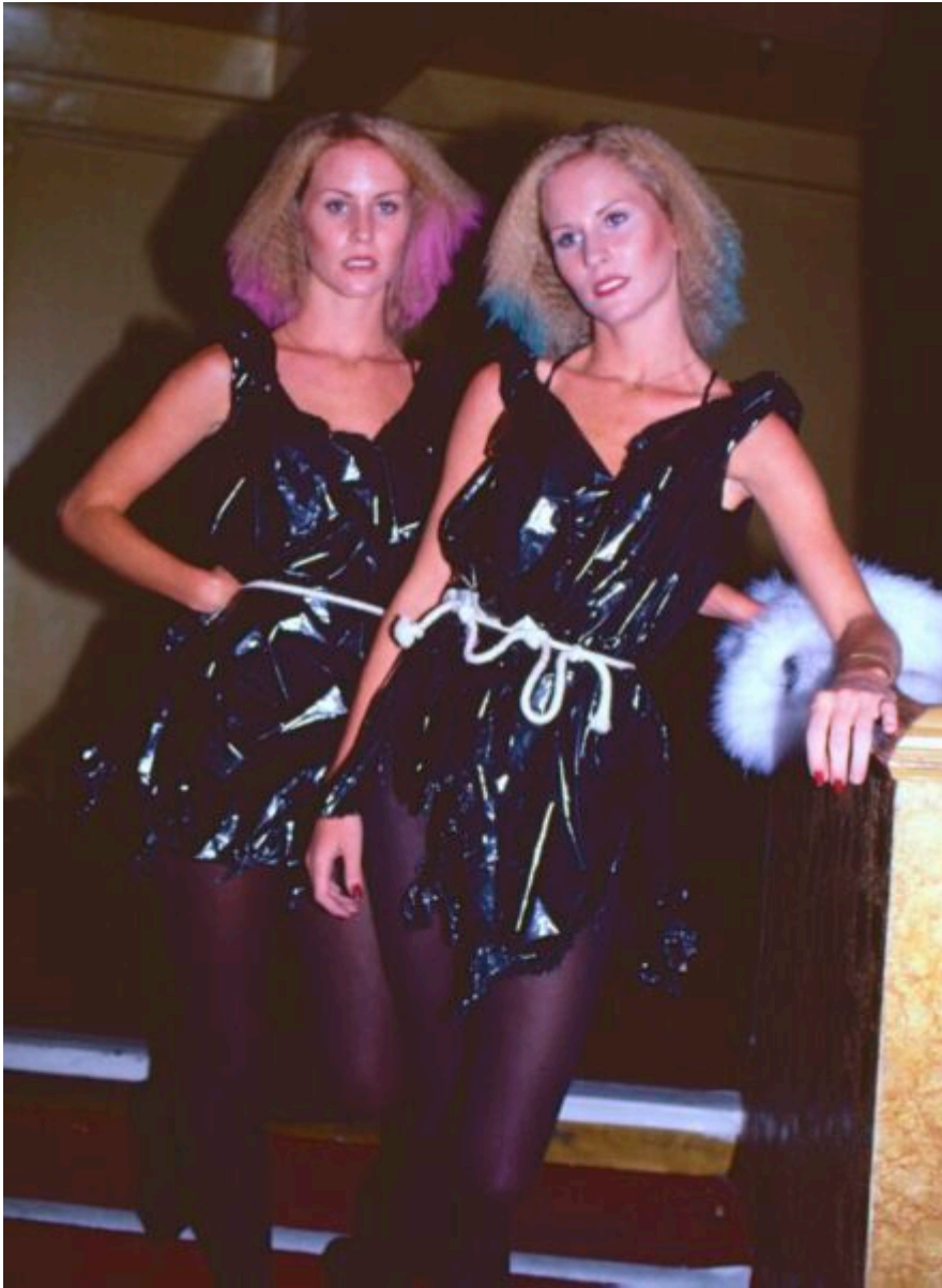
Punk Fashion show

In Los Angeles I photographed a punk fashion show at the Hollywood Palladium in 1977.