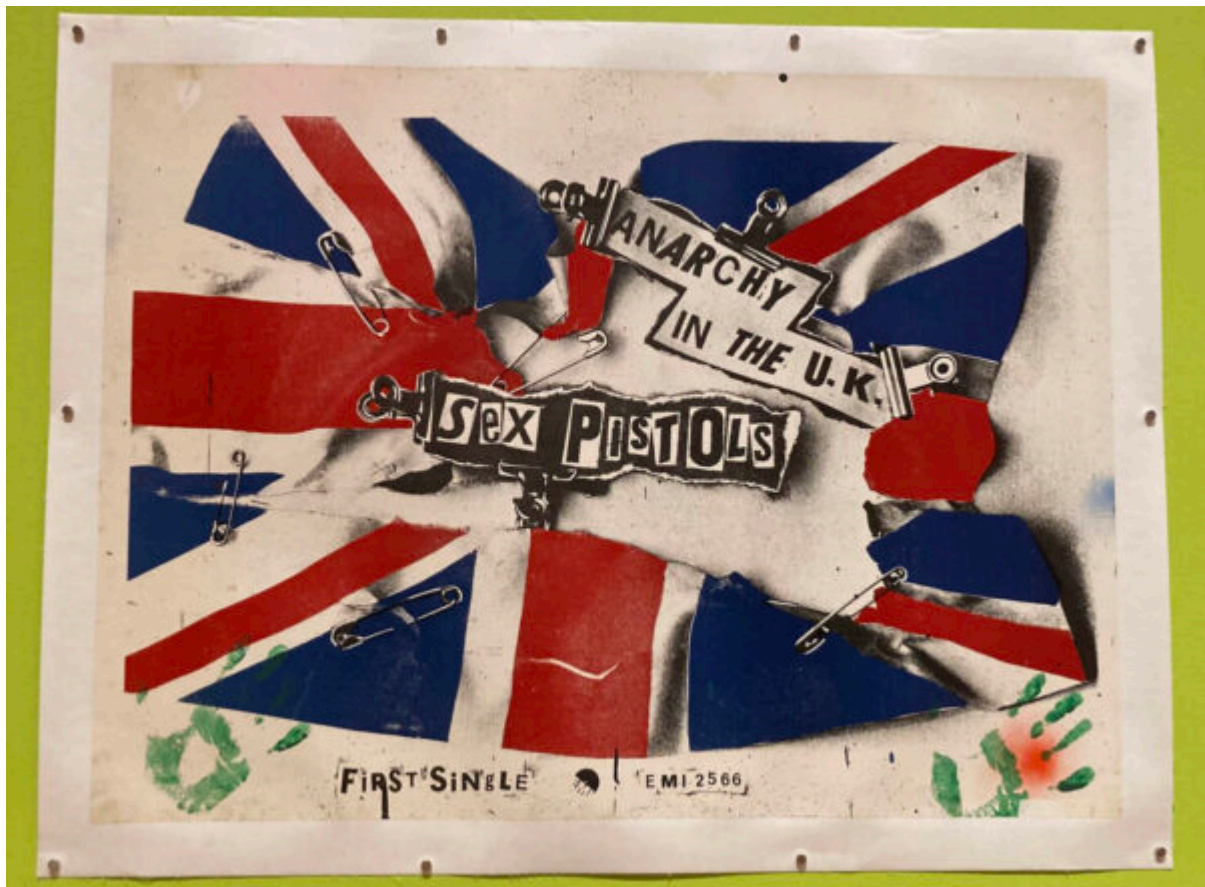
Sex Pistols poster at Skirball