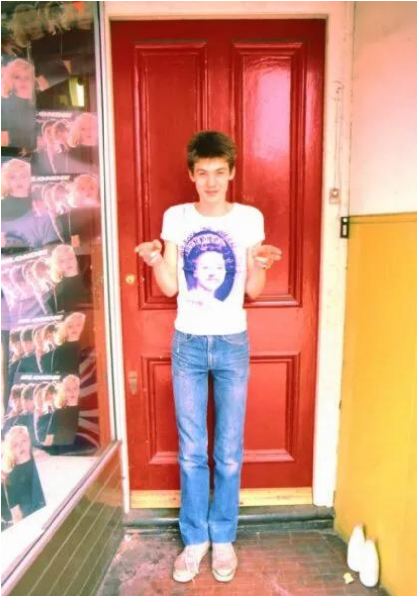
Punk kid on Kings Road