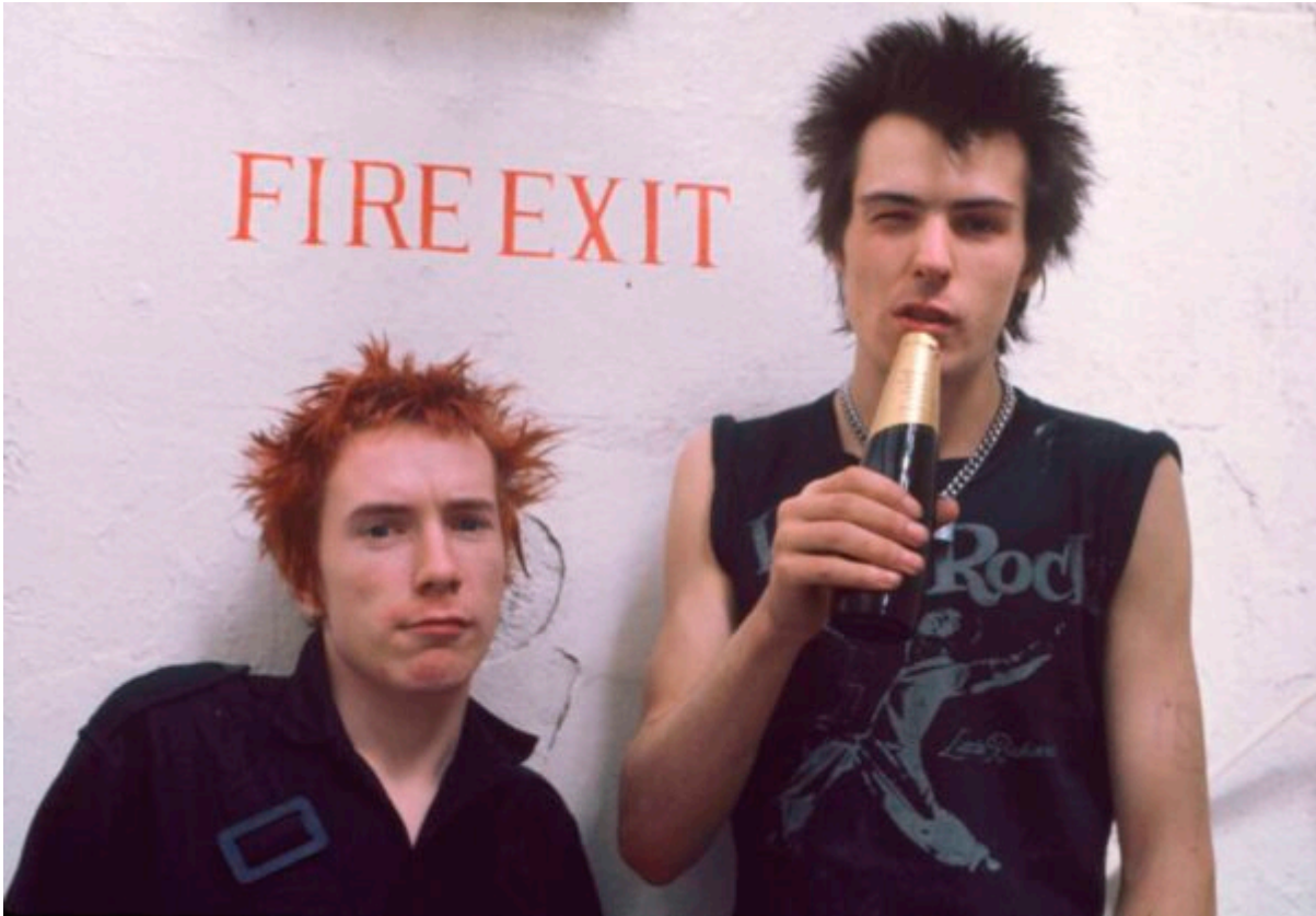
Sex Pistols-Johnny Rotten, Sid Vicious

Johnny Rotten and Sid Vicious of the Sex Pistols,