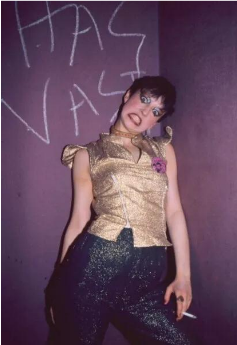
Punk rock fan at the Roxy

Punk boutiques and punk kids on Kings Road.