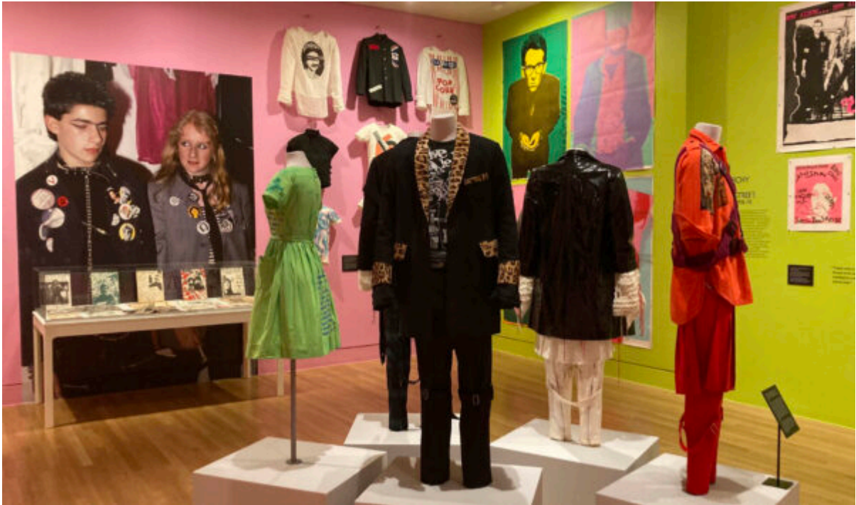
Punk fashion at Skirball

“Outsiders, Outcasts, Rebels + Weirdos: Punk Culture 1976-86” (May 20–September 6) examines Proto-Punk in New York 1975-77, including Patti Smith and the Ramones, because of their Jewish ancestry, UK Punk 1976-78, LA Punk Venues 1977-1984, such as the Masque in Hollywood and Madame Wong in Chinatown, New Wave 1979-1982, the term was used interchangeably with punk, etc.