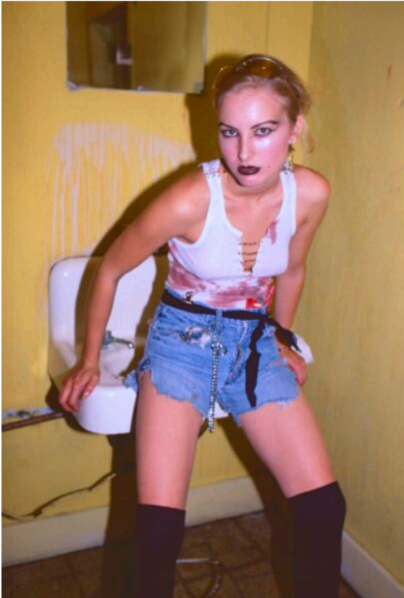
Punk girl