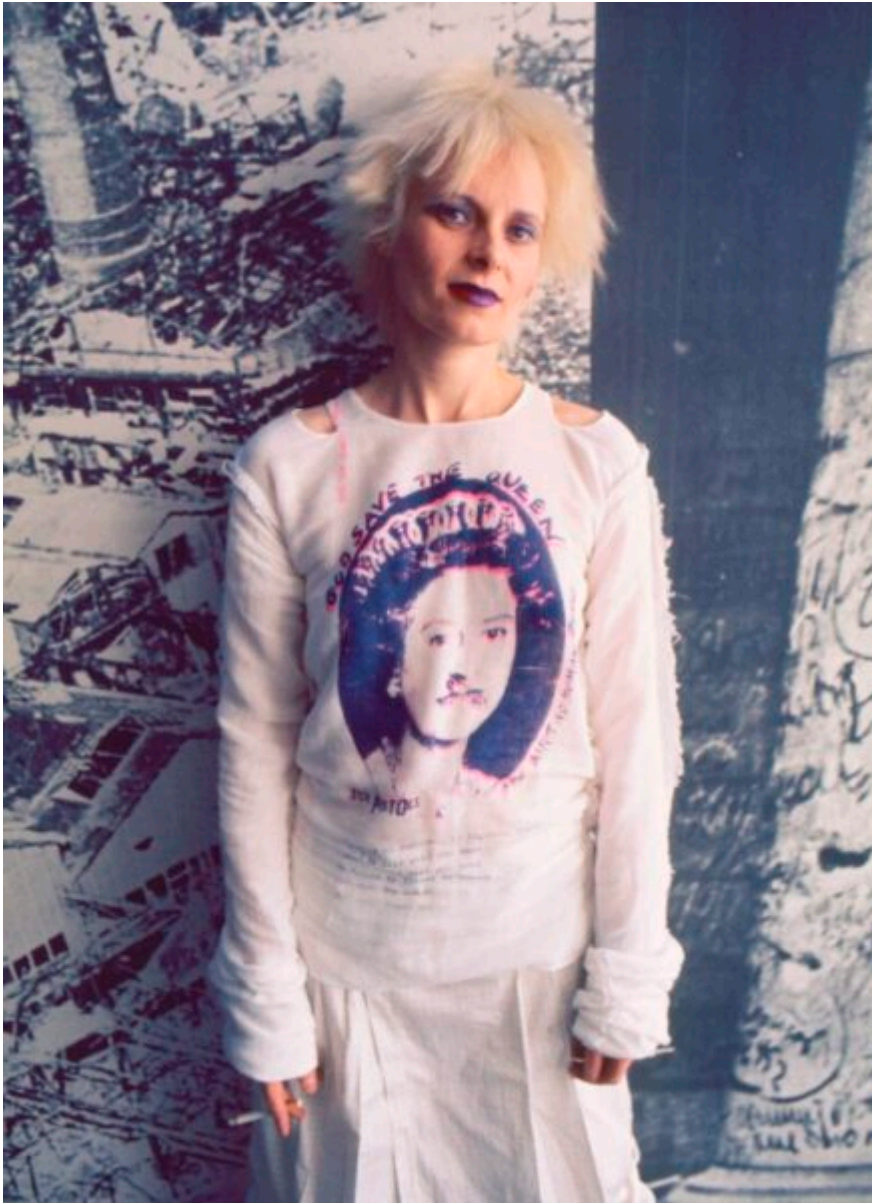
Vivienne Westwood

I met Malcolm McLaren and Vivienne Westwood,