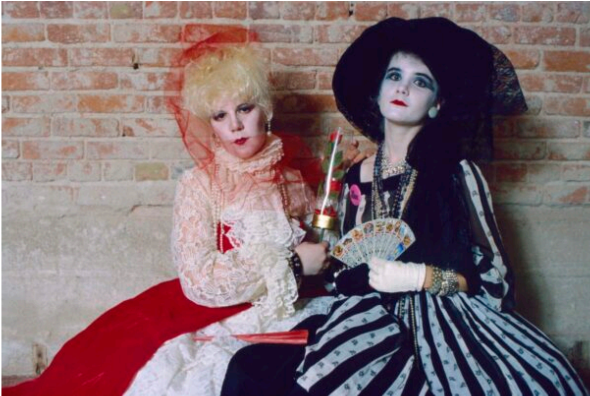
New Romantics-Club Lingerie

The final note from Skirball concludes: Punk is not a sound, it's an attitude, outside the mainstream.