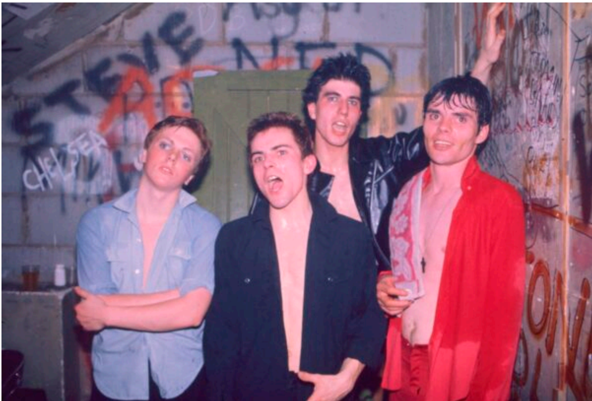
Chelsea

Johnny Rotten and Sid Vicious of the Sex Pistols,