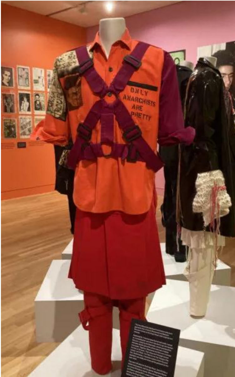
Punk outfit at Skirball

The black caption explains that Vivienne Westwood and Malcolm McLaren, who was raised by his Sephardic Jewish grandmother, invented the look of UK punk. The Skirball Museum collects art and objects that reflect Jewish life.