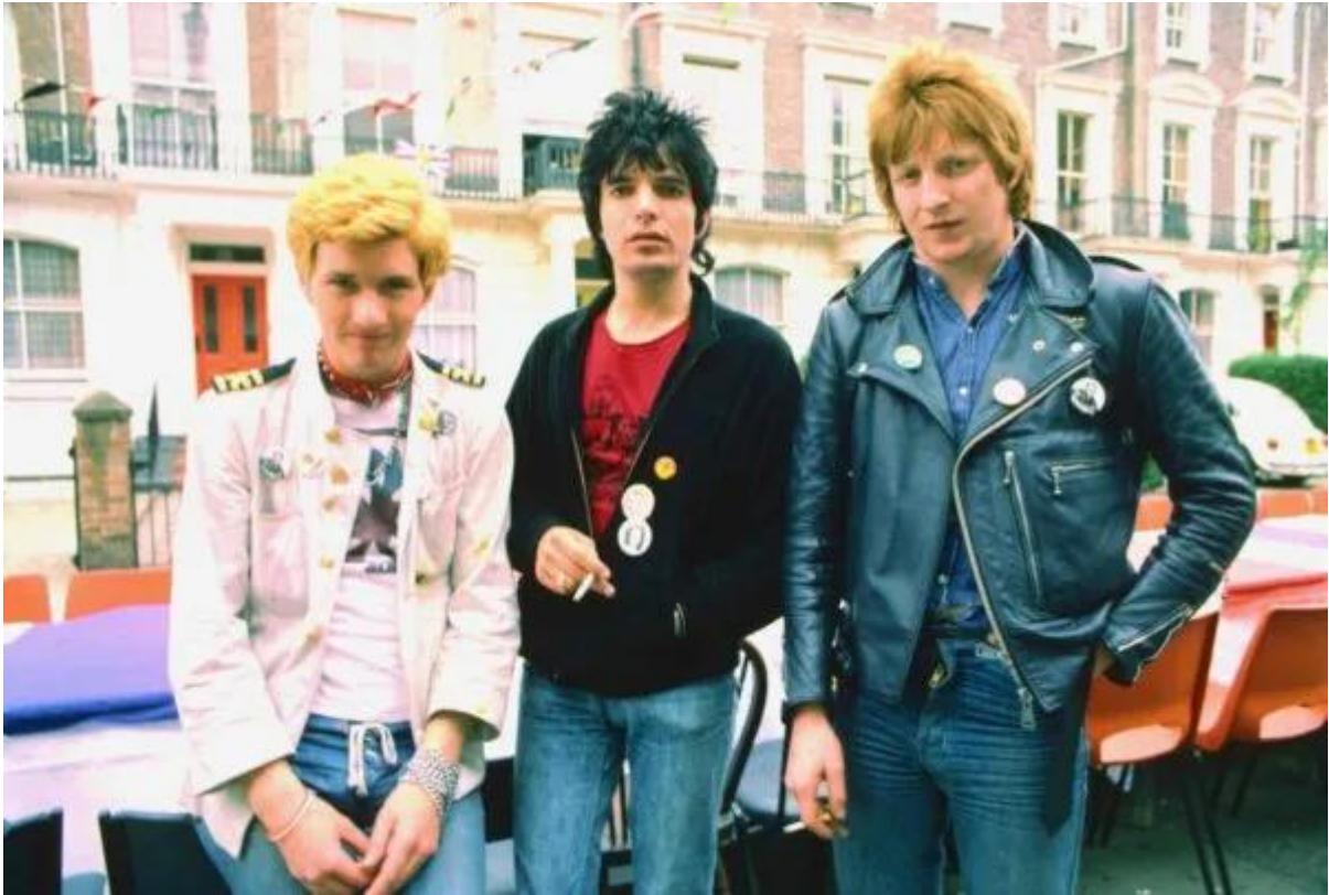
The Damned