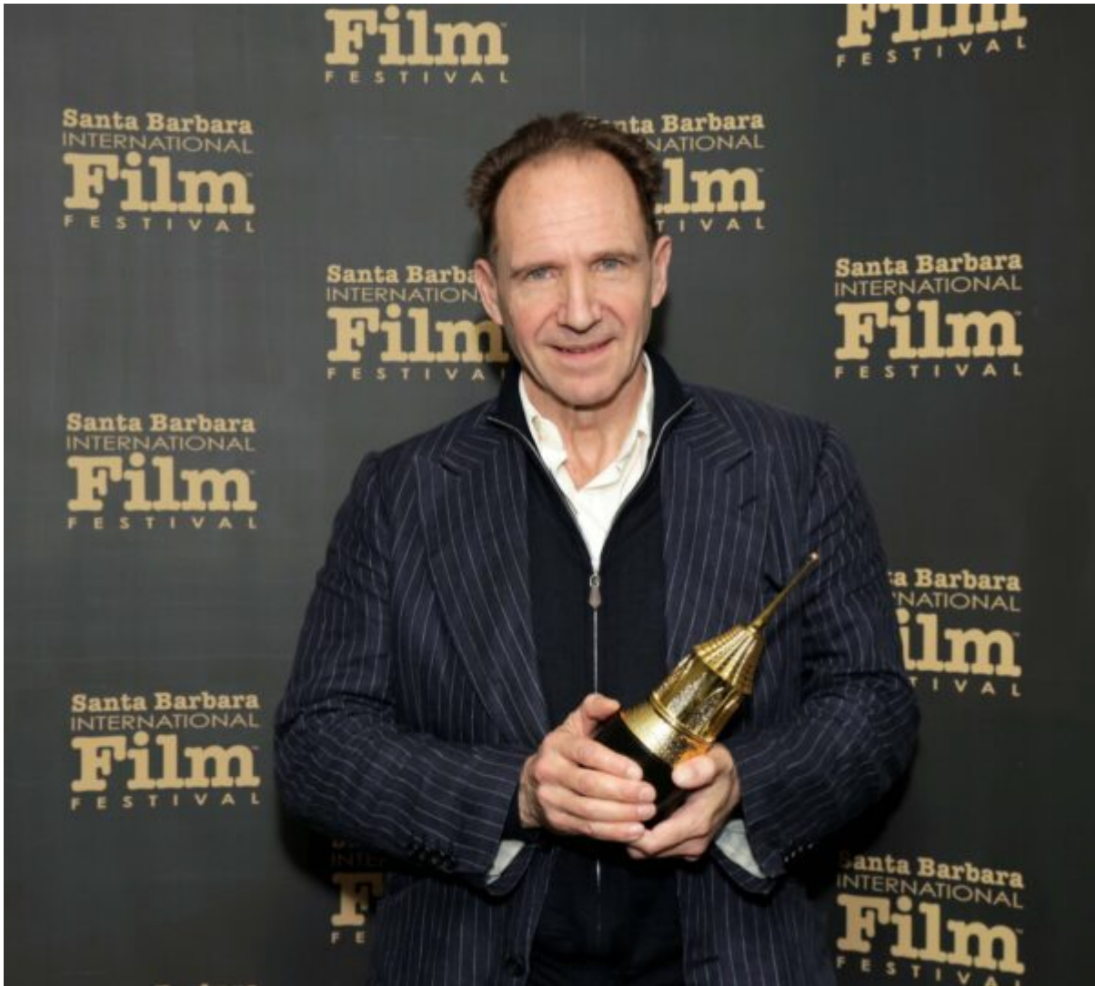
Ralph Fiennes