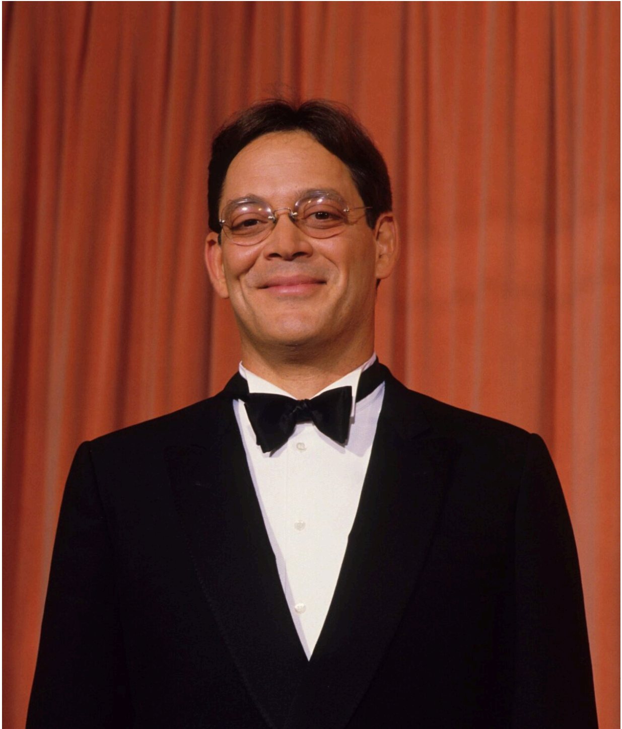
Raúl Juliá

“My basic involvement is ‘The Hunger Project’, an organization committed to ending hunger in the planet, that also inspired the ‘End Hunger Network’ that Jeff Bridges is involved with. It creates an atmosphere, through communication and education and inspiration, for people to find out their own more appropriate form of participation, how they can best contribute to the end of hunger.”